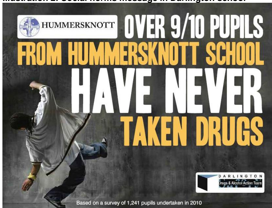
Illustration 2: Social norms message in Darlington school