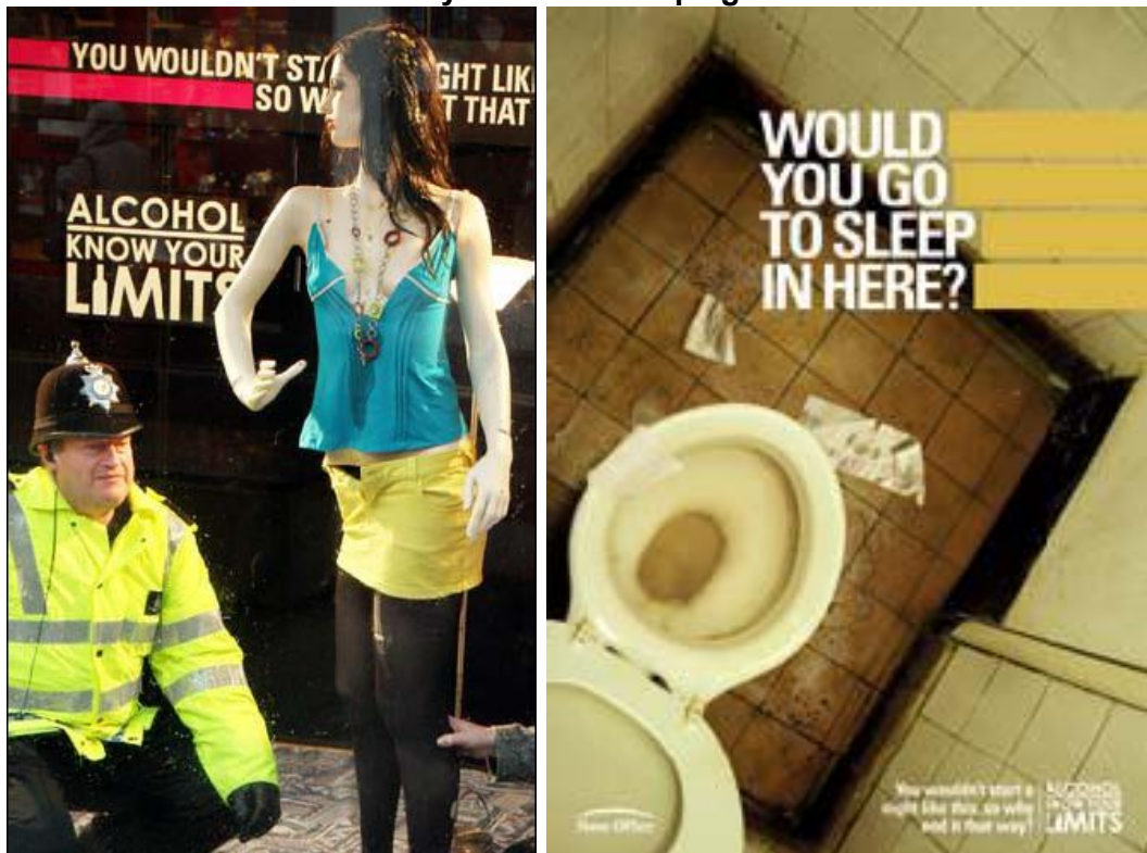
Illustration 3: Alcohol 'know your limits campaign'

Despite the government efforts to raise awareness of the harmful effects of alcohol misuse, when asked about safe drinking limits 10 out of 25 five respondents did not know what this was. This does not necessarily mean that information was not accessible, as this research discussed in chapter seven exposure, to information does not necessarily lead to learning and learning does not necessarily lead to modification of behaviour.