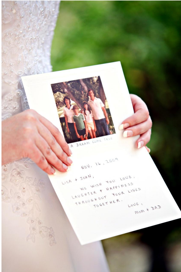
Illustration 4.4. A Dream Come true.

this local young woman and the two brides noted above, “Cinderella” brides because their relationship to the plantation in many ways echoes the plot of the famous folktale. 21 Living in