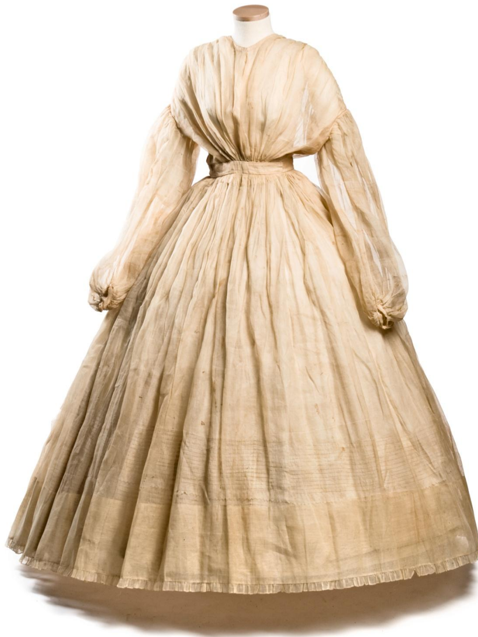
Illustration 1.5. Louisa McCord's wedding gown.