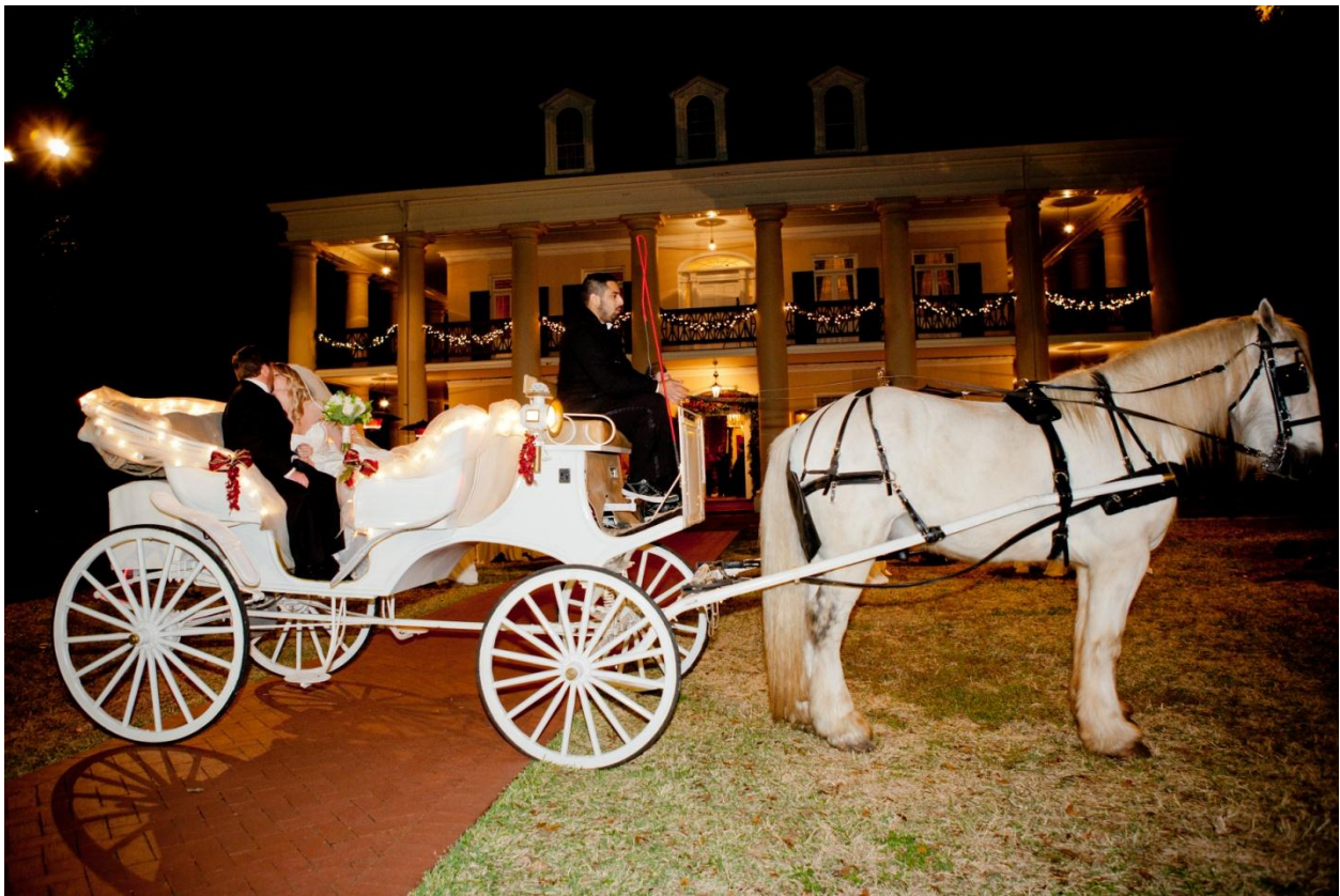
Illustration 4.7. The Carriage Entrance at Oak Alley.

a circle under one of the grand oaks and deposited the bride and her father on the walkway. This type of entrance is considered to be highly romantic.