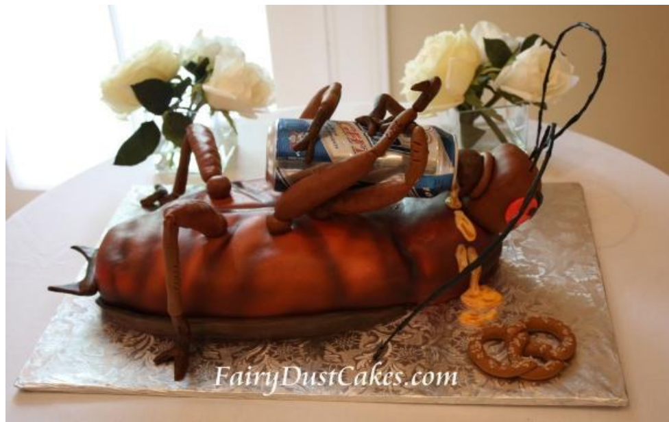
Illustration 4.5.

The most unusual groom’s cake Kiger-Smith constructed was a giant cockroach, lying in its back cradling a can of beer in between its many legs.