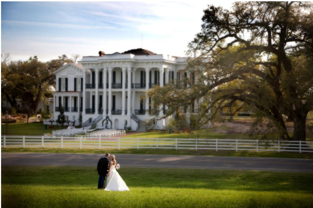
Illustration 4.2. The Plantation Mystique.

The bride may be standing or seated, but as a vision in white, she is always framed within and in contrast to the natural landscape. In other photographic styles, the bride is foregrounded in the portrait with only a side view or fleeting glimpse of the home included. Even though these shots contain remote images that offer mere glimpses of the plantation home, the association connecting her to the residence is still strongly suggested. Projected in that image is the idealized presentation of the plantation landscape with its moss-draped trees and a full display of the antebellum home with classic columns, entablature and pediments. These bridal images not only convey an antebellum period feel of the past but they simultaneously move the past into the present by connecting historical evidence of an earlier period to the present natural grace and beauty of the landscape.