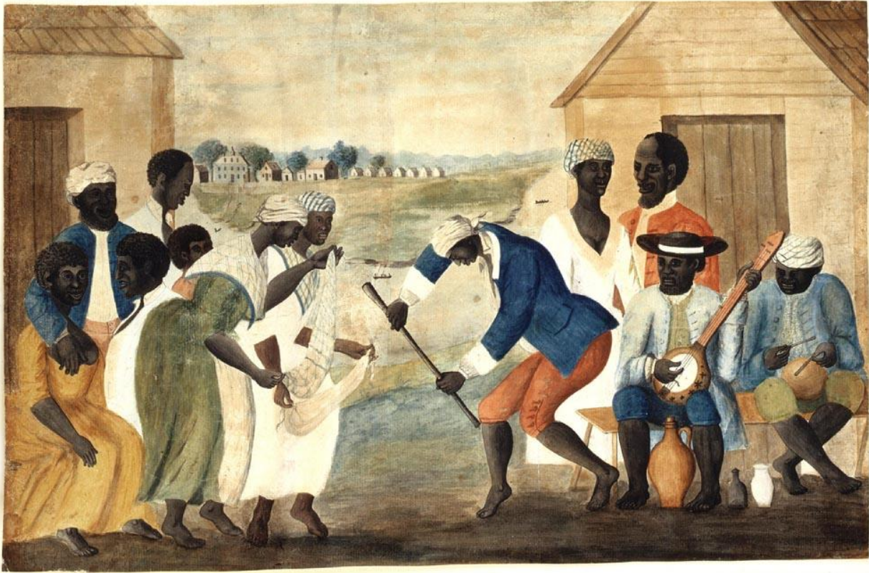
Illustration 2.4. The Old Plantation. Attributed to John Rose around 1785 – 1795