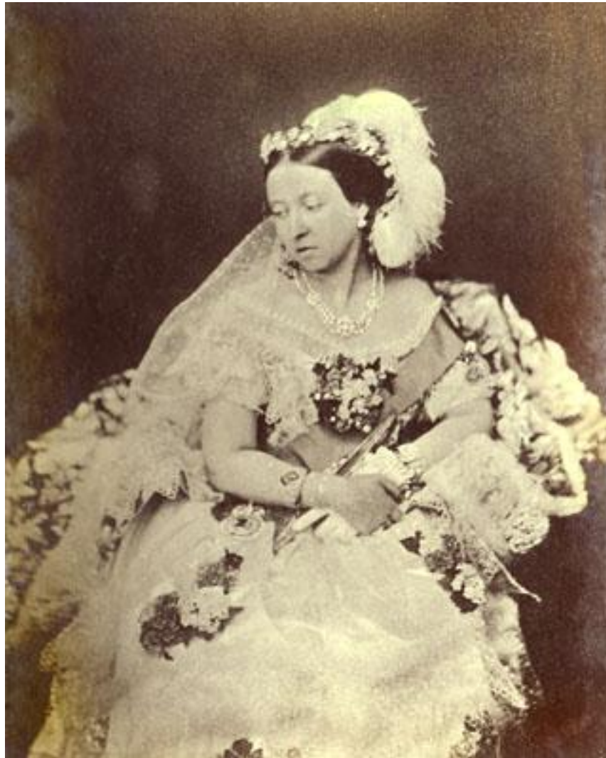
Illustration 1.3. The young Queen Victoria in her wedding gown

creamy-white silk satin court dress embellished with lace, choosing Spitalfields silk from London and Honiton lace made in Devon to demonstrate her support for British manufactures. Instead of wearing the crimson velvet robe of state, she opted for a white satin court train bordered with sprays of orange-blossoms and in place of a circlet, she wore a deep wreath of artificial orange-blossom with a Honiton lace veil pinned to the back of her head.” 66