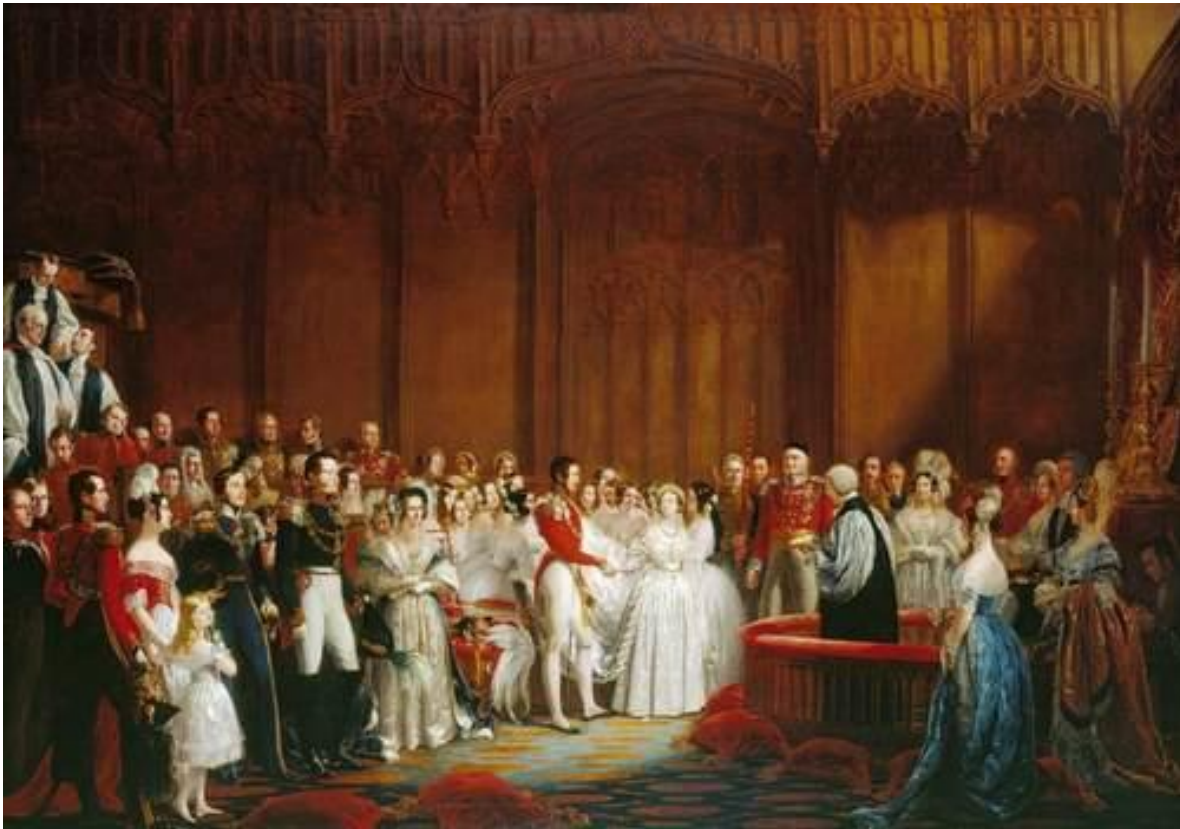
Illustration 1.4. George Hayter, The Marriage of Queen Victoria and Prince Albert 10 February 1840.