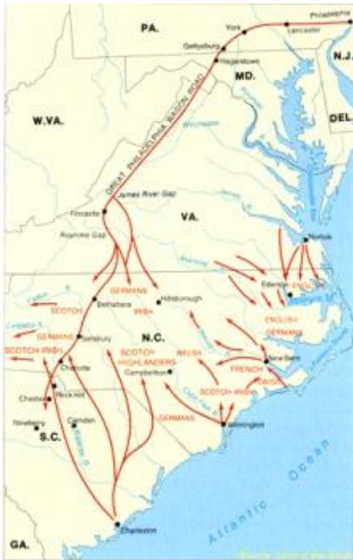
Illustration 2.5. Scot-Irish Settlement