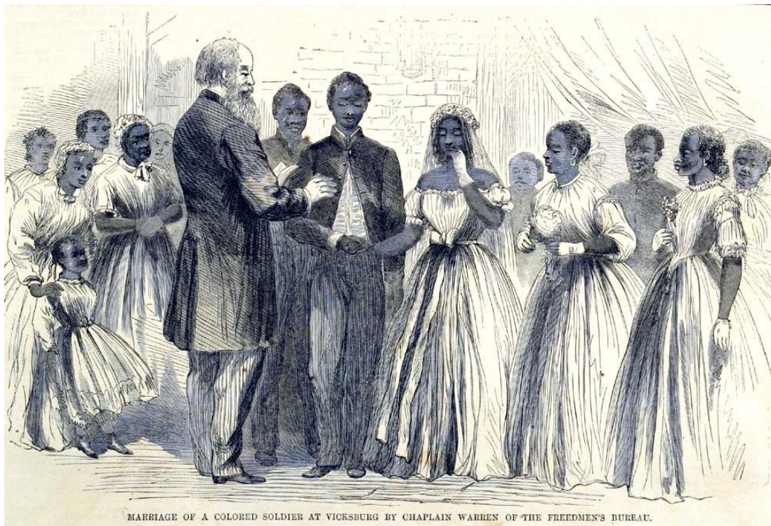
Illustration 2.1. Marriage of a Colored Soldier at Vicksburg by Chaplain Warren of the Freedmen’s Bureau. Paper and pencil drawing by Alfred C. Waud, for Harper’s Weekly Magazine . Original in The Historic New Orleans Collection . June 1866.

overturned by new Americanized laws based on English Common Law. 19 Thus, in 1806, the first governor of the Louisiana Territory, William C. Claiborne passed a new Black Code . Hereafter, “American rule initiated an era of diminished rights for slaves as Louisiana planters suddenly found themselves in a position to make their own laws” (Schafer 6). In 1825, this legal redirection culminated in the passage of the Civil Code for the State of Louisiana which determined that slave marriages “did not produce any civil effects” (Schafer 302).