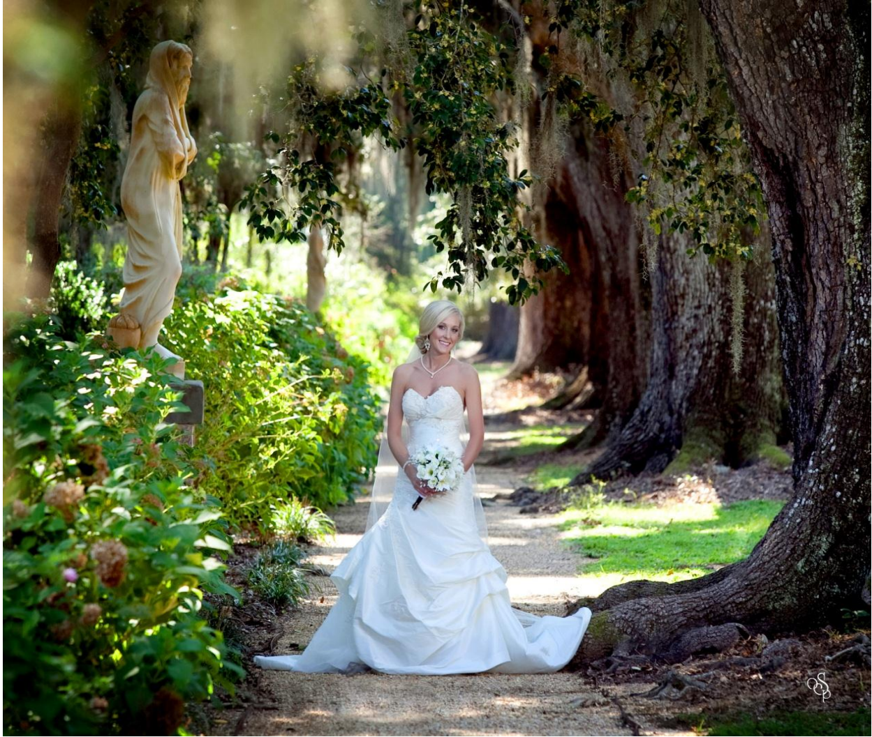
Illustration 4.3. The Plantation Mystique.

River Road offers visitors an exploration into a mythical past and a glimpse into a bygone era.” 17 Suggestive of common southern tropes that employ adjectives such as “long,” “silvery” and “drooping” to characterize the southern ecosystem that privileges the symbiotic relationship between Spanish moss and the stately, enduring, legendary oak trees, numerous images of this combination abound not only in southeastern Louisiana tourism literature but also, as we have