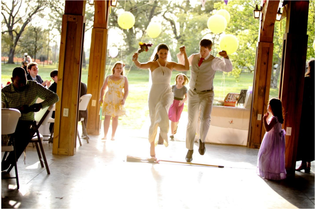
Illustration 4.8. Jumping the Broom.

When I asked the students in my folklore class, many recalled seeing couples jump the broom at Cajun weddings of family members or friends. They also shared another broom tradition. If a younger sister is the first to marry, the older brother is required to dance with a broom during the reception. Here the broom is a symbol of domesticity and through the properties of sympathetic magic, the hope is that the elder son will be “exposed” to marriage. 74 For the wedding at