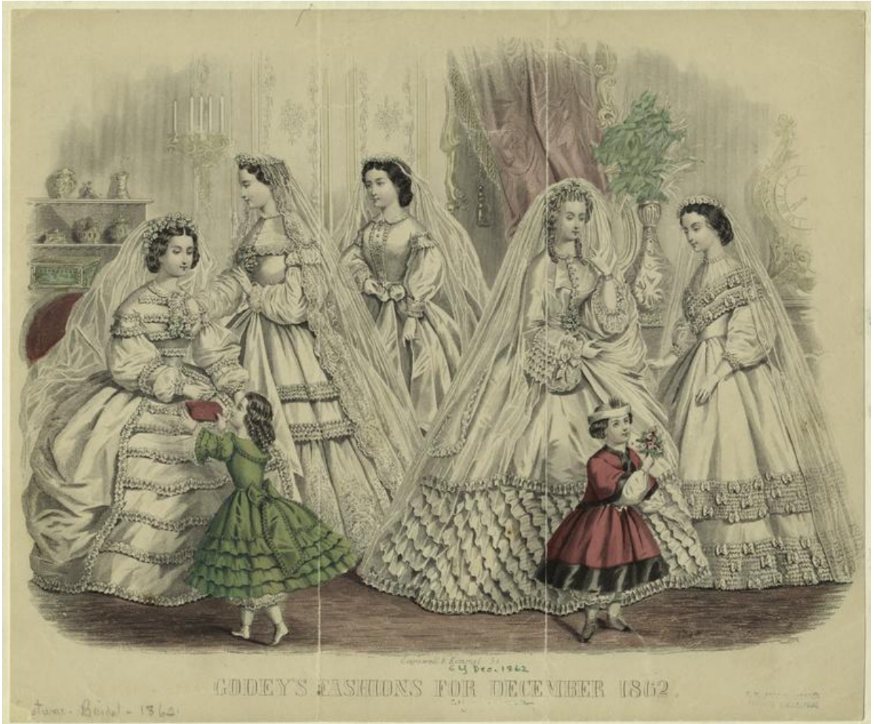
Illustration 1.2 Godey's Lady's Book , December 1862