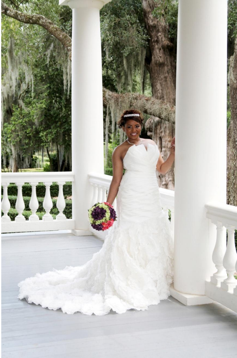
Illustration 4.6. African American bride at Rosedown

Destination Culture: Tourism, Museums and Heritage , crafts an evolving definition of heritage.