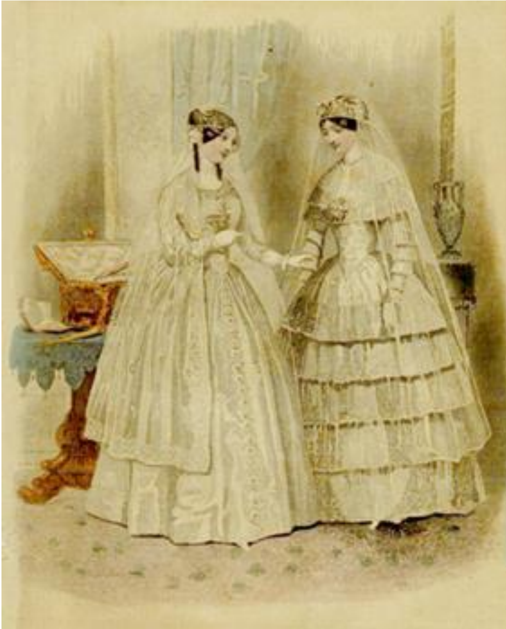
Illustration 1.1. Godey's Lady's Book , March 1850

wedding gown, most southern women found such substantial yardage almost impossible to obtain.