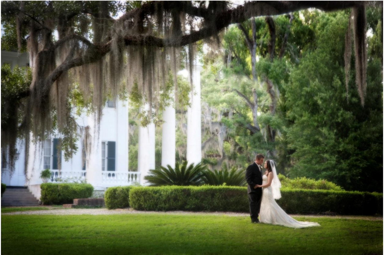
Illustration 4.1. The Plantation Mystique.

the background of the verdant landscape. Not only is the bride in all her splendor on display but the plantation landscape is also on exhibit. The connection of the bride with the landscape performs a visual rhetoric, situating the bride as a symbol of perfect femininity in a position of southern social power. Images operating on the plantation mystique consistently form a photographic bricolage that positions the bride, sometimes alone or with her groom, with family members or with her female bridal attendants, on a naturalized green and often brilliantly flowering landscape.