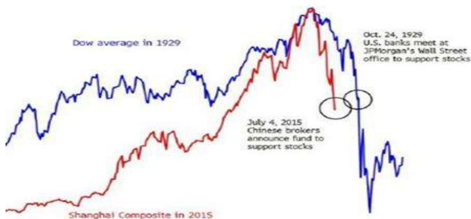
Figure 1: Comparison of 2015 market crash and the 1929 financial crisis

(Hexun Network: http://news.hexun.com/2015-12-12/181156516.html )