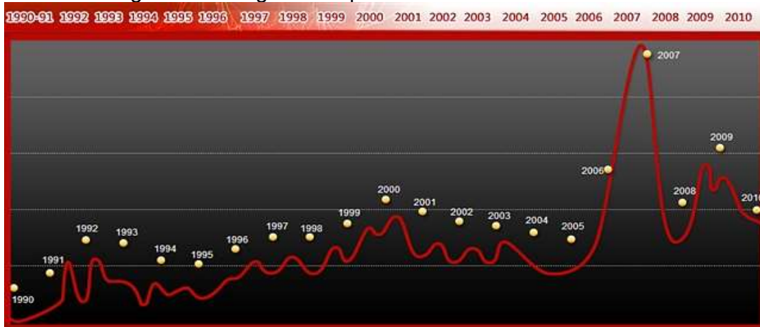
Figure 3: Shanghai Composite Index from 1990 to 2010