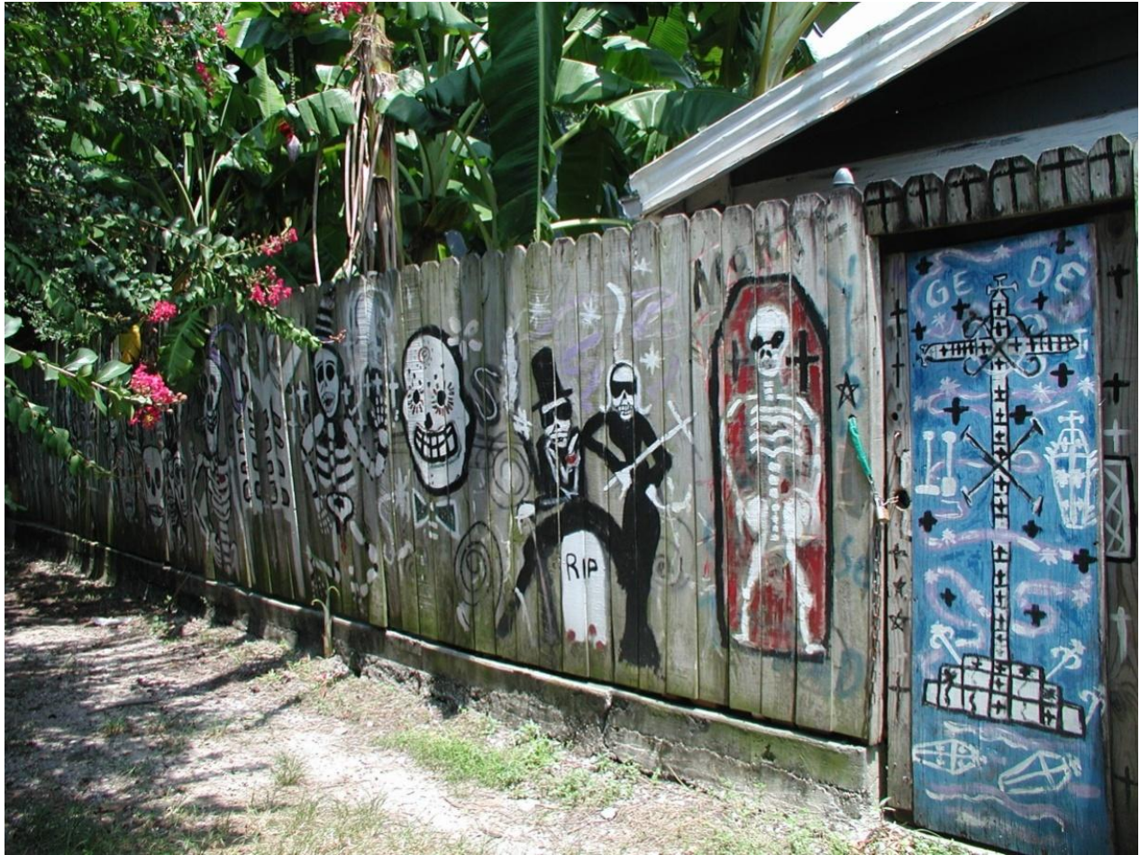
Figure 10 Mural along alley leading to peristyle . Notice the Gedes and veve .

Inside the peristyle , however, the building is quite different from the traditional New Orleans home (See figure #11). The door from the alley opens up to the largest of the three rooms. The floors are grey concrete, the walls unpainted wood, and the ceiling open to the rafters. The walls are covered in sequined Haitian Vodou flags and paintings – the majority of which were painted by Manbo Sallie Ann . In the rafters hang three flags of Haiti, a neon jellyfish, and a bottle. Strings of party lights shaped like dragonflies have been hung on the walls and along the rafters. In the center of the main room is a concrete pillar that reaches up to the