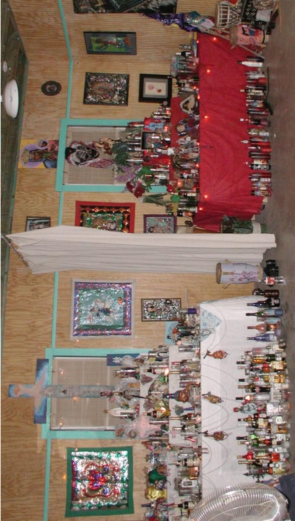
Figure 13 Petro and Rada altars. Lasiren is to the left and Gede to the right of the photograph. June 9, 2007.