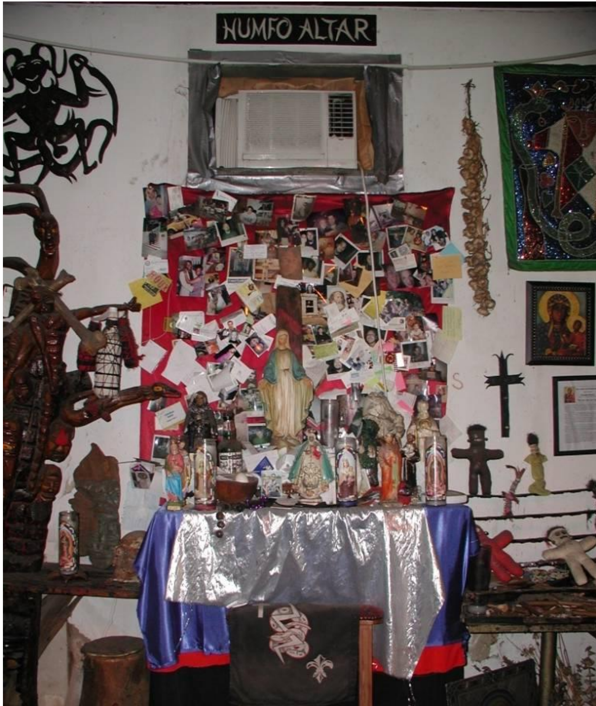
Figure 6 Humfo Altar at the New Orleans Historic Voodoo Museum. Photo taken by author April 7, 2007.