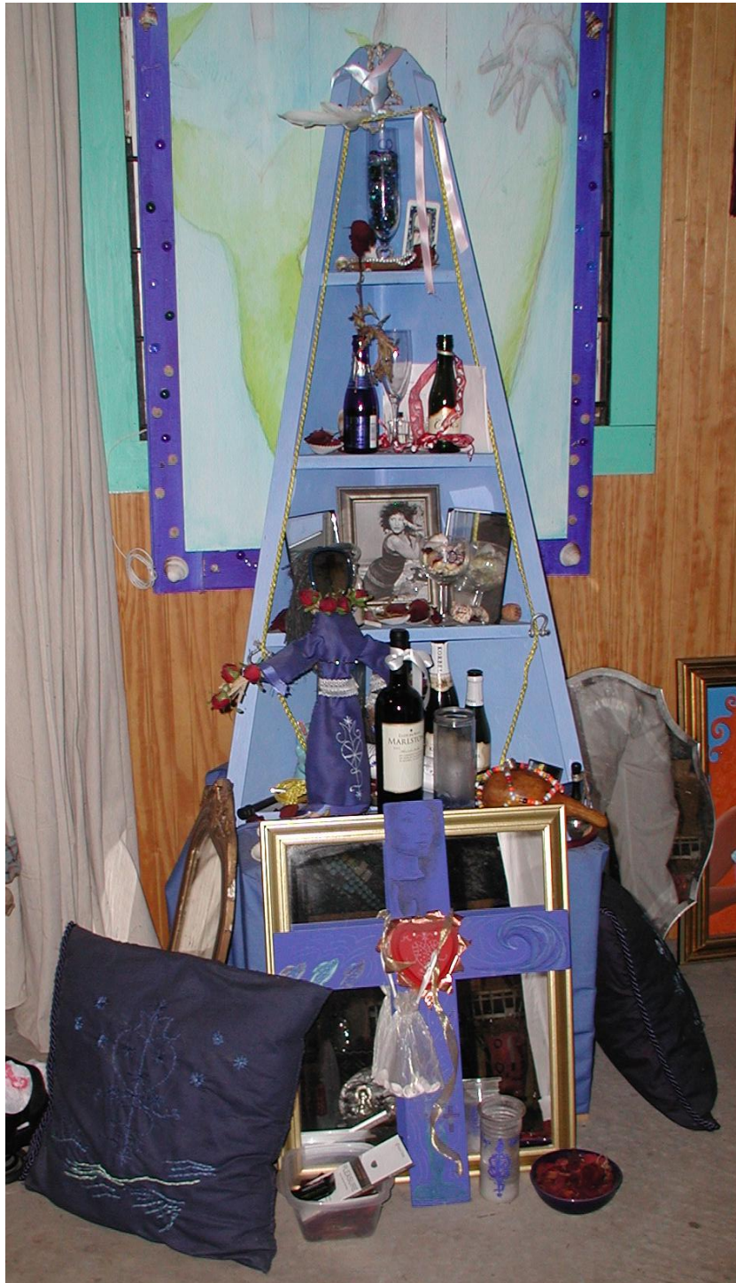
Figure 12 Altar for the mermaid Iwa Lasiren . Photo taken by author June 9, 2007.

the altar. Here, Vodouists can also pray to her and make offerings even when the ceremony is for a different Iwa .