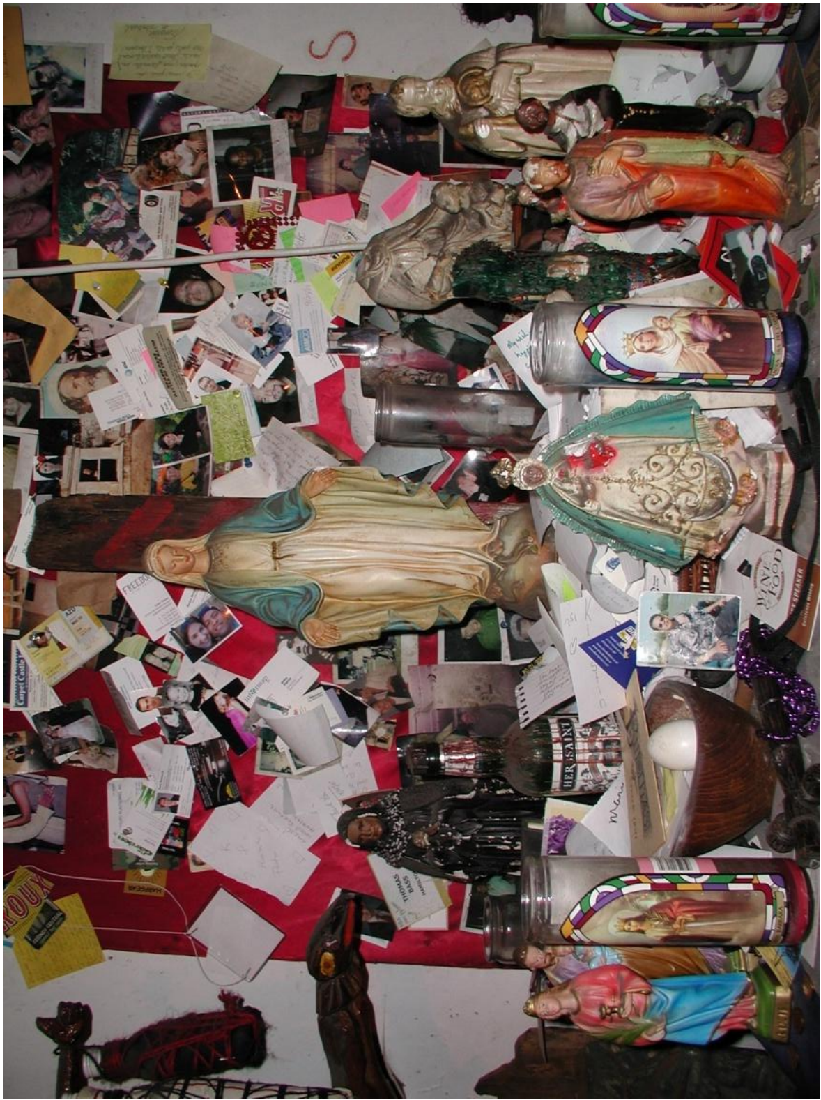
Figure 7 Close up of altar at museum. April 7, 2007.