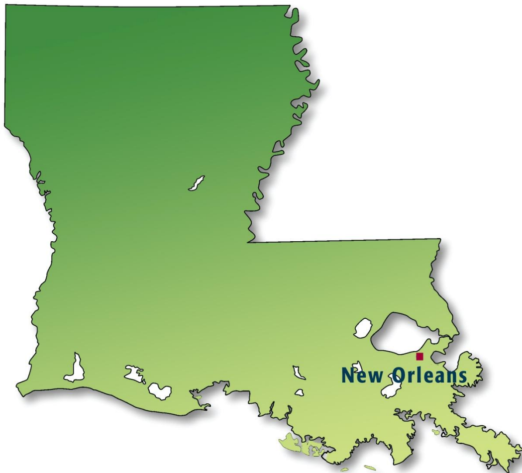
Figure 2 Map of Louisiana showing location of New Orleans. Drawing done by Jane Thomas and used with permission.

Territory in 1682, which at that time extended from Mississippi to Canada, the Rockies to the Gulf Coast to Texas. Louis XIV of France sent The Company of the Indies (also called the Company of the West) to explore the tract of land. They in turn hired Pierre Le Moyne, Sieur de Iberville and his brother Jean Baptiste Le Moyne, Sieur de Bienville to explore the land in 1718. These explorers established the city of La Nouvelle Orleans as the capital of this new French colony (See figure #2). In 1721, plans were made to lay the city out in an orderly grid fashion with what are now called St. Louis Cathedral and Jackson Square as the center and most prominent features of the town (Long 2006).