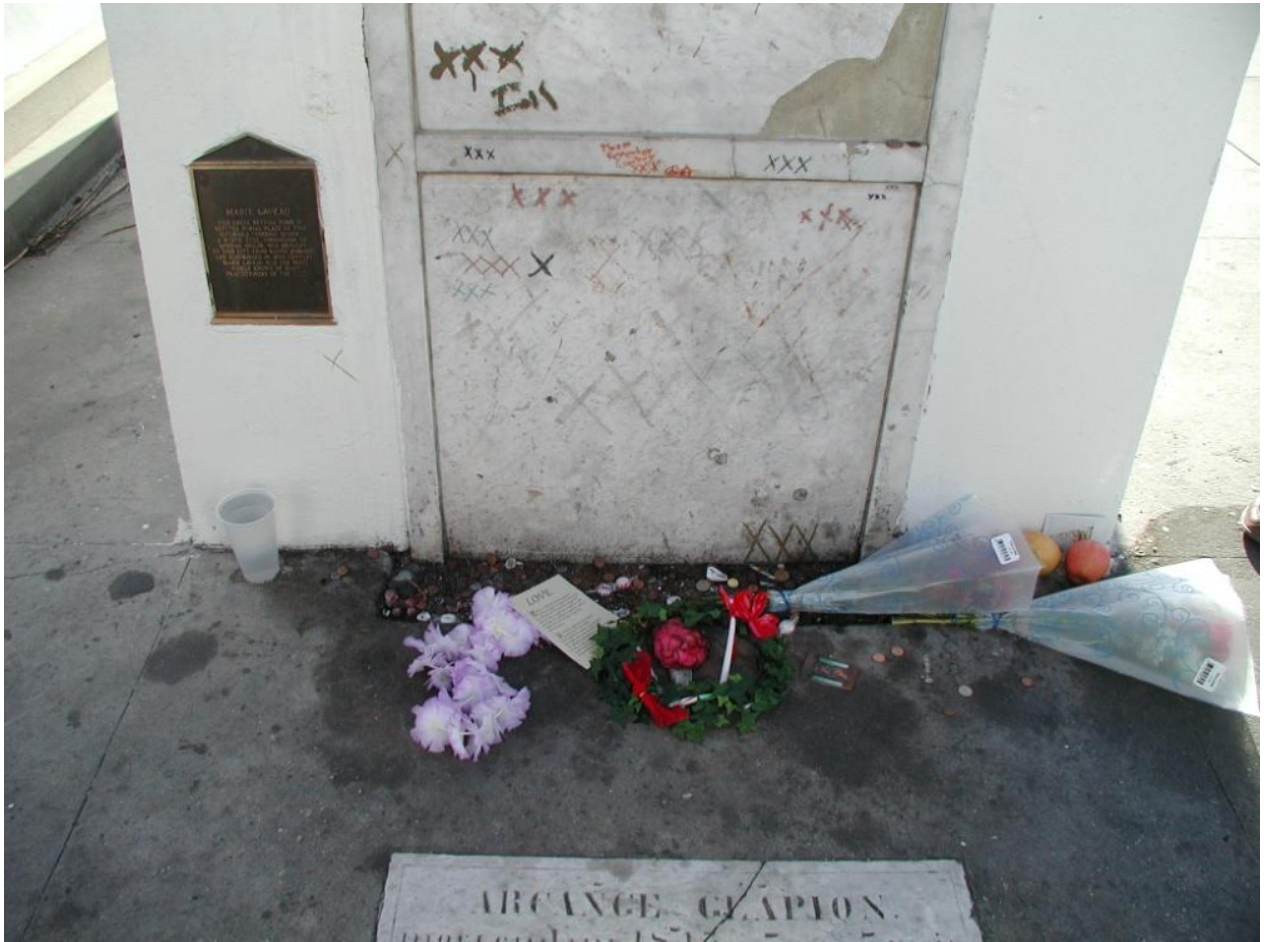
Figure 8 Grave of Marie Laveau in St. Louis No. 1. Notice the Xs and offerings. Photo taken by author August 8, 2007.

Marie Laveau's grave provides different meanings for different visitors but, for most, it is a location imbued with mystery and power. Some of the participants in guided tours that I have joined are unaware of who Marie Laveau was until the guide explained her significance in New Orleans history. Others have read about her in guidebooks and history books or have heard about her through other means. In this case, they bring preformed ideas about the site and what it means. Tourists and locals also visit the grave on their own, providing more privacy for any desired rituals or offerings. Visitors who do not identify with Vodou may find the