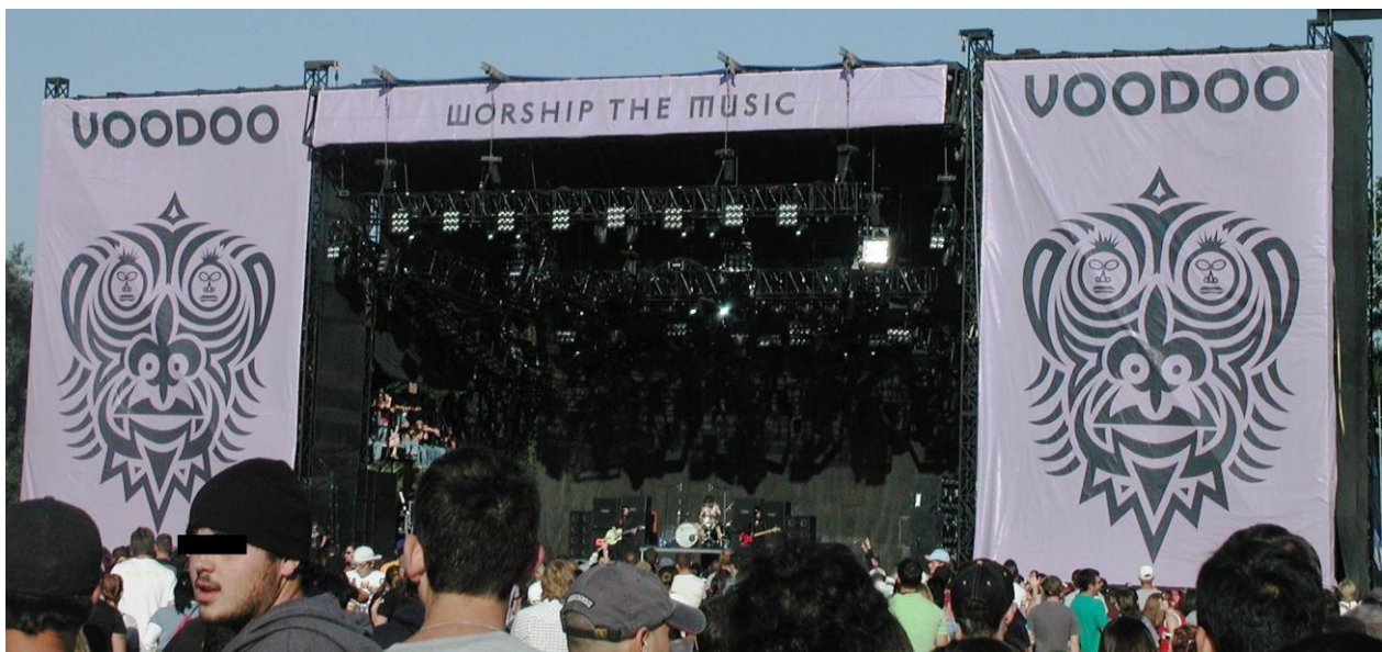
Figure 3 Voodoo Music Experience: Voodoo Stage. The band Fallout Boy is playing to a large crowd at this outdoor music festival.

the relationship ends there. For example, a popular restaurant in New Orleans (and other Louisiana cities) is Voodoo BBQ & Grill. Their menu includes items like Gris-gris Greens, the Voodoo Burger and the Graveyard Platter alongside more common names for barbecue dishes. The restaurant menu and website, however, claim only to be authentic New Orleans style barbecue and have no mention of magic or religion. Another example is The New Orleans Voodoo, the city's arena football team. The arena the team plays in has been nicknamed "The Graveyard," the cheerleaders are called the "Voodoo Dolls" and the two team mascots are named "Mojo" and "Bones." Mojo is a word meaning a magic spell or charm though the mascot is a yellow and purple furry creature that wears a team jersey. Bones is a skeleton with a tuxedo jacket, a top hat and sunglasses – an image taken from Haitian Vodou spirit Baron Samedi . This image of the Baron also shows up in the team logo, which is a skull in a top hat with sunglasses. Yet the arena football team claims no relationship to the religion.