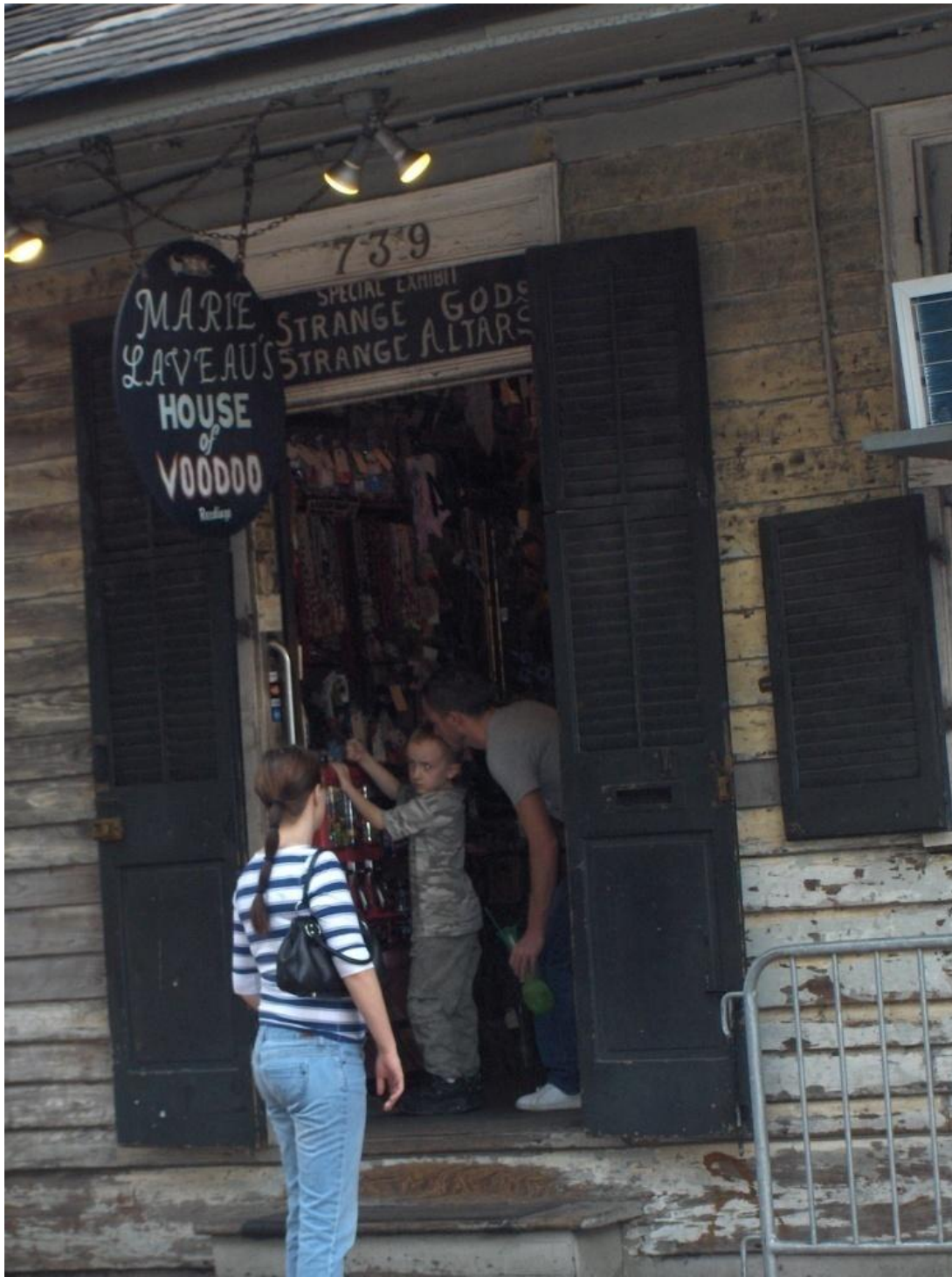
Figure 5 Tourists at Marie Laveau's House of Voodoo during Mardi Gras 2008. The sign above the entrance reads, "Special Exhibit Strange Gods Strange Altars." Photo taken by author February 4, 2008.