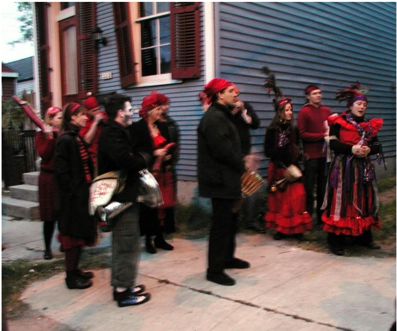
Figure 16 Ra-Ra Parade. Photo taken by Daniel Crocker on April 7, 2007. Used with permission.