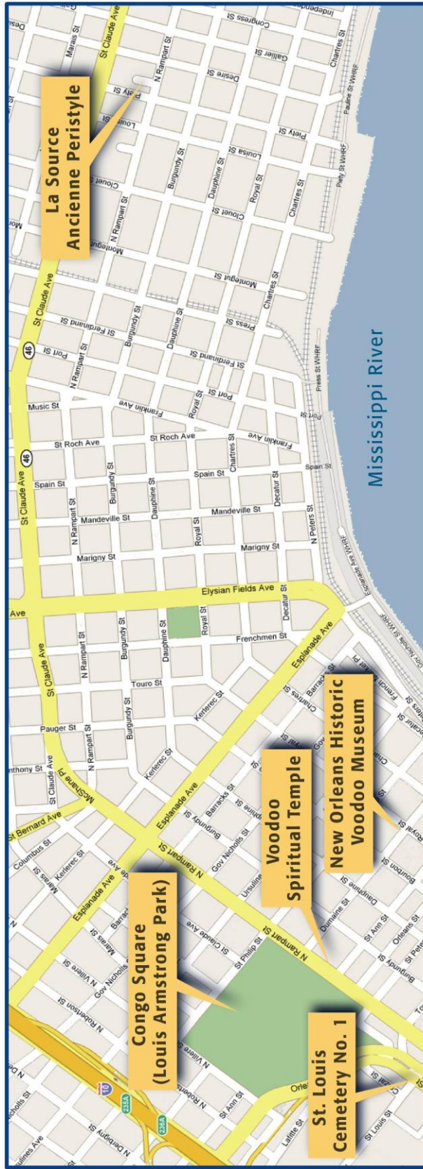
Figure 1 Locations of sites studied in New Orleans