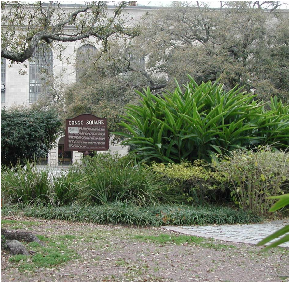
Figure 9 Congo Square today. The park is beautiful, but inaccessible. April 7, 2007.