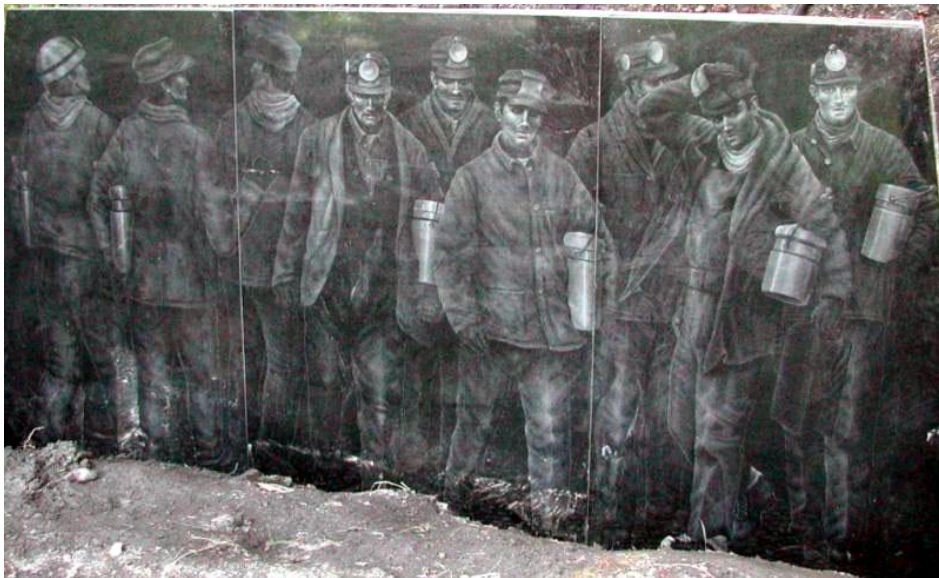
Fig. 2. The etched stone entrance to the Mine No. 6 Portal

slab of black rock that caps the abandoned entrance to Mine No. 6 (see Fig. 2). On the surface of the slab is a life-size etched image of men emerging from the mine. This image was drawn from a film still of a 1938 home movie shot by resident Julius Morey. The Mine No. 6 Portal was intended to be the site of interpretive signage as well, giving visitors a window into the hardscrabble lives of subsurface miners; as of my most recent visit to the site in July 2011, the signage was absent and the retaining wall surrounding the structure was incomplete.