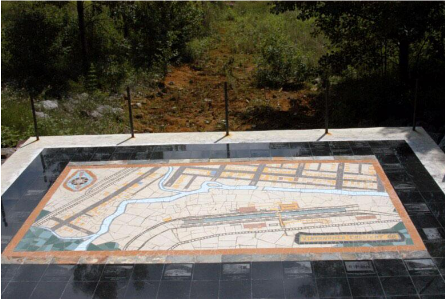
Fig. 3. The Great Map (Holly Lees)

overlooks; it is a record of the moment of Vintondale's greatest boom, contrasted with its subsequent bust.