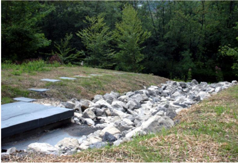
Fig. 4. The Clean Slate

The final element of the site (and arguably my favorite) is the Litmus Garden. The Litmus Garden is a large, sequential planting of native Pennsylvanian tree species that stretches the length of the Treatment System, along the southern shore of the pools. This selection of trees is planted not only to represent a sampling of the species present in the original old-growth forests that once surrounded Vintondale (until the first extraction-boom swept the valley: lumber), but also as a seasonal aesthetic gesture. As the days shorten in autumn, the deciduous trees of the Litmus Garden burst into a wide array of colors, and for a short period of time each year, mimic the color distribution of the Yamada Universal Indicator pH scale. Beginning with the red/orange of the Sugar Maple representing extreme acidity, each of the tree species was carefully selected for its autumnal color and planted overlooking the portion of the treatment system whose water, if tested, would prompt a matching color on the pH indicator scale. While seemingly a literal color matching