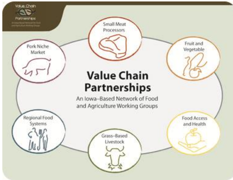
Figure 1: Value Chain Partnership Working Groups

A pictorial list of all six Value Chain Partnership working groups as developed through the collaboration of the Leopold Center for Sustainable Agriculture’s Marketing and Food Systems Initiative, Iowa State University Extension, and Practical Farmers of Iowa.