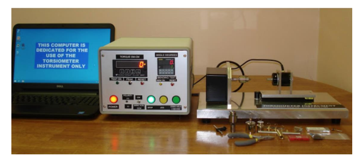
Figure 1. Torsiometer (Sabri Dental Enterprises, Inc. Downers Grove IL)

All data was statistically analyzed by ANOVA and post hoc HSD with SPSS (SPSS Inc., Chicago, IL) and statistical significance was set at P<0.05.