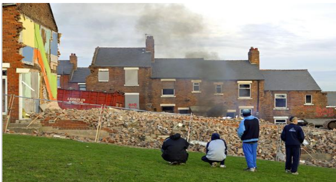
Figure 10: Demolition of Andrew and Alnwick Street ('B' Streets), Easington Colliery 2003. (Copyright 'Farwell Squalor' by Sally-Ann Norman)

measures are required to solve the problems associated with pit closures and the mass selling of colliery housing which, it was argued, was carried out with a lack of forethought for the community. this process meant that housing and the physical fabric of the community deteriorated, leading to redlining when the majority of housing developers rejected Easington Colliery as a neighbourhood to build properties in both slump and boom housing market periods. Evidently-- and supporting Smith's theory-- this resulted in the abandonment of properties, which created numerous void and vacant dwellings, some of which were subject to demolition (see figure 10, below) as part of the housing market restructuring of East Durham.