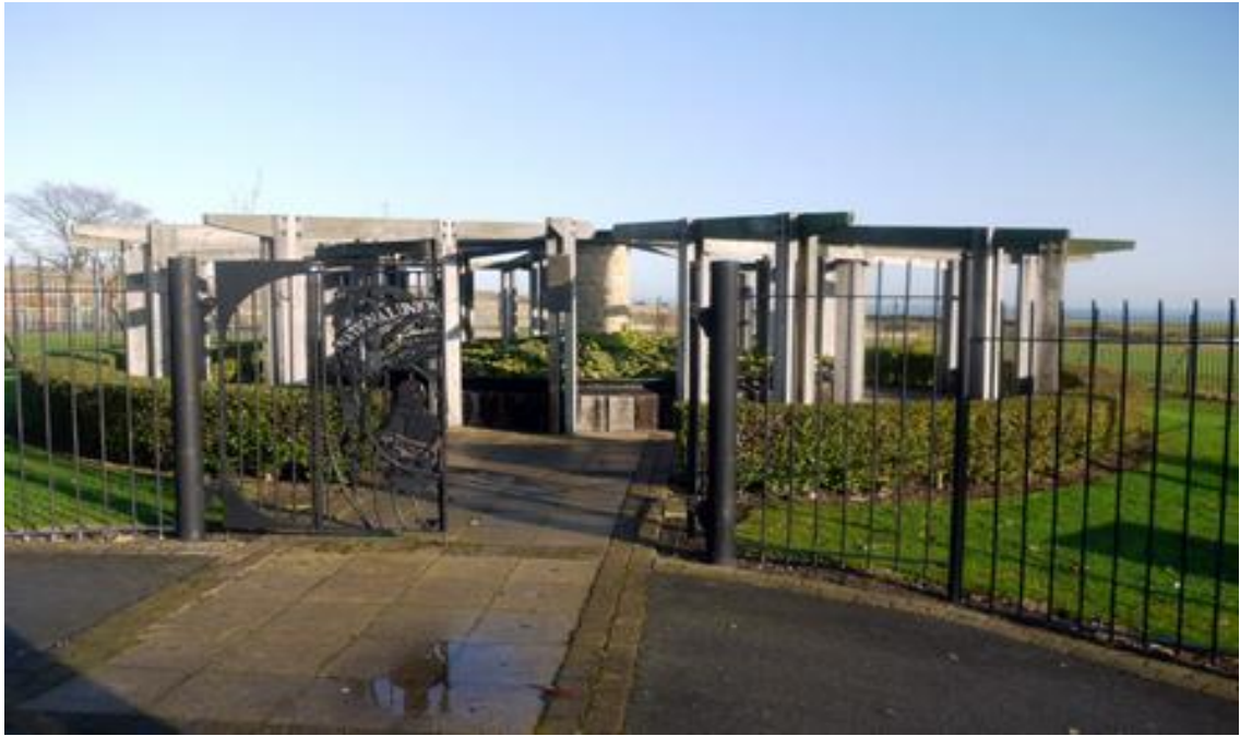
Figure 9 (above): the entrance to the former pit site, Easington Colliery, in which a small commemorative garden has been erected to the miners of the colliery

Easington Colliery today has a population of approximately 5,000. Low levels of earnings, low aspirations, low skill levels and poor health have created, according to Durham County Council (2010), a neighbourhood with high levels of multiple deprivation- with 18% of the population of working age claiming incapacity benefits, and the majority of houses falling within Council Tax band A (DCC, 2010 Private Sector Housing Strategy For County Durham 2011- 2015, draft). Easington Colliery, along with neighbouring mining areas of Wheatley Hill and Dawdon, is a focus for housing renewal work on existing housing stock in East Durham - identified as 'regeneration hotspots' by Durham County Council during the local government restructure in 2009 (Interview D). Interestingly these villages are not those which were marked out as 'Category D' settlements 7 in the 1951 Durham County Development Plan (see Chapter 2).