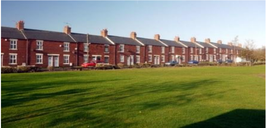
Figure 7a: A street of houses at Easington Colliery

area, ceasing production in 1993. While Easington's Colliery closed just after extraction in Seaham's Vane Tempest pit ceased production, these two areas have experienced very different subsequent development (or lack of it).