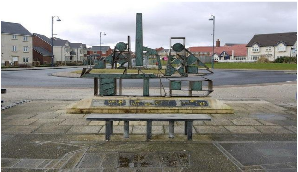
Figure 6b (above): East Shore Village, Seaham. A sculpture of Vane Tempest Colliery pays respect to the industrial heritage of the area

This programme of funding and place based investment has borne fruit, and Seaham is now one of the most successful centres within East Durham and the