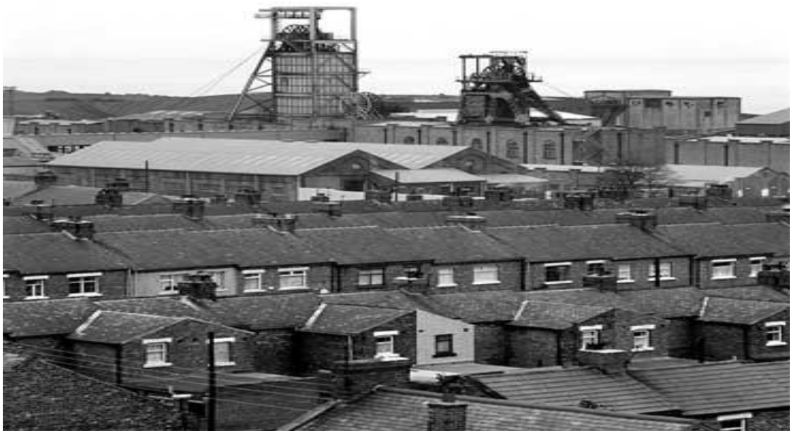
Figure 7b (above): Closely built, grid pattern of housing built to serve the pit at Easington Colliery, taken in 1992.