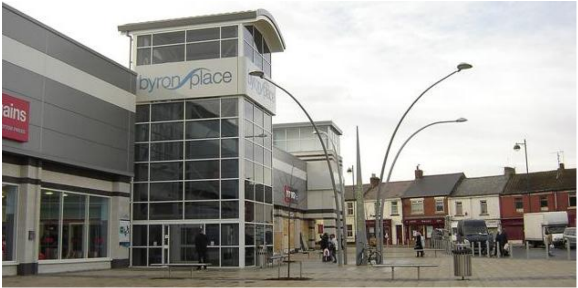
Figure 3 (above): Seaham Byron Place Shopping Centre