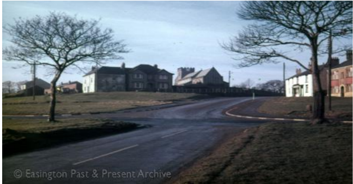
Figure 8 (above): Open, traditional village lay-out of Easington Village

Easington Colliery lies south of Seaham's Heritage Coastline, however little is made of this fact. The former pit site has been reclaimed but rather than providing a site for development or enterprise it is simply greened over with a small park (figure 9, below) to commemorate those who lost their lives in mining disasters over the years. Little new development has taken place in Easington Colliery, and the neighbourhood is more familiar with low demand and housing demolition than new build (see, for example, Beynon, at al., 1999; Easington District Council, 2002; Easington District Council, 2007). In addition no employment came in to replace the lost mining industry and the vast majority of the businesses on Seaside Lane (the main street and once thriving shopping centre for the colliery) closed. This resulted in the community becoming less centred on the Colliery village itself to provide employment, retail and social facilities. The neighbourhood was fractured further when coal board houses (the colliery tied terraced properties which make up the colliery settlement) were sold off in bundles. These properties were often bought by people outside the area and have led to wider problems associated with absentee landlords (discussed later in the thesis). As a result Easington Colliery struggles to shake the stigma associated with industrial decline and post-mining malaise.