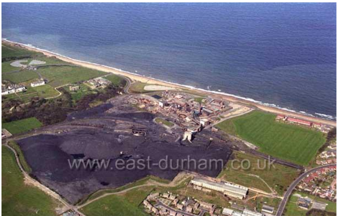
Figure 5 (above): Vane Tempest Colliery, Seaham. This land was reclaimed and redeveloped after the colliery ceased production, and now is home to East Shore Village

gave the dwelling its name. A tiny fishing hamlet at the beginning of the 19 th century, Seaham Harbour was established by Charles Stewart (later the third marquis of Londonderry) who, after marrying Frances Anne Vane-Tempest in 1819, used his wife's wealth to buy the extensive Seaham estate (Pocock and Norris, 1990). The growth of the town resulted from the port which provided an outlet to distribute the locally mined coal to the rest of the country. Seaham Colliery-- referred to locally as 'The Nack'-- opened in 1849. At its height, in 1914, Seaham Colliery employed 3,094, dropping to its lowest rate of 493 in 1980 before combining with Vane Tempest pit in 1988 (Durham Mining Museum). Vane Tempest colliery (figure 5, below) opened in 1926, employing 1,819 at its height in 1950, and closing in 1993 (Durham Mining Museum).