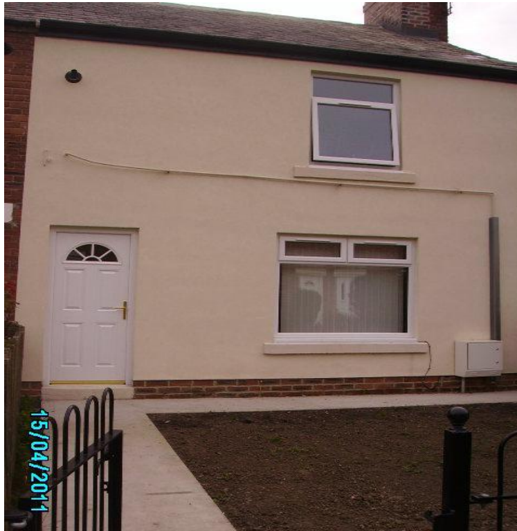
Figure 11b: An example of Group Repair work in Wembley, Easington Colliery: Noble Street after Group Repair

Overall the research uncovered support for Group Repair across a range of respondents. There was a general consensus that the programme was effective, providing some “absolutely fantastic examples across the county” (BB) in pre 1919 stock. As such it was regarded as a valuable policy which not only improved the aesthetics of the physical environment but also influenced the perceptions of the area making the houses and wider neighbourhood more attractive to potential and current residents. This is a subjective notion however as a lack of data on the specifics related to the scheme, i.e. empty homes, meant that it was impossible to categorically state that group repair had improved “let-ability” in the targeted areas- a point highlighted by a local authority housing specialist (Interview FF). The focus of the scheme on the physicality of the neighbourhood promoted most discontent. A local councillor who suggest that face lift programmes are “all well and good” but believe a more strategic approach is needed to “tidy up the colliery” which should focus on “bring[ing] in better housing” (Interview P). One such interviewee suggested that Group Repair focuses too much on the aesthetics of the