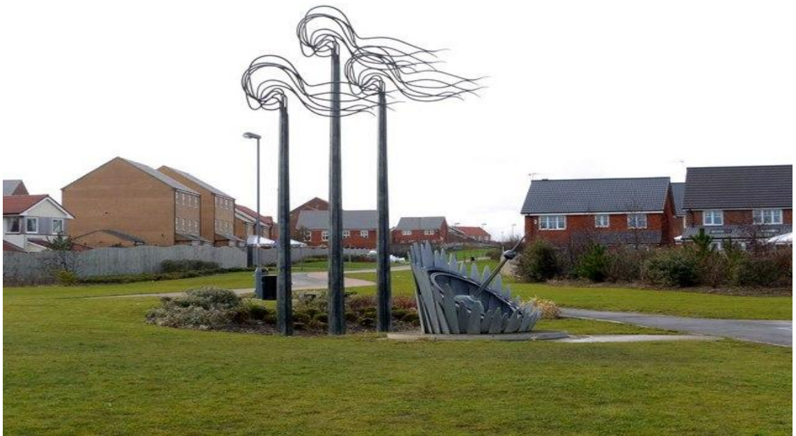
Figure 6a (above): East Shore Village, Seaham. Once the site of Vane Tempest Colliery, today a large scale housing development