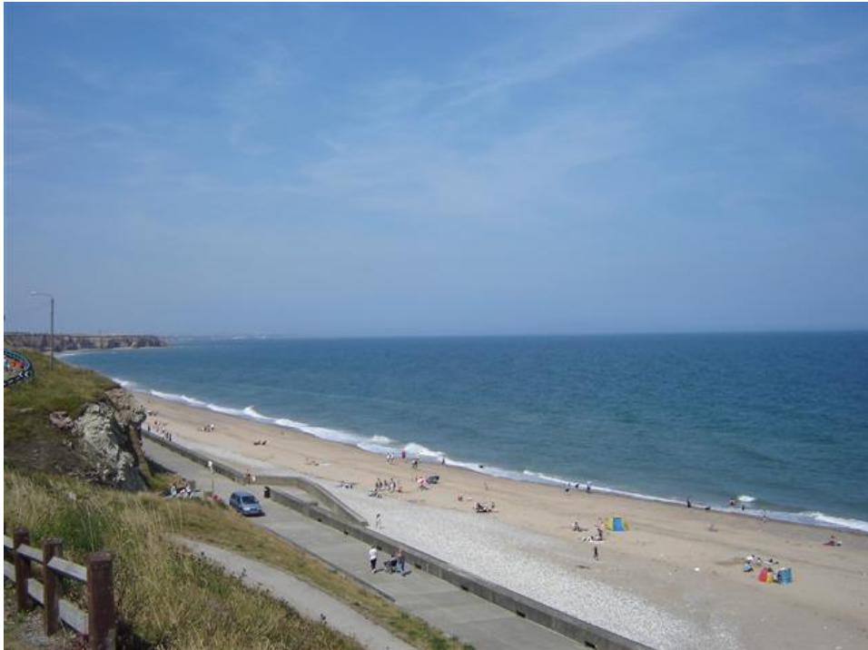
Figure 2: Seaham's Heritage Coastline

bestowed on the town by the former District Council and now the Unitary local authority, has helped and guided Seaham through the issues associated with industrial decline. Seaham, situated on an attractive coastline which was regenerated through local, national and European funding, was designated a "heritage coast" in 2001 (see figure 2 below).