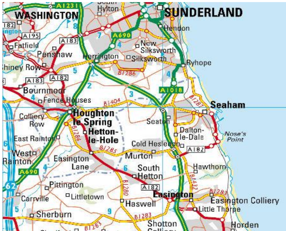
Figure 1b: Road Map of East Durham

Consisting of a series of colliery villages and towns separated by fields, East Durham experienced post-industrial problems in a rural setting--rather appropriately described by a third sector interviewee as experiencing ‘urban deprivation with hedgerows’ (Interview HH). It is this ‘special characteristic’ of settlement patterns observed in coalfield villages (Coates and Barratt Brown, 1997) which Williamson (1982: 6) contends must be regarded as ‘constructed communities’ which