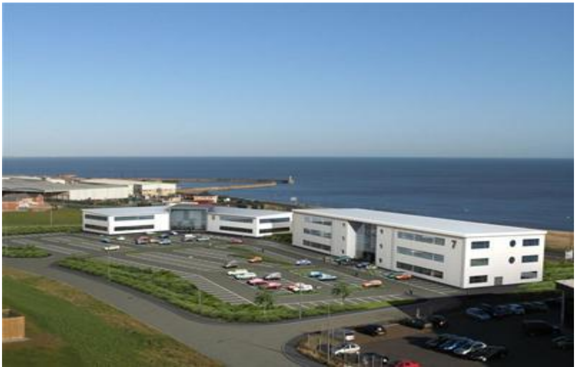
Figure 4 (above): Seaham Spectrum Business Park; Enterprise Zone in East Durham

Situated 6 miles south of the City of Sunderland and 13 miles east of Durham City, the town of Seaham owes much of its history to the port (Seaham Harbour) which