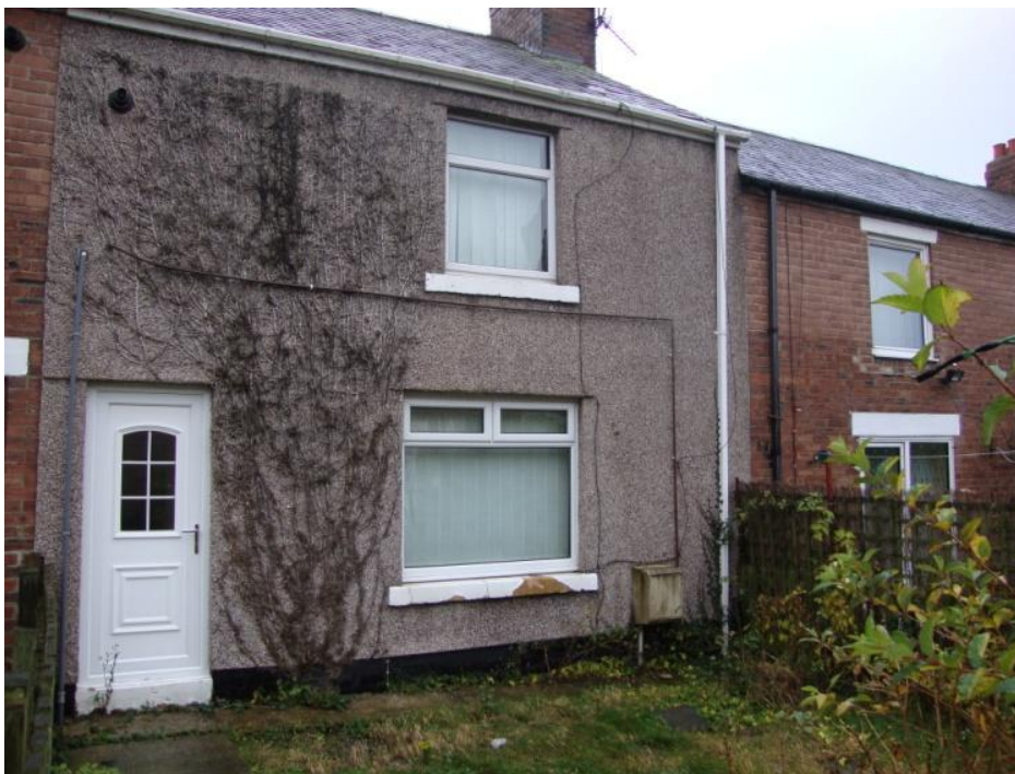
Figure 11a (above): An example of Group Repair work in Wembley, Easington Colliery: Noble Street before Group Repair

In-line with other Neo-liberal agendas of partnership working, this scheme has been accompanied by the creation of steering groups, used to bring communities and stakeholders together to work through issues of concern in those areas. This is discussed in greater depth in Chapter 7, however it is necessary to note that the use of steering groups has opened up the agenda, making the communities feel more included in a process which is ultimately affected them. In turn this also facilitated a greater degree of success for the Group Repair agenda, from the communities at least.