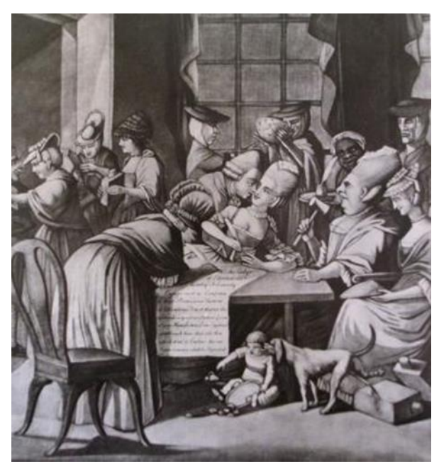
"Political Cartoon of Edenton Tea Party." Image courtesy of Learn NC .

They were portrayed as unfit mothers as shown with the child playing unattended underneath the table. One of the women signing the petition is entertaining a male suitor that is presumably not her husband, thus portraying the women as promiscuous. The women in the back