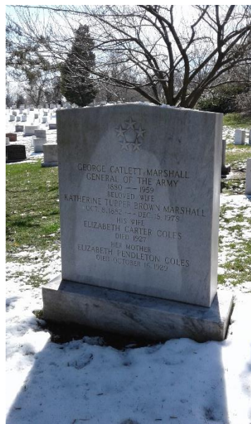
Marshall's Grave Marker at Arlington National Cemetery 3/22/2018

memory remained strong through 1957, when his health began to decline even further. When President Eisenhower and former Prime Minister Winston Churchill visited Marshall at Walter Reed Hospital in 1958, Marshall could not recall who they were. Churchill bade his farewell to Marshall with tears in his eyes. 15 On October 16, 1959, the general passed away. In keeping with his wishes, Marshall's funeral and burial at Arlington National cemetery were quiet affairs, but were attended by former President Truman, Eisenhower, and many former associates and comrades from his life of government service. On October 20, 1959, George C. Marshall was laid to rest not far from the Tomb of the Unknown Soldier. As his biographer stated, "George Marshall had completed his tour of duty." 16