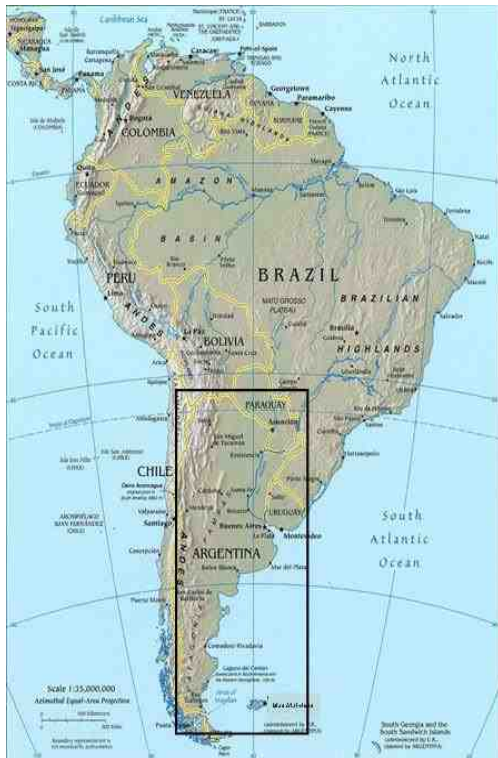
Figure 4.3. Argentina in South America