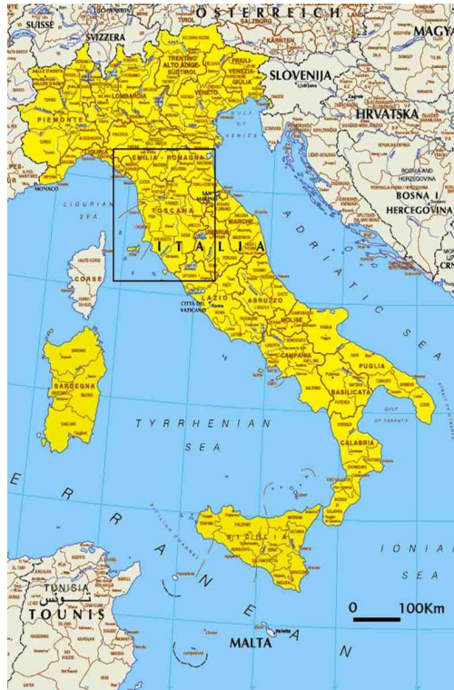
Figure 4.1: Tuscany region in Italy