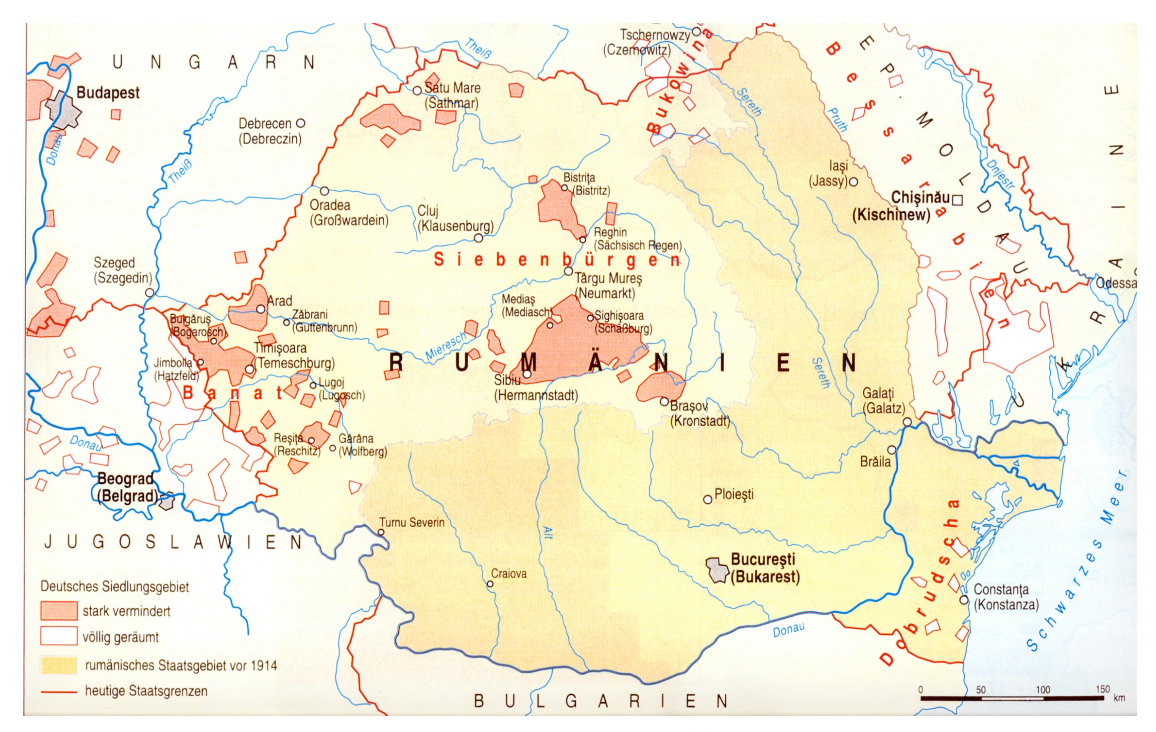
Map of German Settlements in Romania<sup>192</sup>