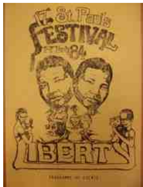
Figure 4: 1984.