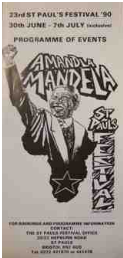
Figure 5: 1990.