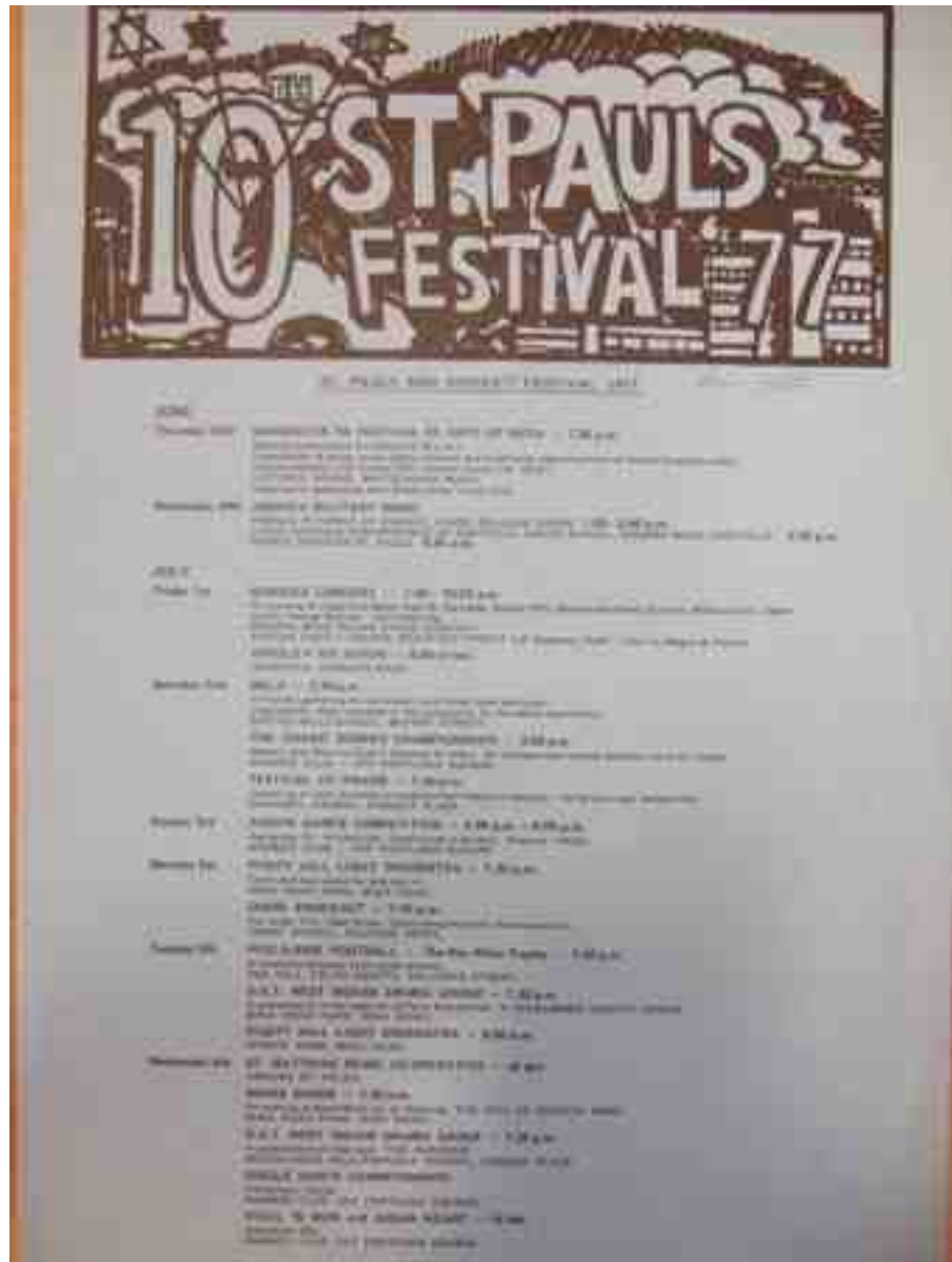
Figure 2: 1977.