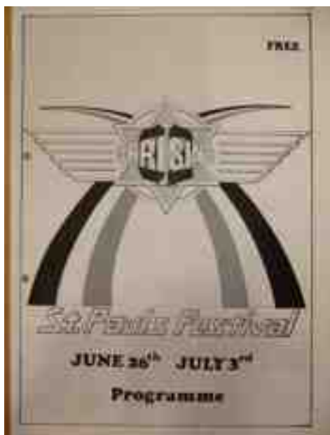
Figure 3: 1982.