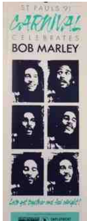
Figure 6: 1991.