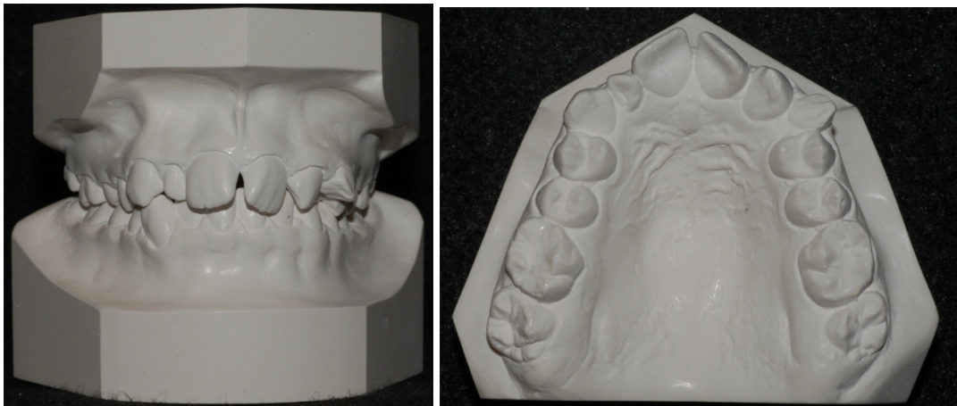
Figure 1: Casts of a patient exhibiting unilateral agenesis of left maxillary lateral incisor, retained left primary canine, left permanent canine in the position of lateral incisor and a peg-shaped right lateral incisor.

casts, a small discrepancy was found (0.4mm). 40 This discrepancy could have potentially been significant for the measurement purposes of this study especially if some of the dental casts were digital and others plaster. For this reason, only plaster casts were accepted. Some of the dental casts were soaped, however the difference in size of teeth on soaped versus unsoaped casts is nominal (0.08mm). 41