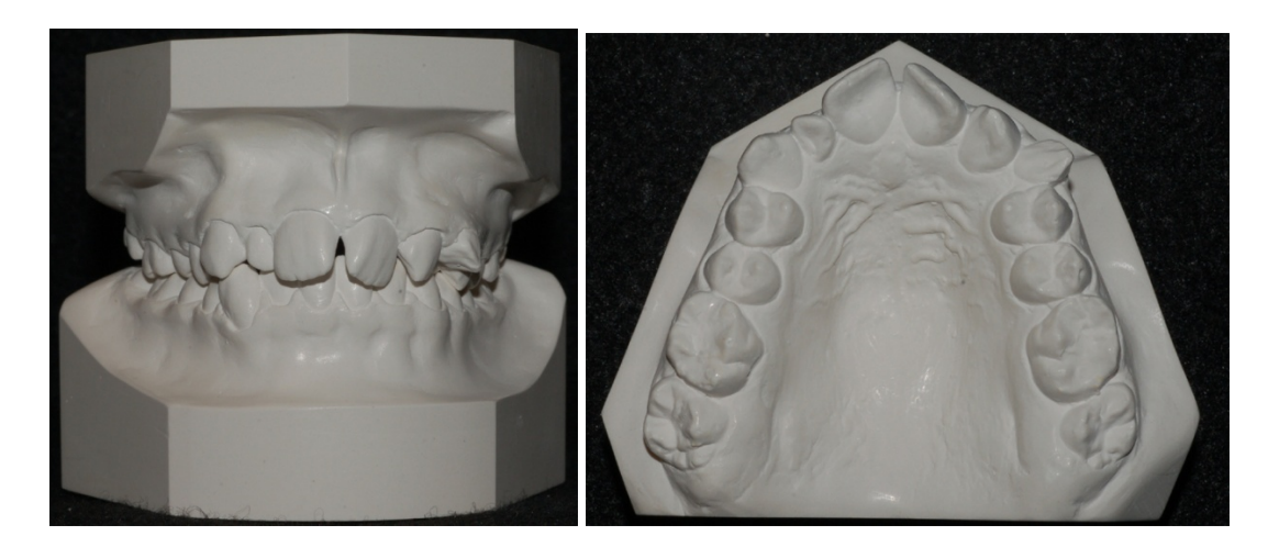
Figure 1 : Casts of a patient exhibiting unilateral agenesis of left maxillary lateral incisor, retained left primary canine, left permanent canine in the position of lateral incisor and a peg-shaped right lateral incisor.

casts, a small discrepancy was found (0.4mm).<sup>40</sup> This discrepancy could have potentially been significant for the measurement purposes of this study especially if some of the dental casts were digital and others plaster. For this reason, only plaster casts were accepted. Some of the dental casts were soaped, however the difference in size of teeth on soaped versus unsoaped casts is nominal (0.08mm).<sup>41</sup>