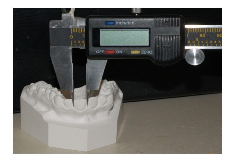
Figure 3: Digital caliper measuring mesio-distal widths of maxillary teeth. The teeth were measured at their widest point.

A control group of 40 sets of dental casts was collected from Marquette University's Orthodontic department after the test group was established. The PI searched for males and females on the orthodontic department's computerized charting system (AxiUm) that met the age, race, and gender of the test population. The mean age for the control group was 15.925 years (SD=6.74). (Table 1)