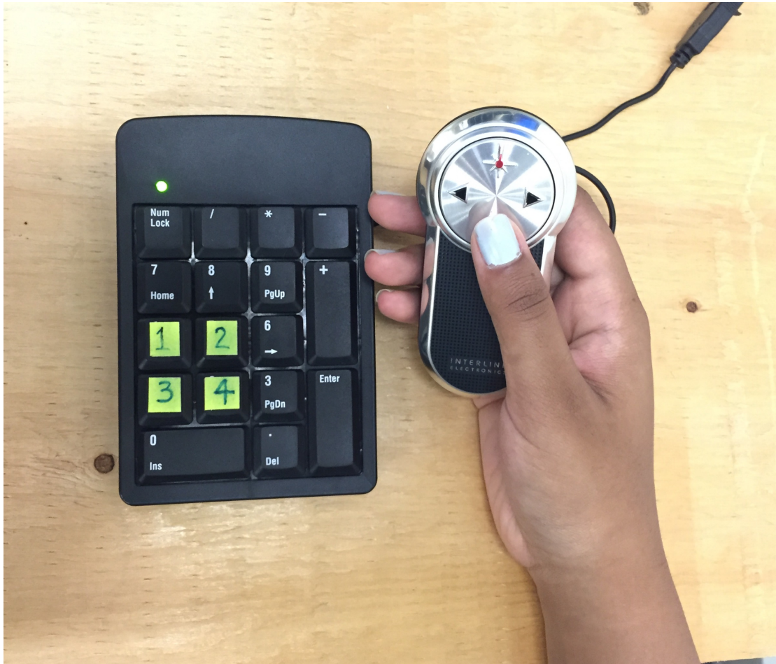
Figure 2. Mouse used for calibration and numeric keypad from which participants selected their response.

hierarchical regressions used the BIS-11 subscales (attention, motor, and nonplanning) to predict PPVT-IV performance (i.e., standard score and percentage of correct responses). Potentially influential demographic information was controlled for in the first step of the regression.