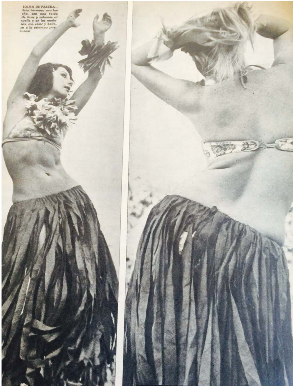
Figure 3: “Traditional Dances from Easter Island” in “Chile Salutes the World,” Third session of the United Nations Conference on Trade and Development