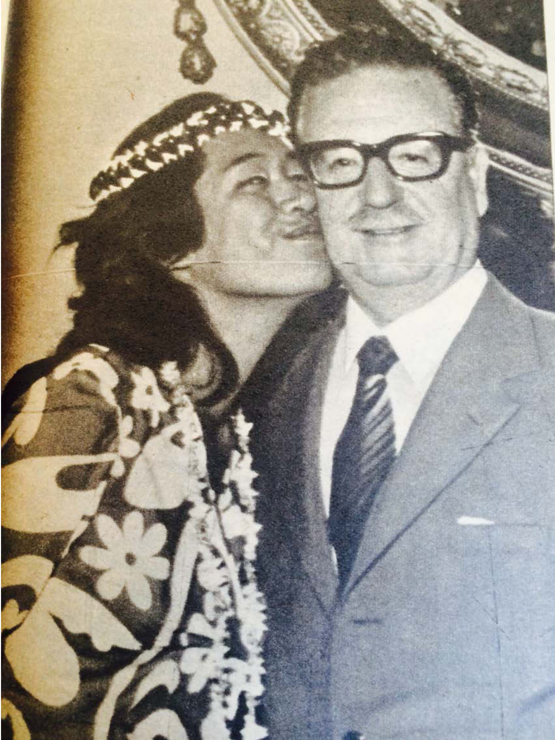
Figure 5: Easter Island indigenous dance group Tararaima performing in the National Palace for President Allende and his wife