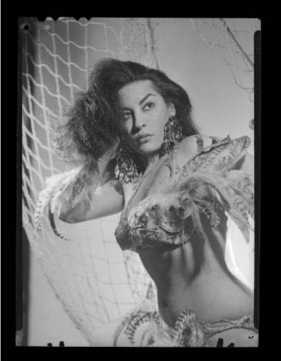
Figure 10: Cleopatra, photographs by Alfredo Molina Lahitte, published in 1950s, Biblioteca Nacional Digital de Chile.