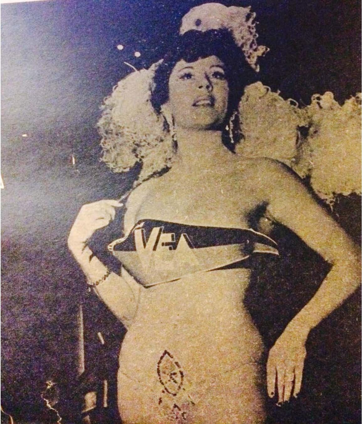
Figure 8: French vedette Ivonne Menard