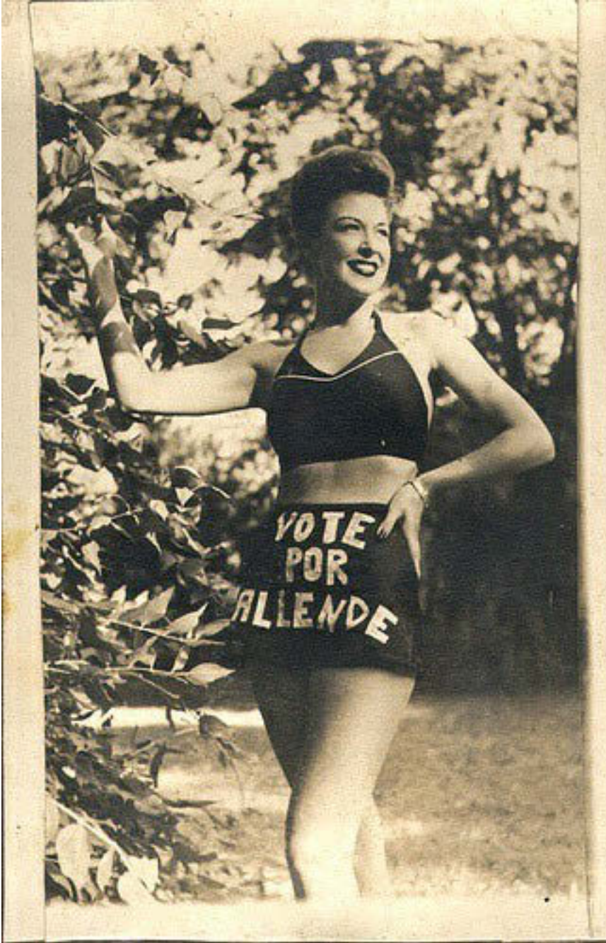
Figure 2: Actress Malu Gatica, Chile, 1945