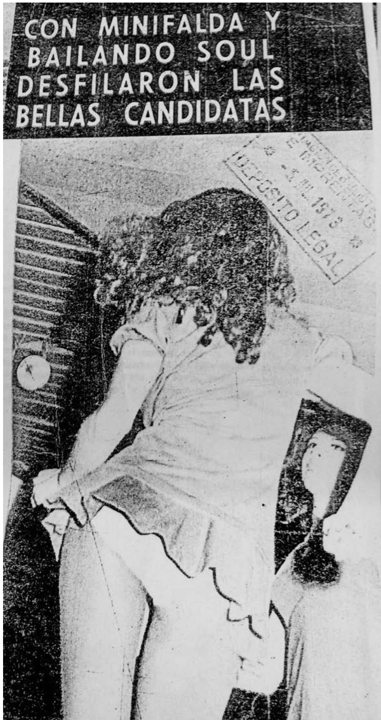
Figure 1: "Eligen Miss Chile a lo Musica Libre," photographs by Julio Bustamante, Novedades , N. 139, July 1973.