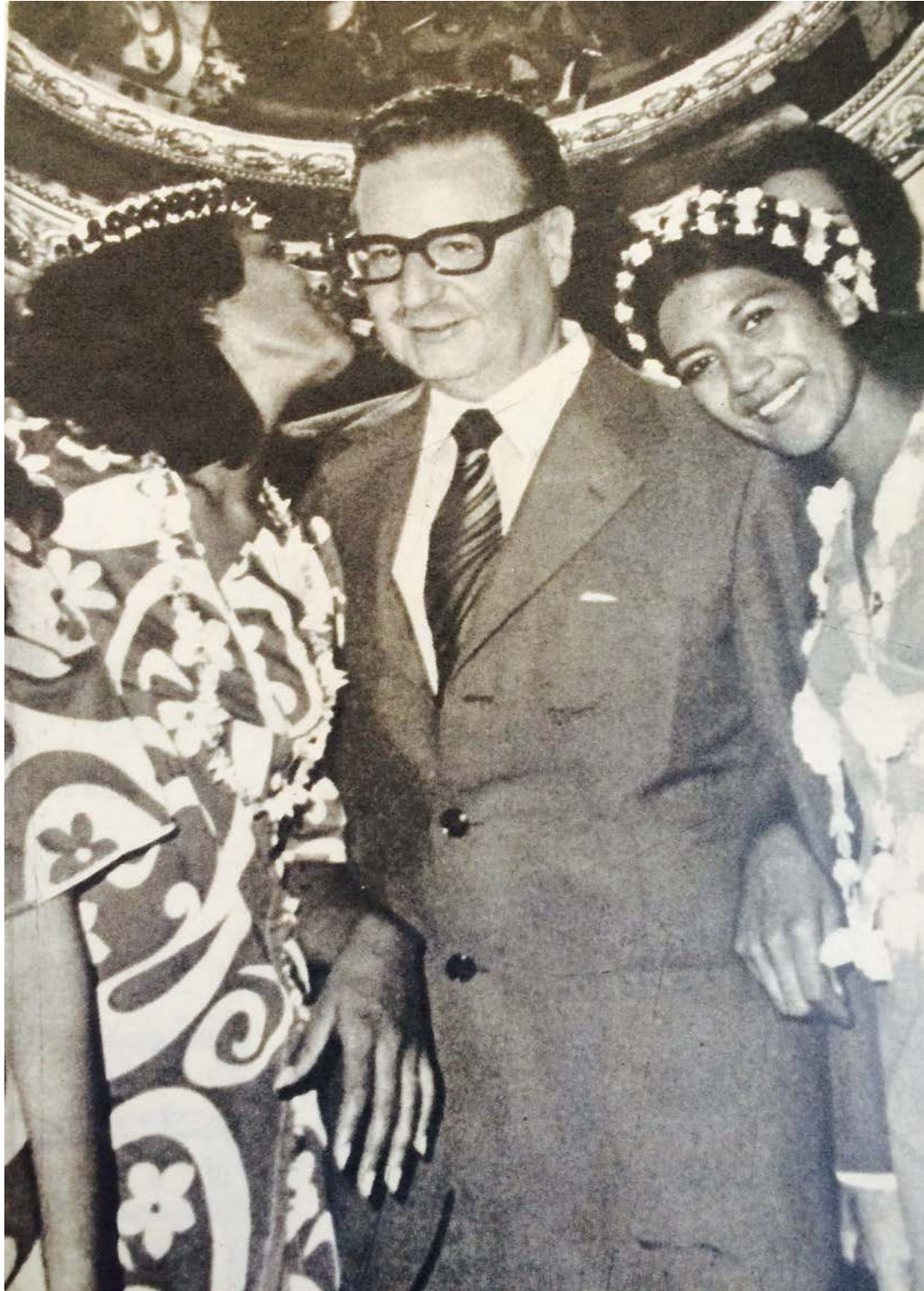
Figure 4: Easter Island indigenous dance group Tararaima performing in the National Palace for President Allende and his wife