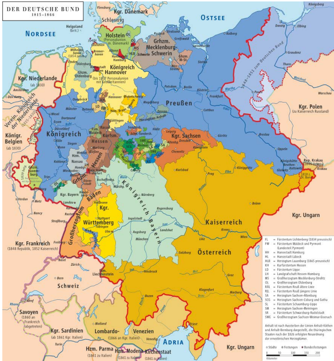
Map of the German Confederation, 1815-1866 703