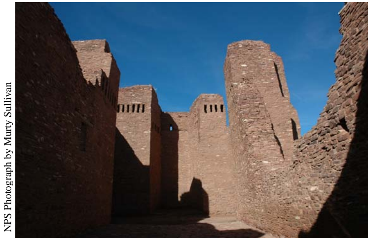
Figure 3: Nuestra Señora de la Purísima Concepción de Quarai

By November 4, 1846 he reached Quarai, and was impressed with the construction of the Spanish mission, leaving us the first American description of Nuestra Señora de la