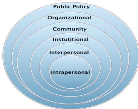
Figure 1. Social ecological model for health promotion.

behavior or health changes, without taking into account the interplay of effects of the other levels. The socio-ecological model places each level within the other, indicating that no context is separate (see Figure 1).