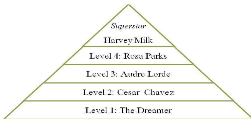
Figure 3. Coming Out Pyramid (Dream Activist et al., 2010)

The Coming Out guide also provided a pyramid illustration of the various other activists that could counter any notion of inferiority, as captured in Figure 3.