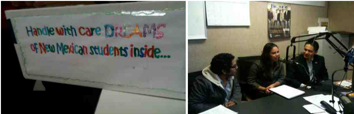
Albuquerque DREAMers in Action campaigns