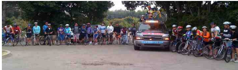
Tour de Dreams II resulted in a 540 mile bike ride that began at UC Berkeley and ended at UCLA with participating students from various California colleges and universities. (Photos by author, August 21, 2011)