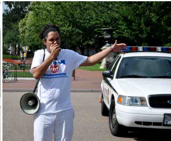
Dream University participants use dance and skits to narrate the DREAMer experience.