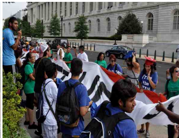
Washington DC march outside Senate offices. 21 undocumented immigrant youth were arrested while conducting non-violent sit-ins at congressional offices on Capitol Hill. (July 20, 2010)