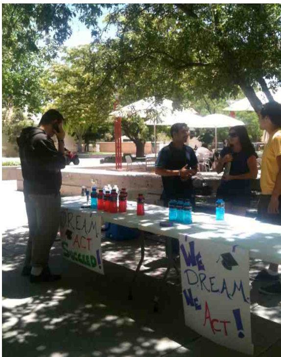
Demonstration at Senator Udall's office and campus tabling to support DREAM Act by University of New Mexico students. (June 15, 2010)