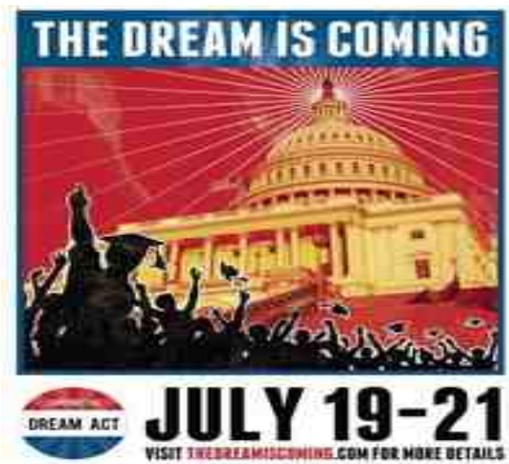
Poster for DREAM Mass Mobilization in Washington DC.