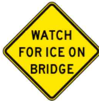
Figure 1. W16-6 Watch for Ice on Bridge Sign (U.S. Department of Transportation Federal Highway Administration, 2009)

After reading the sign, I understood the source of Dolores' emotional state. The concern for her wellbeing had nothing to do with the weather conditions; rather her fear came from an instinctual interpretation and apprehension of the word ICE. Dolores' immigration status as an undocumented student required that she be on guard for U.S. Immigration and Customs Enforcement (otherwise known as ICE), knowing that the presence of border patrol agents could lead to her arrest and imminent deportation.