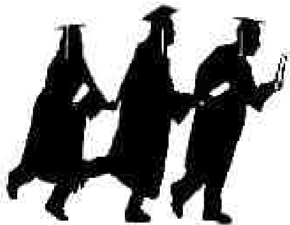
Figure 2. Graduation Silhouette (CHIRLA, 2010)

Displaying these student symbols of graduation became expressions of identity and assertion of an affiliation with the corresponding values of the dominant culture (Whalen & Hauser, 1995). The DREAM Act advocates used caps, gowns, and invitations to graduations to demonstrate to legislators that undocumented students were indeed deserving of legal citizenship. They used something already viewed favorably by the legislators—education—as their identifying link, and the slogan of this phase became “education NOT deportation.” Figure 2 illustrates the use of this symbolism.