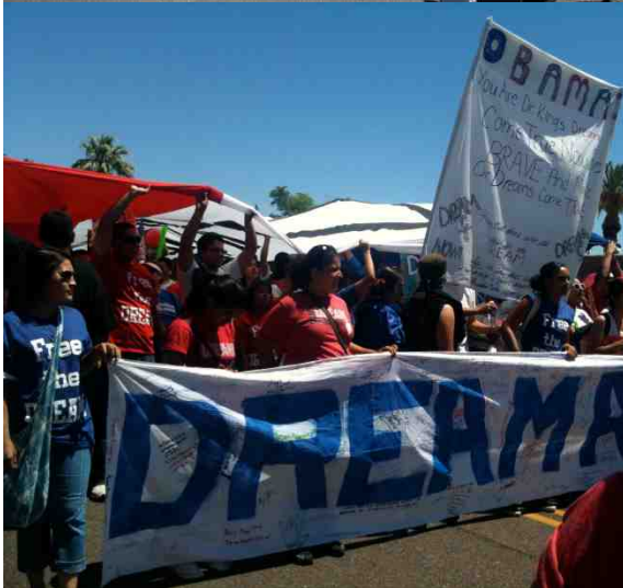
National Day of Action Against S.B. 1070 included a march of over 50,000 participants held in Arizona, where Arizona DREAM Act Coalition (ADAC) contributed to a large DREAMer contingency of participants. (Photos by author, May 29, 2010)