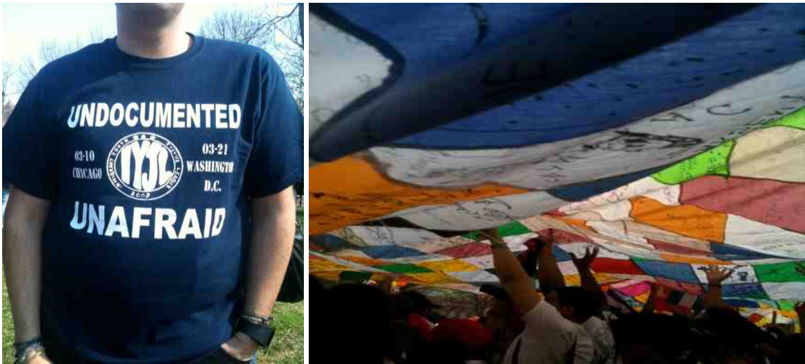
March FOR America: Change Takes Courage, a mobilization in Washington DC, yielded over 200,000 people marching, rallying at National Mall in ask for comprehensive immigration reform. (March 21, 2010)