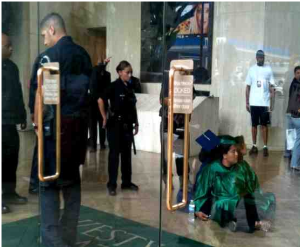
Los Angeles IDEAS members are arrested for participating in sit-ins at the Senate offices of Senator Dianne Feinstein of California. (Photo by author, May 27, 2010)