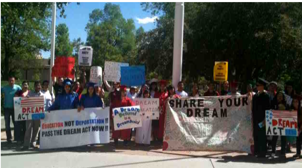
University of New Mexico hosts the first ever DREAM Conference on campus through collaborative effort of various campus and community groups.