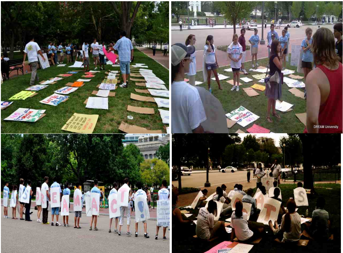
Dream University, a project of United We DREAM, opened and used teach-in as tactic for gaining media attention for the DREAM Act while also building up to the national DREAM mass mobilization. (July 19, 2010)