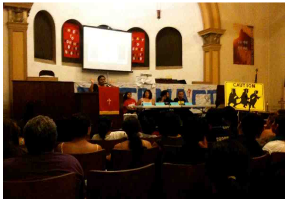
DREAM Act Town Hall meeting held at Echo Park United Methodist Church to create dialogue among community members. (Photo by author, August 19, 2010)