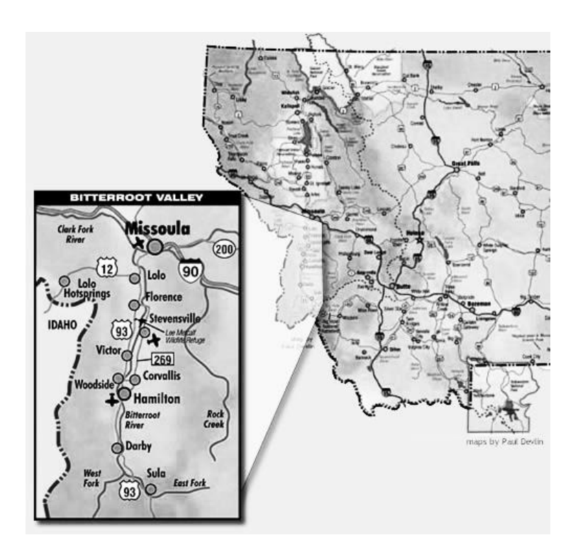
Figure 1.1: Bitterroot Valley

Montana's Bitterroot Valley runs about 100 miles from north to south into the Anaconda region of western Montana. The city on the north end of the valley has a population of nearly 70,000 people, is considered the liberal epicenter for the region, and is the second largest city in the state. The next largest city in the Valley is located fifty miles south of Missoula, with a population of approximately 12,000 people. According the 2000 US Census, population growth in the Bitterroot counties alone has increased 25% in the last