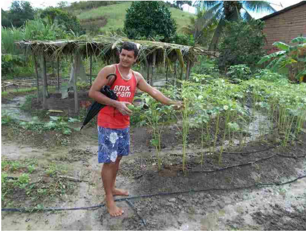
Figure 6.14: KIT-PAIS garden

circular shape of the garden, concentrating the geometry of the rows, facilitates irrigation. Crops that are planted include lettuce, okra, cilantro, and various other garden vegetables for household use.