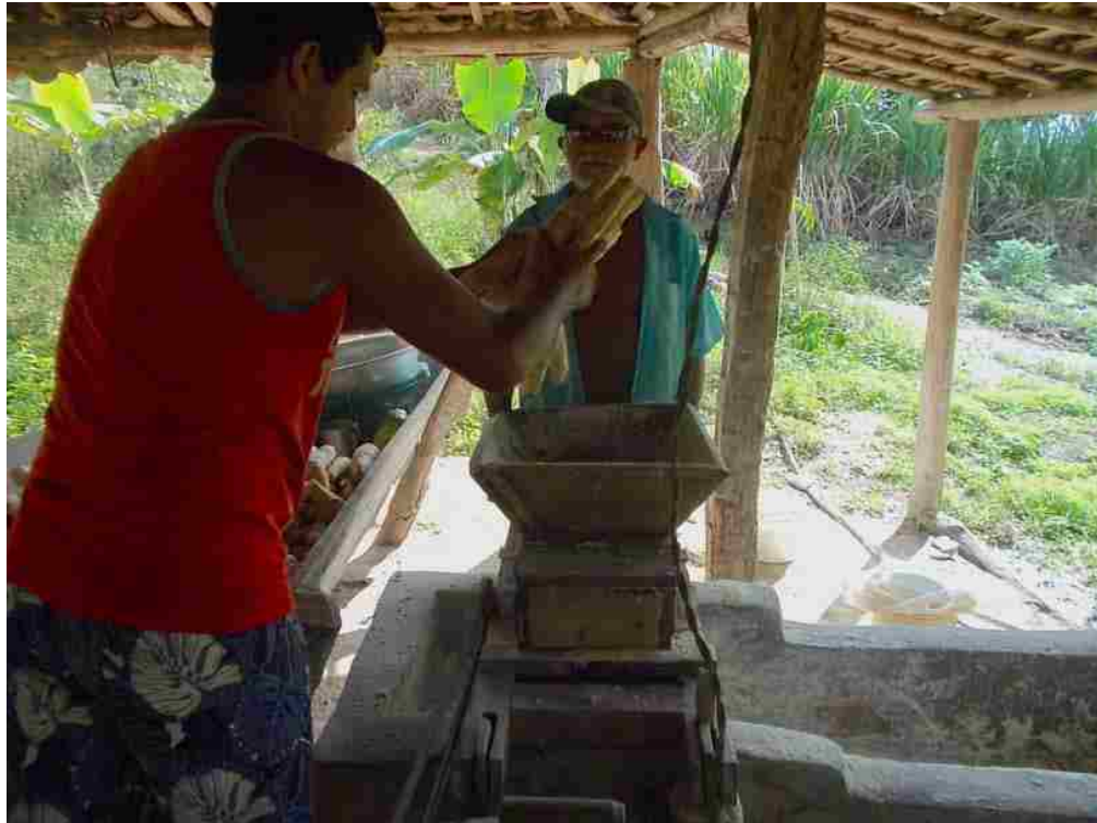
Figure 6.5: Grinding