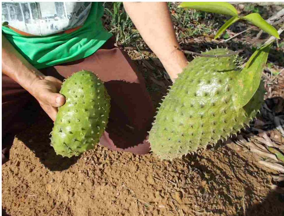
Figure 6.2: Soursop on the Frei Gondim settlement

distinction, between what they call macaxeira and mandioca . Another way of distinguishing the two species is that macaxeira is sweet manioc, while mandioca is bitter manioc, which must be processed before it can be eaten because it contains a cyanide compound in its unprocessed state.