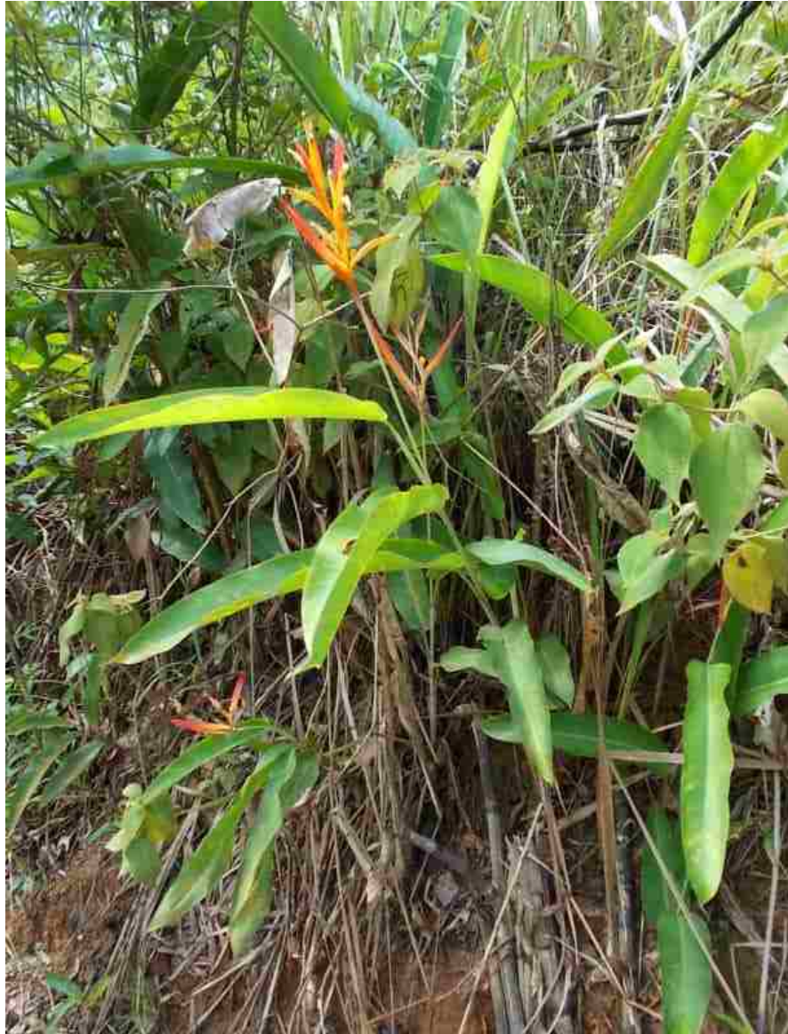
Figure 6.23: Heliconia psittacorum L.f.

pressing, pointed out that it is used to kill cattle skin parasites. The discovery of Heliconia psittacorum L.F. has a similar story.