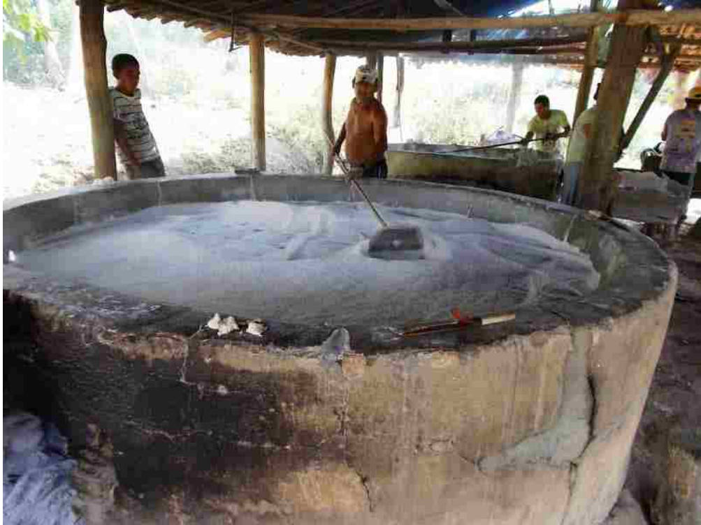
Figure 6.7: Roasting the flour