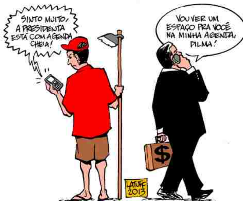
Figure 7.1: MST frustration with slow pace of reform

Source: Editorial cartoon by Carlos Latuff, Brasil de Fato web site, 2 February 2013. http://www.brasildefato.com.br/ .