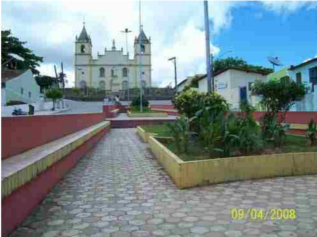
Figure 4.4: Plaza in the town of Gameleira, with church in background