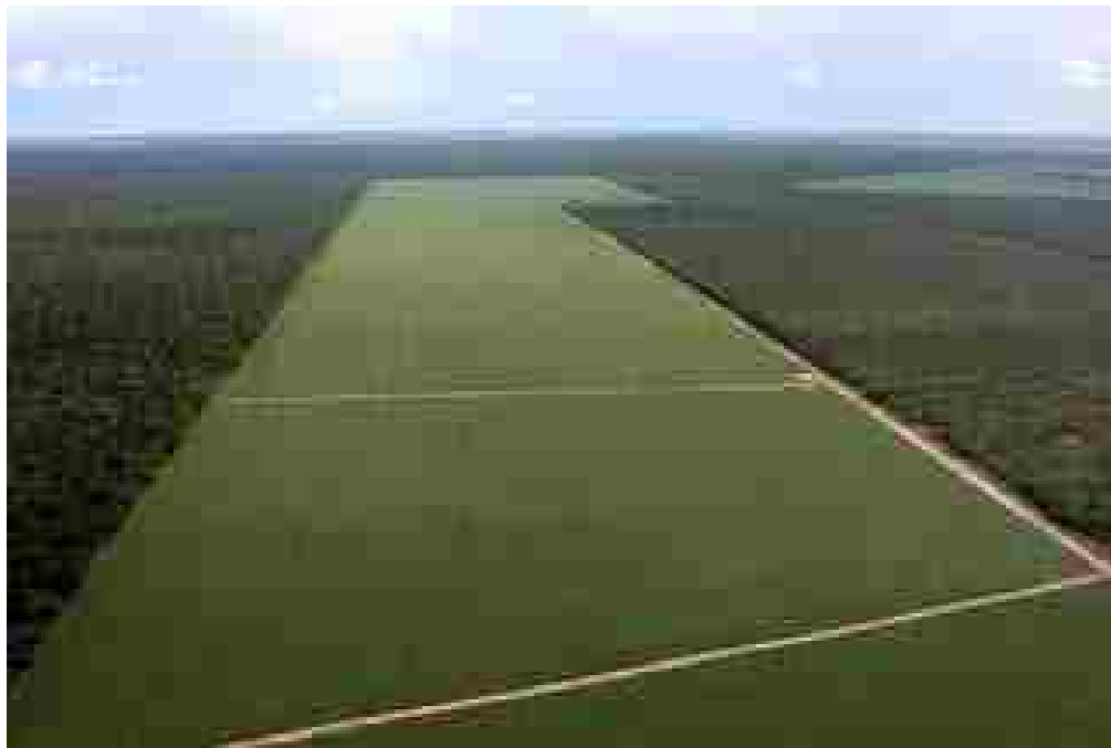
Figure 2.1: A Brazilian latifúndio