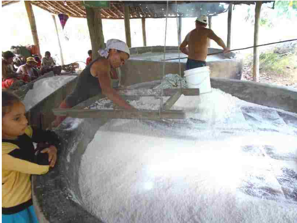
Figure 6.8: Women sift the flour