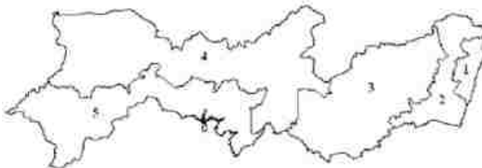
Figura 1. Mapa do estado de Pernambuco com as cinco mesorregiões: Região Metropolitana (1), Zona da Mata (2), Agreste (3), Sertão (4) e Sertão do São Francisco (5)