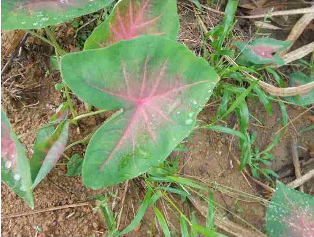
Figure 6.22: Caladium bicolor Vent.

I discovered some of the collected plants on solo outings. Caladium bicolor (see Table 6.5) was a striking plant I spotted on a hill overlooking the center of the settlement.