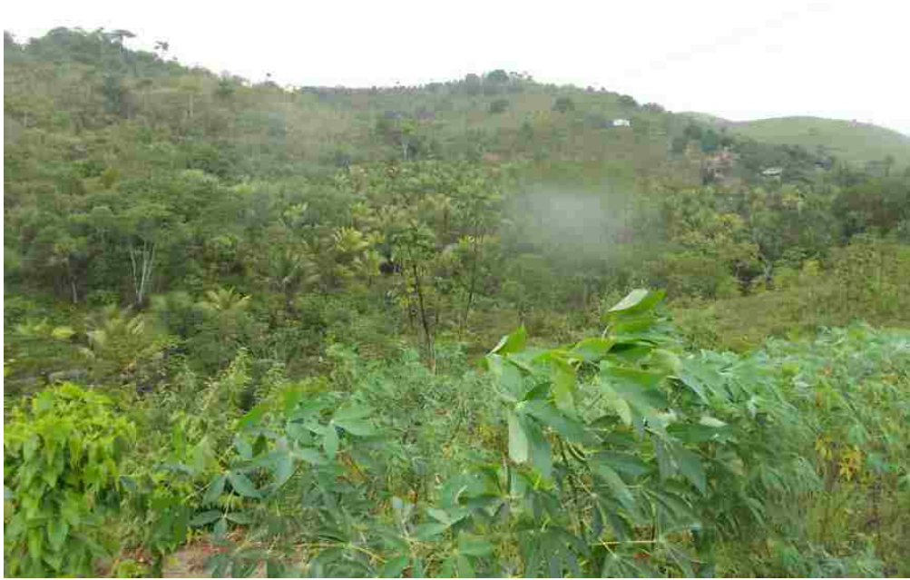
Figure 4.5: The view from a settler plot on the Frei Gondim Settlement