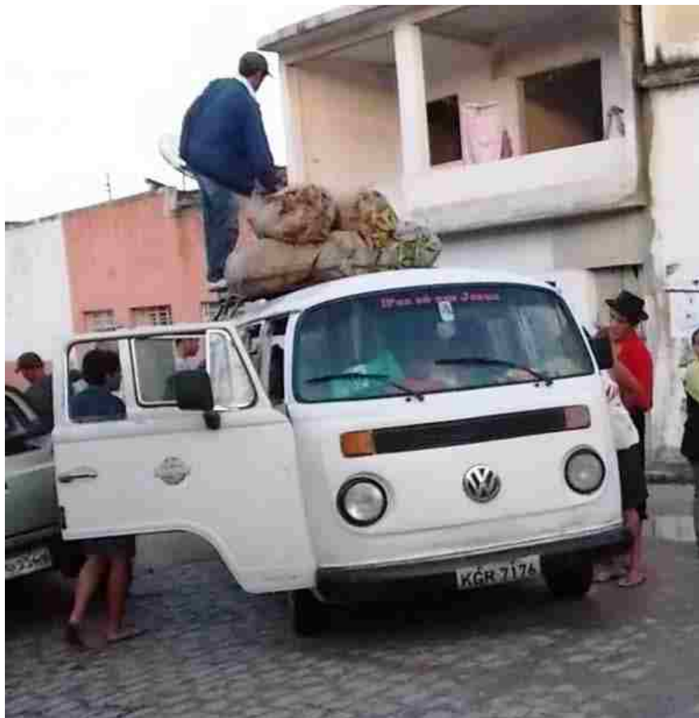
Figure 6.11: AFG producers arrive at agrarian reform market with bananas on the minibus