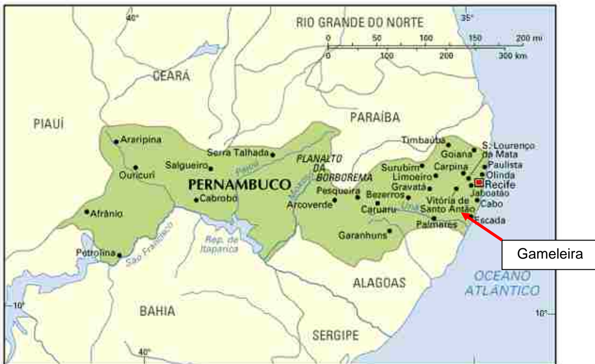
Figure 4.2: The state of Pernambuco

The Frei Gondim Agricultural Settlement is located in the county of Gameleira.