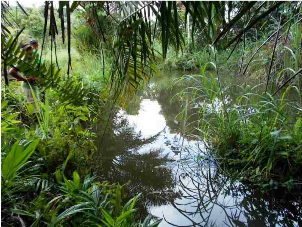
Figure 6.20: The family's drinking water

To start a new crop, Braganza creates a nursery in a forested area of his property. His agricultural production is naturally woven into the forest around him.