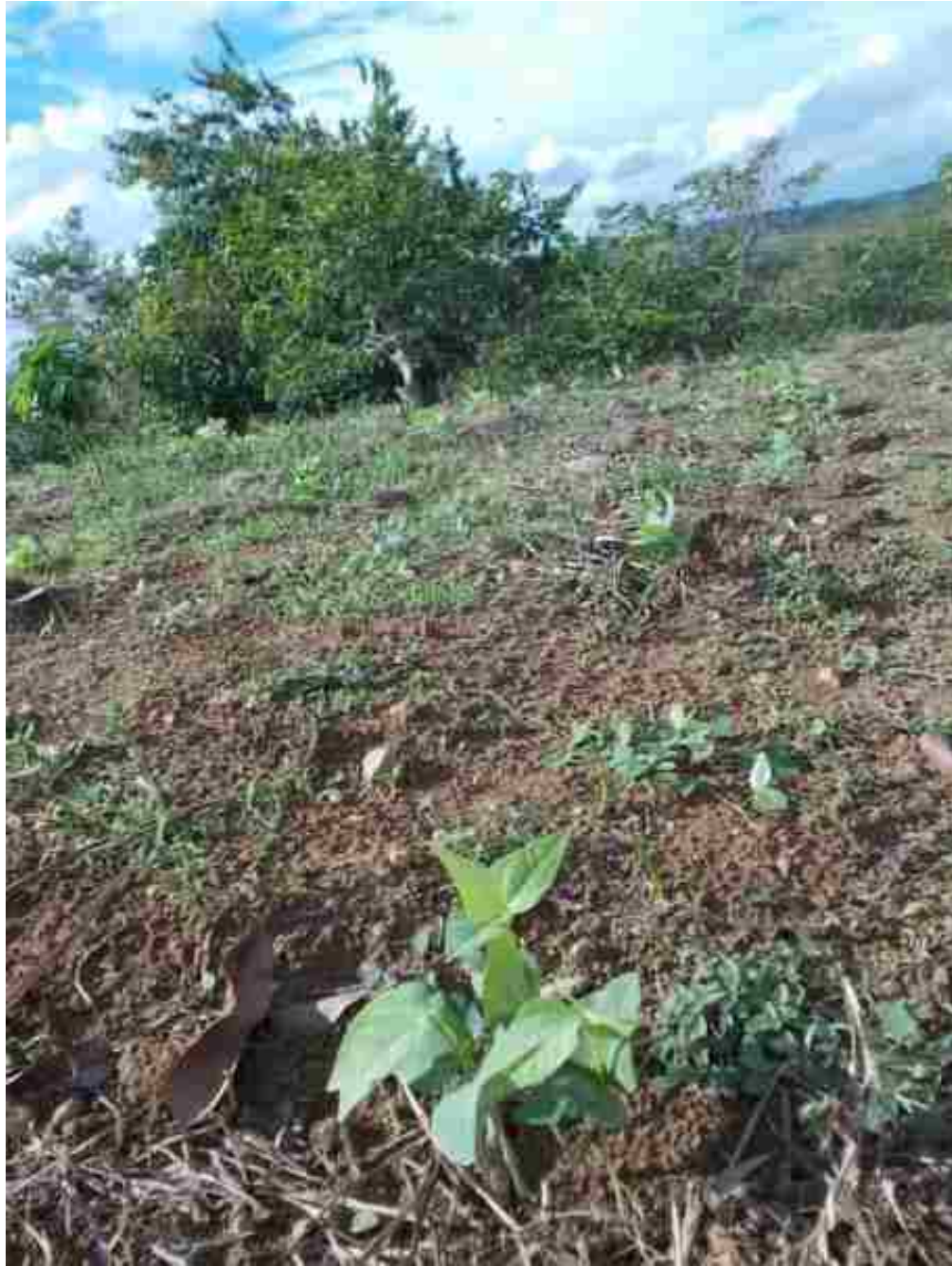
Figure 6.18: Beans enrich the soil