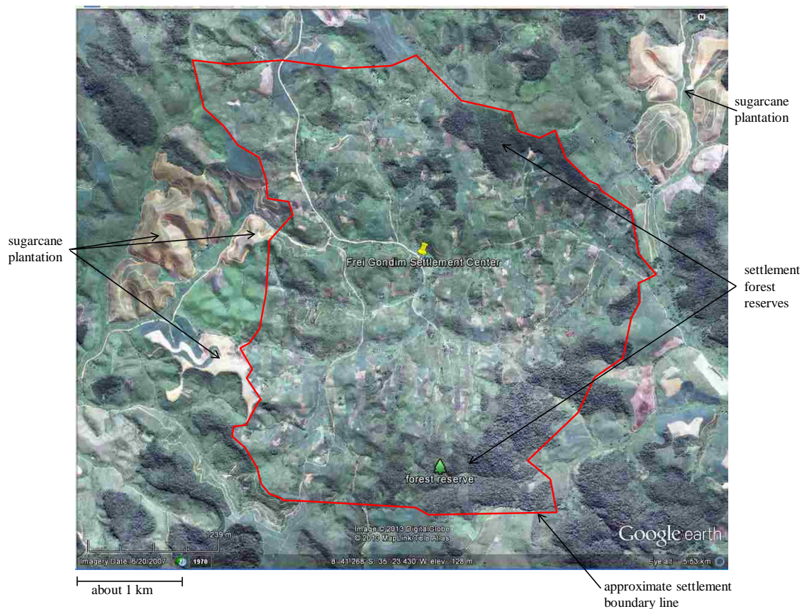
Figure 6.21: Settlement land use compared to surrounding sugarcane plantation

Sources: Remote imagery: Google Earth 2007 datum. Settlement boundary: Settlement parceling map, FUNTEPE, 1994. Labeled features: William Maxwell personal observations. This remote imagery shows a contrast between the land texture of the settlement parcels with that of the monoculture surrounding it. The rough texture of vegetation, including trees, throughout the settlement contrasts starkly with the smooth, in parts vegetation-free surface of the sugarcane plantation. Along segments of the settlement boundary, the legal boundary line is visible from space. One can see where settlers have preserved their forest, compared with the agricultural field just outside the boundary line.