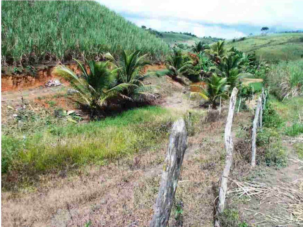
Figure 6.16: Neves's farm