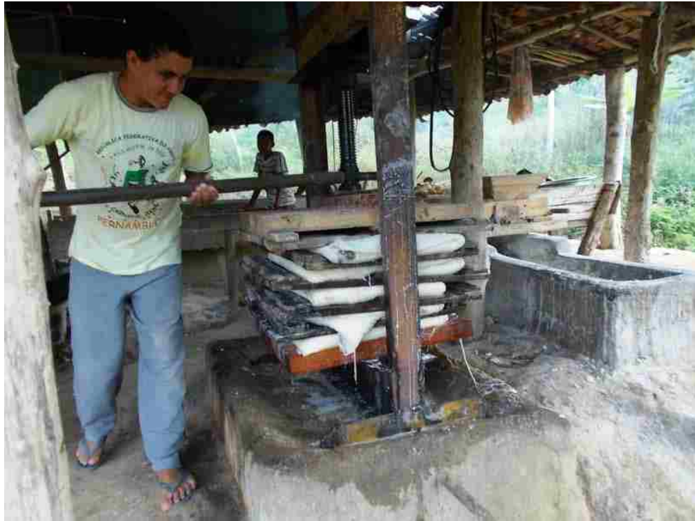
Figure 6.6: Pressing out the poisonous juice