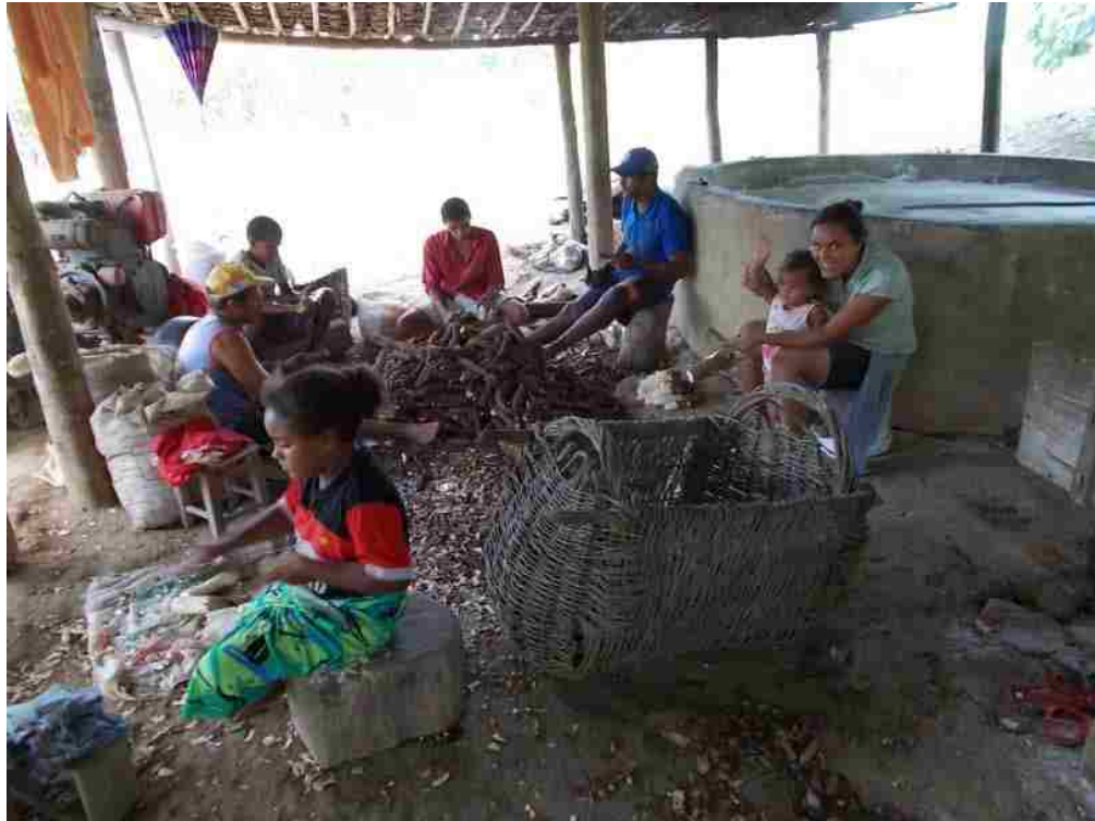
Figure 6.4: Step 1 is peeling the manioc