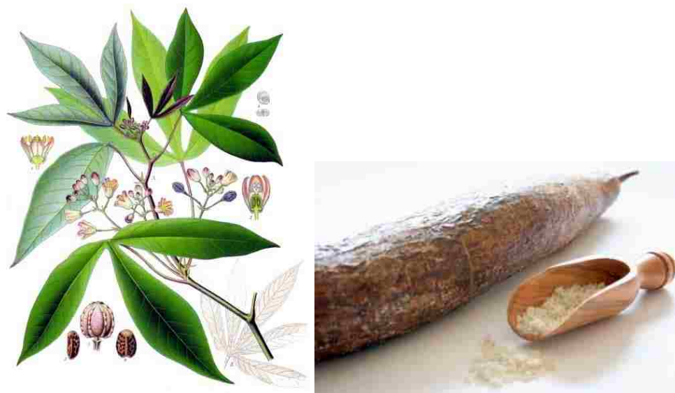
Figure 6.3: Manioc

Köhler's Medizinal-Pflanzen; http://onfoodandwine.wordpress.com/2008/04/07/manioc-chipsfries-otherwise/