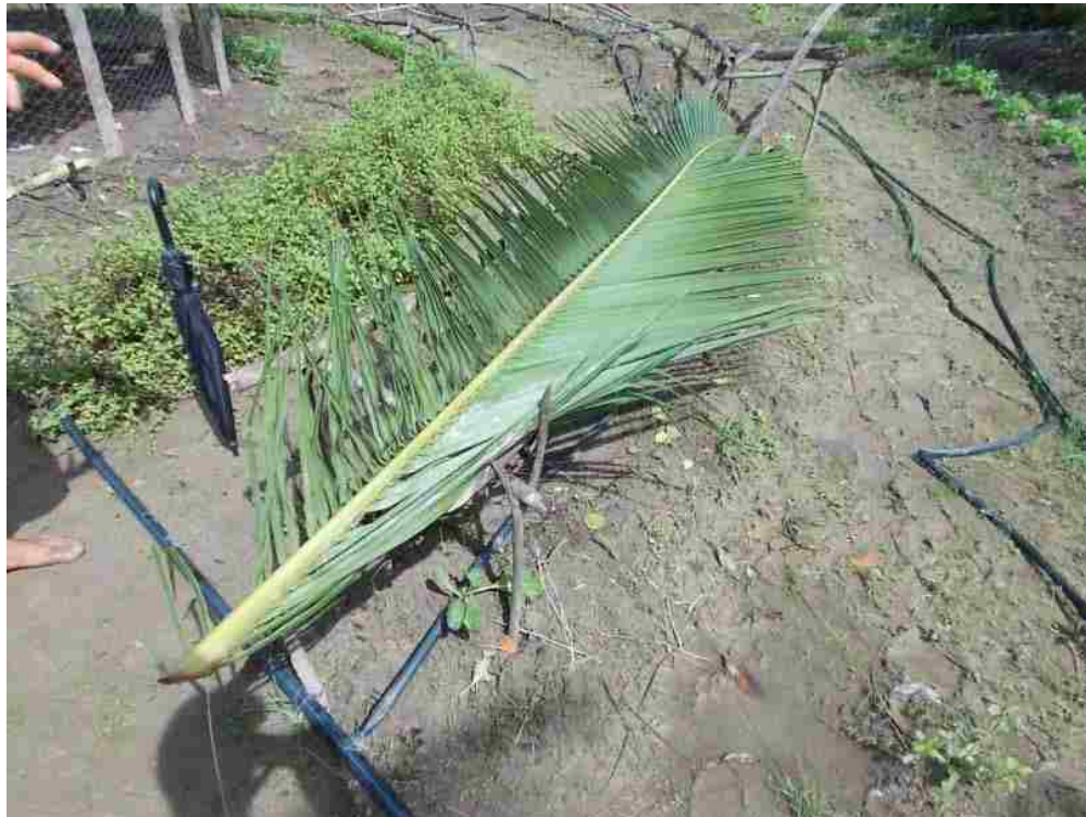
Figure 6.15: Appropriate technology in the KIT-PAIS garden