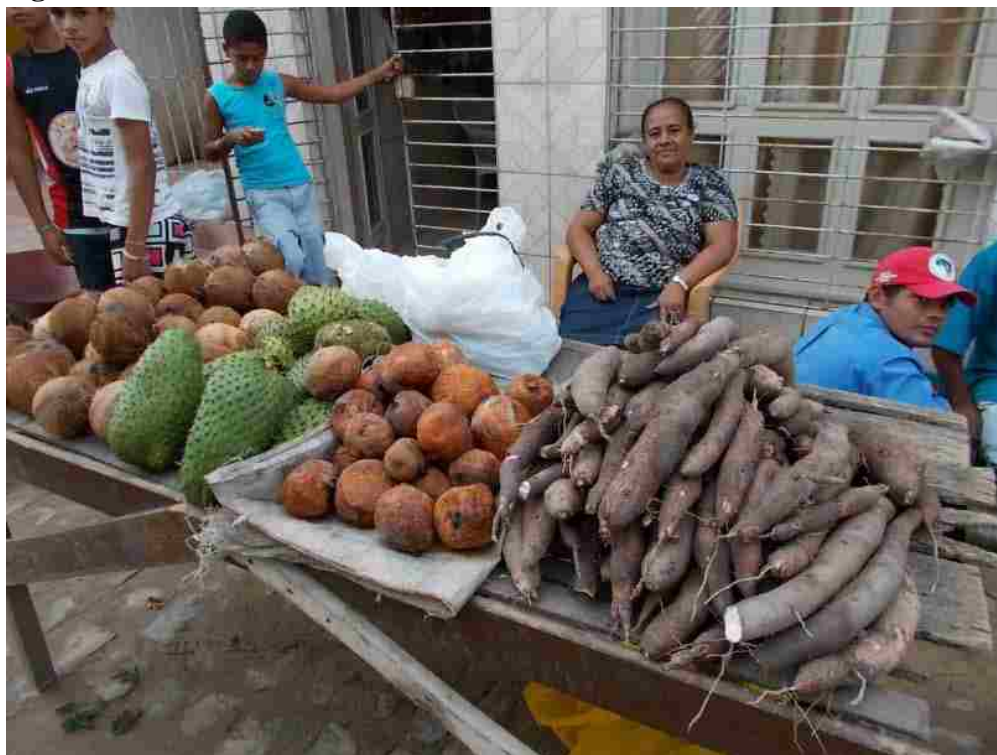
Figure 6.10: President of Frei Gondim women’s association sells wares