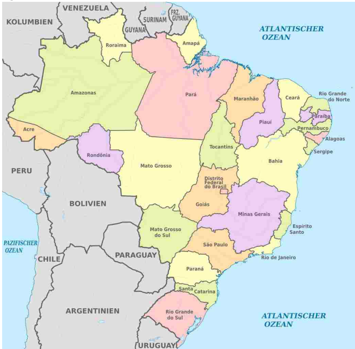
Figure 4.1: The location of Pernambuco in Brazil