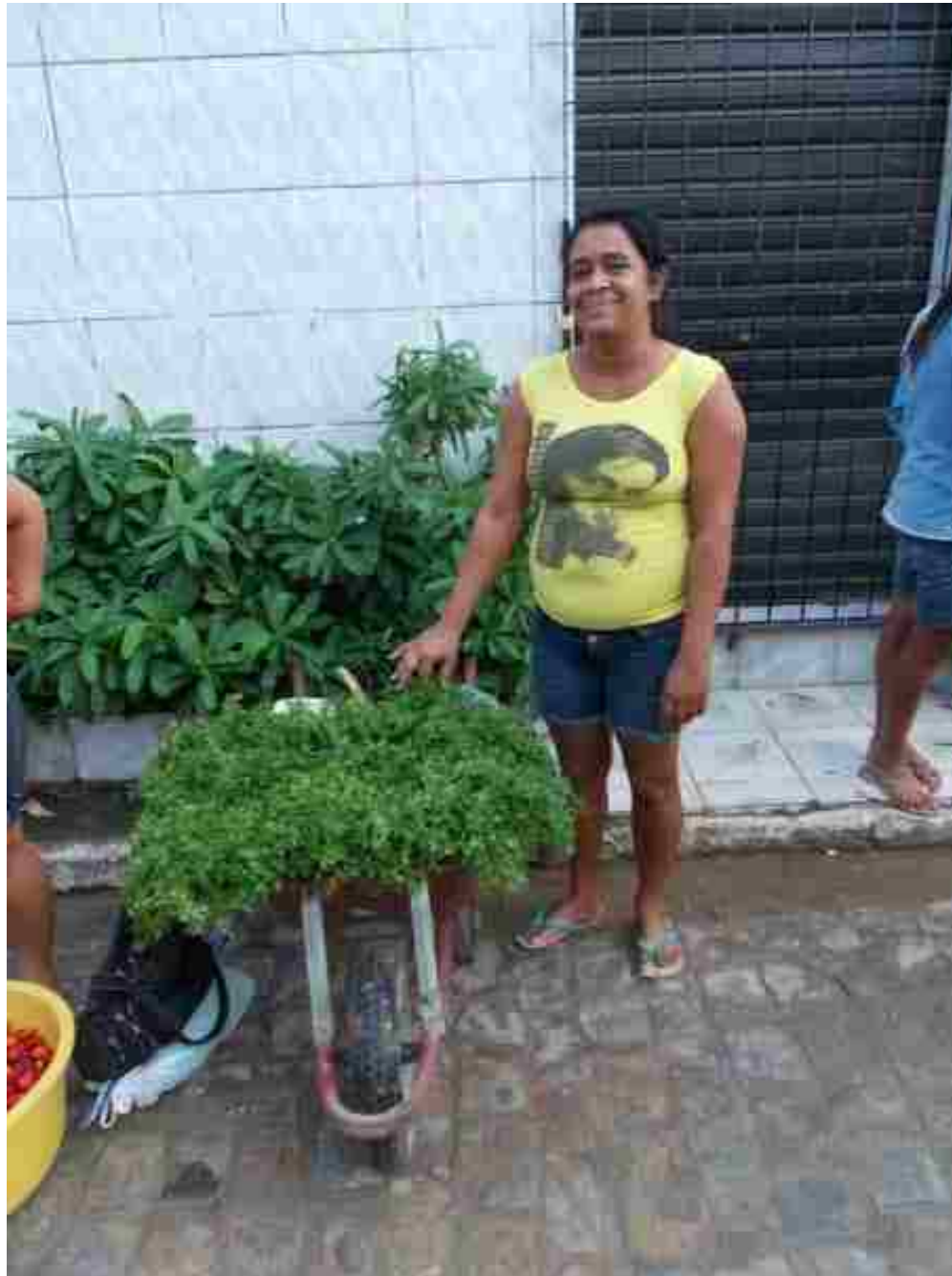
Figure 6.12: Cilantro at the agrarian reform market