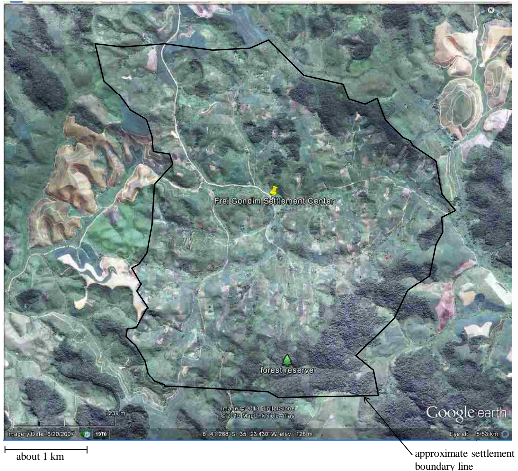
Figure 4.6: The Frei Gondim Settlement from space