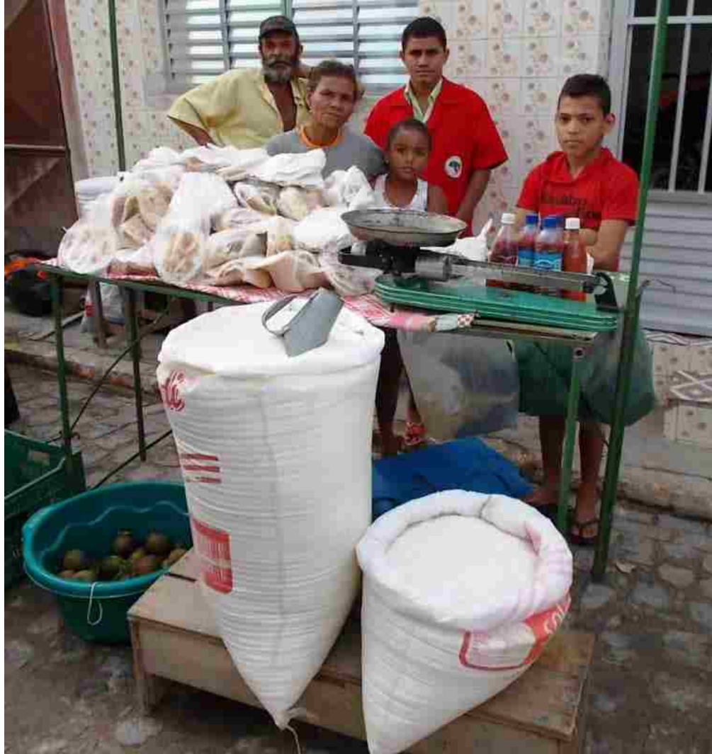
Figure 6.9: Manioc flour mill participants at the agrarian reform market