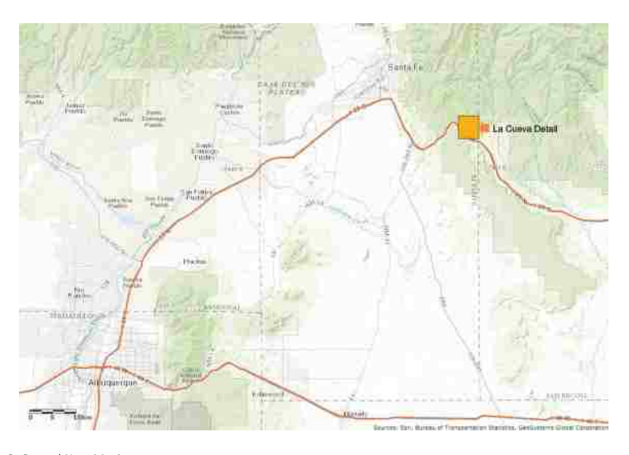
Figure 2: Central New Mexico map

La Cueva is a wildland-urban interface (WUI) community, and using Paveglio's WUI community archetypes, could be categorized as a "high amenity, high resource WUI community" (figure 3). The Santa Fe National Forest sits to the north and west of La Cueva, and there is a 133-acre satellite section of National Forest land on the southern end of the community known as Block E. There is only one road, Forest Road 375/63A, into La Cueva, and it passes through Block E. Block E is primarily ponderosa and piñon-juniper woodland. According to local residents, it was thinned about 50 years ago. The USFS has proposed a thinning project on Block E to improve forest health and reduce wildfire risk along the road.