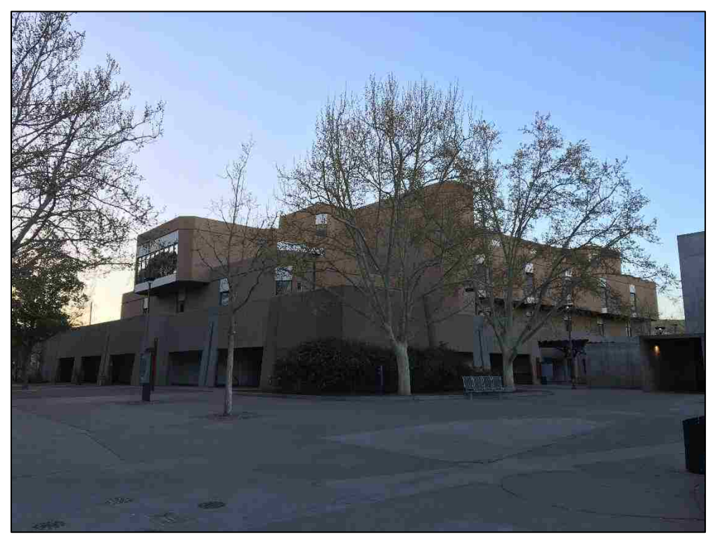
Figure 3. Ortega Hall, University of New Mexico

economic efficiency. As university administrators turned to brutalism for novel campus plans during the 1950s, some saw the style as an opportunity to reinforce the monastic tradition in the modern era. Paul Rudolph, architect of the Art and Architect Building at