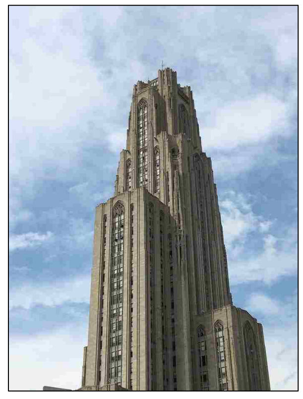
Figure 1. Cathedral of Learning, University of Pittsburgh

over the university district, built by the University of Pittsburgh and aptly named The Cathedral of Learning . Most citizens still identity the building as a civic monument belonging to the people, though the building was only made possible by favor of the capitalist elite in reciprocity for one of the most notorious cases of restricted academic scholarship (MacDonald 1938). The vaulted lecture halls were competed following the