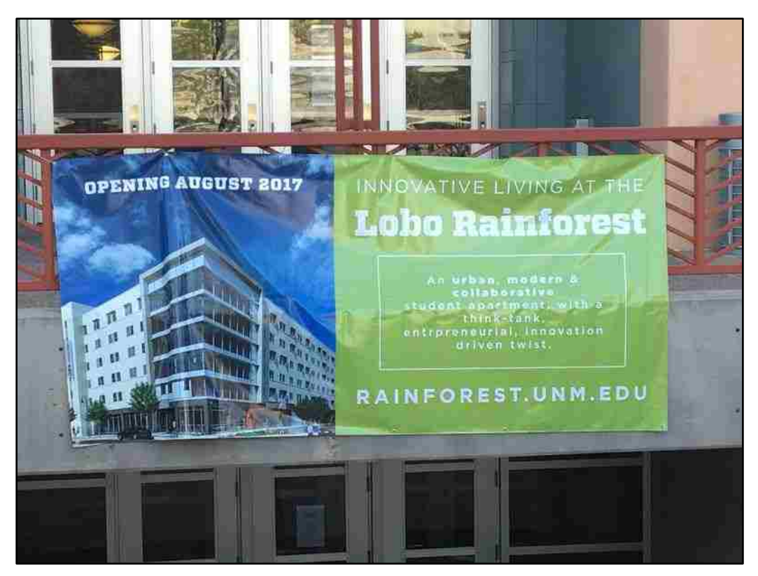
Figure 5. Banner advertising the Innovate ABQ residential complex

No longer does the university function as an ancillary force within bourgeoisliberal ideology nor does the university operate exclusively to perpetuate privileged