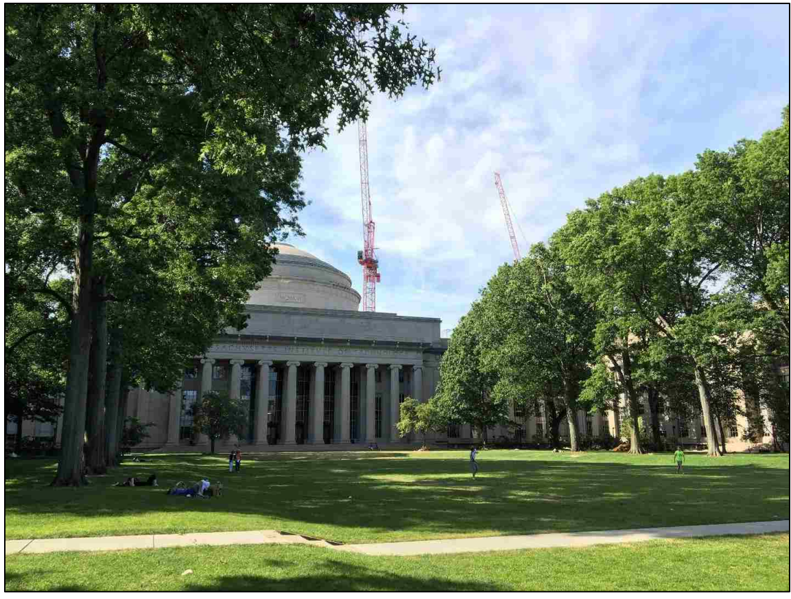
Figure 2. Construction at the Massachusetts Institute of Technology