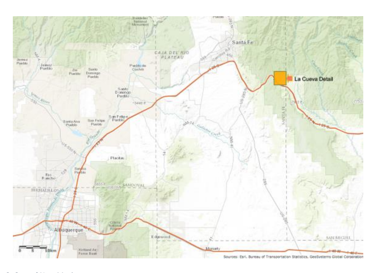
Figure 2: Central New Mexico map

La Cueva is a wildland-urban interface (WUI) community, and using Paveglio's WUI community archetypes, could be categorized as a "high amenity, high resource WUI community" (figure 3). The Santa Fe National Forest sits to the north and west of La Cueva, and there is a 133-acre satellite section of National Forest land on the southern end of the community known as Block E. There is only one road, Forest Road 375/63A, into La Cueva, and it passes through Block E. Block E is primarily ponderosa and piñon-juniper woodland. According to local residents, it was thinned about 50 years ago. The USFS has proposed a thinning project on Block E to improve forest health and reduce wildfire risk along the road.