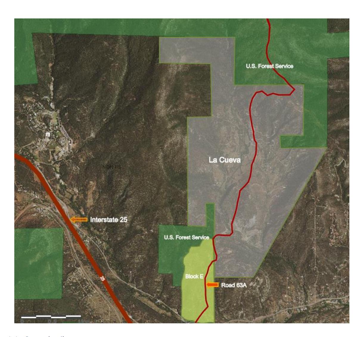
Figure 1: La Cueva detail map

La Cueva is in Santa Fe County, about 15 miles southeast of the city of Santa Fe (figures 1 & 2). There are approximately 60 households in the community, sitting on lots between five and forty acres in size.