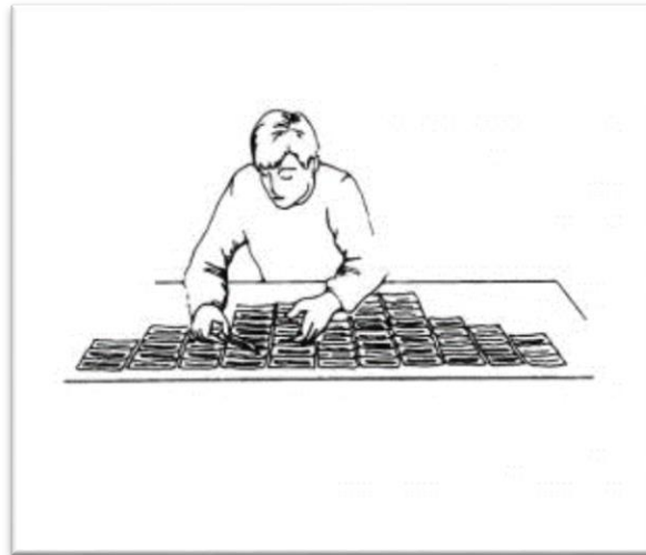
Figure 2 Example of Q sorting process. Note the bell curve shape allowing for more statements towards the center and therefore the undecided area.

methodology pursues a focus on the whole story and the relationships between factors.