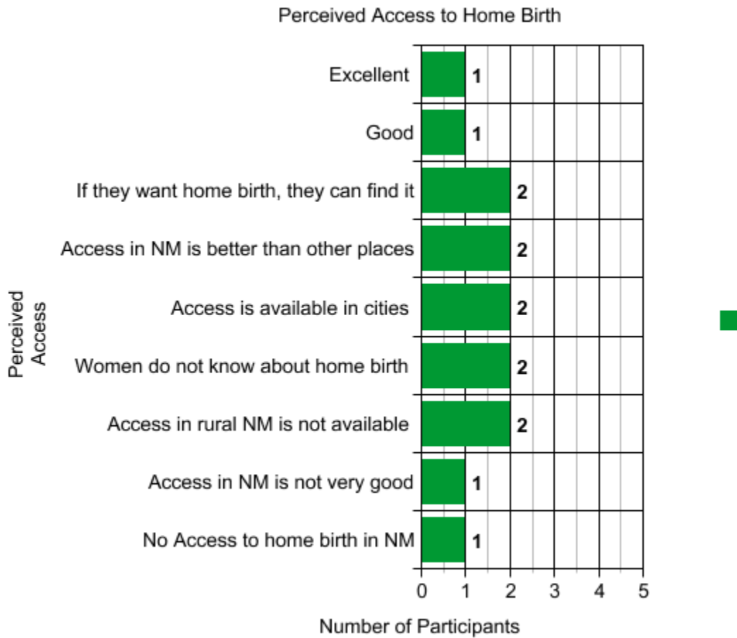
Table 7: Spectrum of Perceived Access to Home Birth

In expressing a general sense of the access women have to home birth in New Mexico, the table illustrates evenly distributed opinions, from excellent access to no access to home birth in NM. This fairly even distribution across a range of access levels is particularly interesting when given that midwife participants had many shared perceptions of what factors shape access to home birth. While midwives did identify external themes, (knowing about home birth, fear of birth, cost of home birth, and care provided by midwives) there was an overall sense of blame and responsibility on outside, often uncontrollable forces. There was also some blame on individual women for not