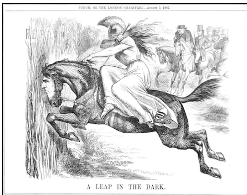
Figure 3: A Leap in the Dark. 698

These changes created problems in the coming decades for existing educational and political ideals, as the state had to adapt its responsibilities to the new demographic makeup of Britain's expanded electorate. The age of truly popular politics and emergent popular nationalism was at hand, and state-funded education was to play a central role in the reshaping of the British body politic at home and across the empire. 699