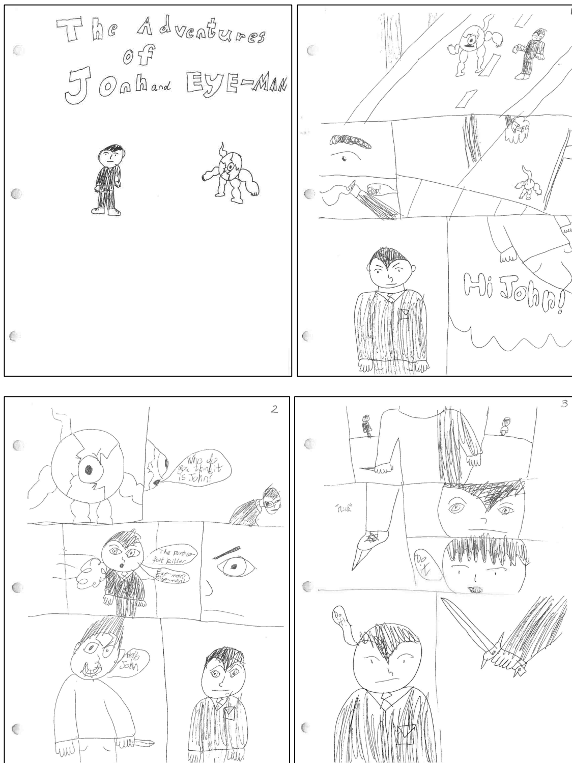
Figure 1: Sawyer's Graphic Novel, "The Adventures of Jonh [sic] and Eye-man"