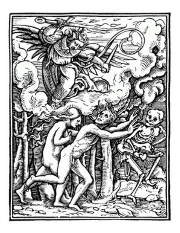
Figure 1: "The Expulsion" by Hans Holbein (1538)