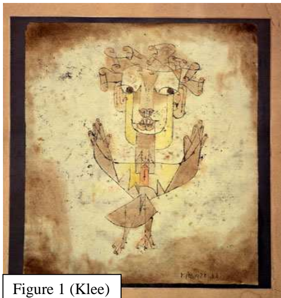
Figure 1 (Klee)

As a European Jew, Benjamin was forced to face the wreck of human history. He, like the angel of history, could not look away from the widespread destruction and death that human quests for power and progress had ushered in (see Figure 1, Klee). Benjamin's critique of historical materialism thus implicates all who conceive of time as linear path of continual progress.