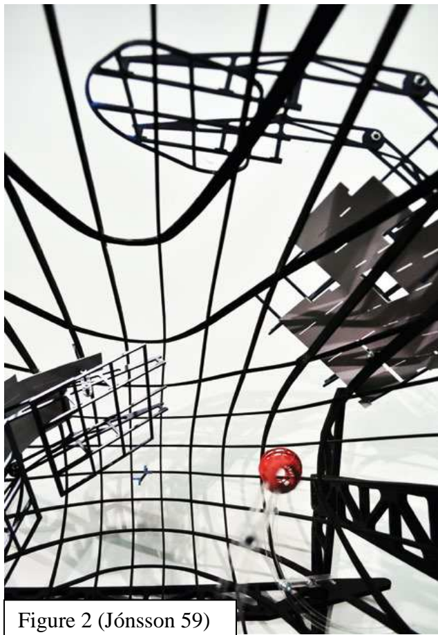
Figure 2 (Jónsson 59)

Islands of Vision (57). His creation is both an art installation and a model for structural components of future buildings. Islands of Vision is composed of “an assembly of architectural attractors, obfuscators, and scintillators... choreographed in relation to an observer as he passes through” (Jónsson 57). The result of these montaged features “is to constantly turn the attention of the observer from what is in front of him to what is around him... he is encouraged to witness himself seeing , and by so doing is dislocated from the centre of his own gaze” (57). Islands of Vision (see Figure 2) is part of a larger trend in architecture which, in catering to “peripheral vision, provides a key to the other senses, and a means to empower the observer, as it demands more engagement on his behalf” (59). Since “the thing that is represented can be veiled” when