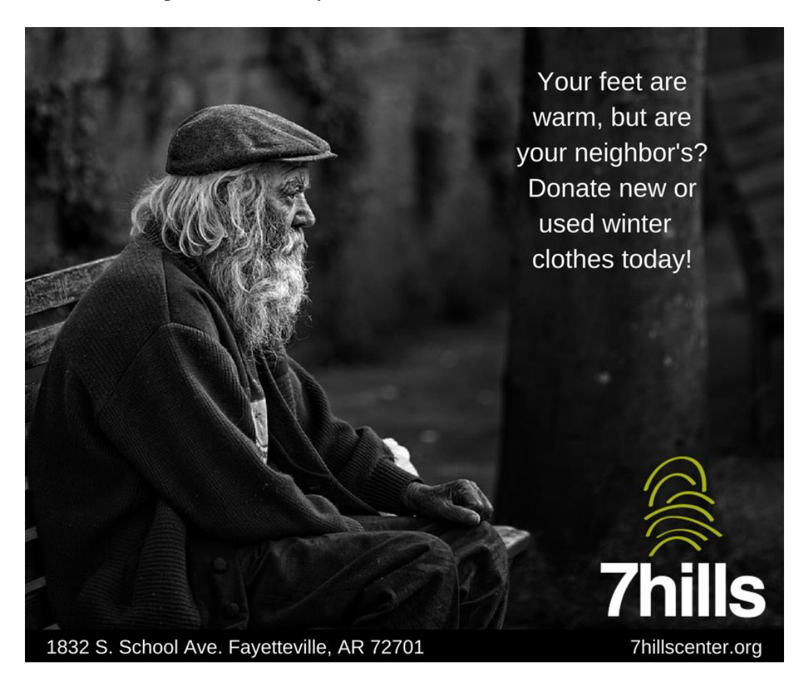
Figure 1: Example Post #1 (Feans, 2011)

Figure 1 shows an image of an older homeless man sitting on a bench in winter, with no socks on with his shoes. The image, along with the caption "your feet are warm, but are your neighbor's?" appeals to the primary motivation for volunteering and donating – helping someone in need (Cavato, 2016f). The text for this post is in the photo, but the following hashtags could be used, #7hills, #HelpYourCommunity, #Donate.