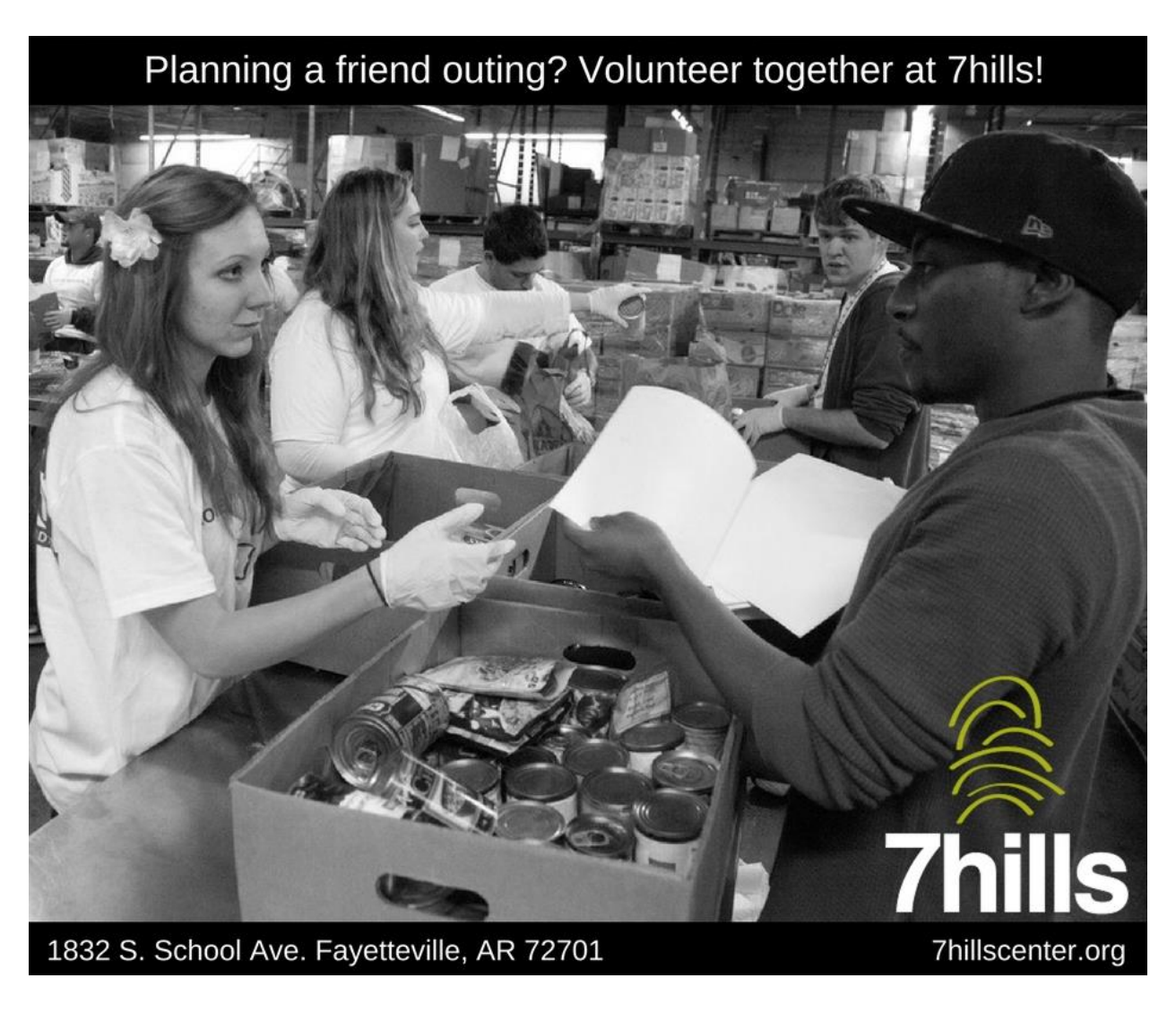
Figure 2: Example Post #2 (Mardorf, 2011)

Figure 2 shows volunteers in an assembly line distributing food. The caption "Planning a friend outing? Volunteer together at 7hills!" appeals to the college aged target group, identifying an activity to perform with friends while giving back and helping the community. The text for this post is in the photo, but the following hashtags could be used, #7hills, #HelpingTogether, #Volunteer.