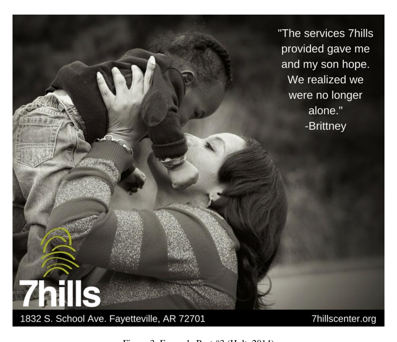
Figure 3: Example Post #3 (Holt, 2014)

Figure 3 shows an emotional moment with a mother and her son. "The services 7hills provided gave me and my son hope. We realized we were no longer alone." The headline features the positive impact 7hills provides locally. Again, this post depicts an organization where a volunteer or donor can help someone in need and appeals to parents, who are more likely to volunteer and donate. The text for this post is in the photo, but the following hashtags could be used, #7hills, #MakingADifference.