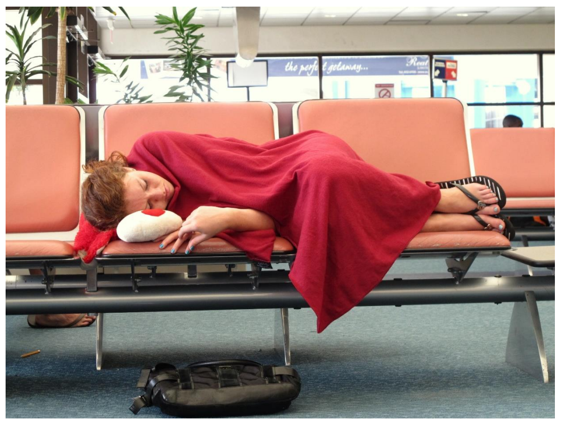
Figure 4: Example Post #4 (Oakley Originals, 2011)

Support our #Bedless campaign to raise awareness for the homeless. Take a picture sleeping in a random place and post it using the hashtag #Bedless. Donate $10 to 7hills Homeless Center at <a href="www.facebook.com/7hillsCenter">www.facebook.com/7hillsCenter</a> and tag 3 friends to do the same.