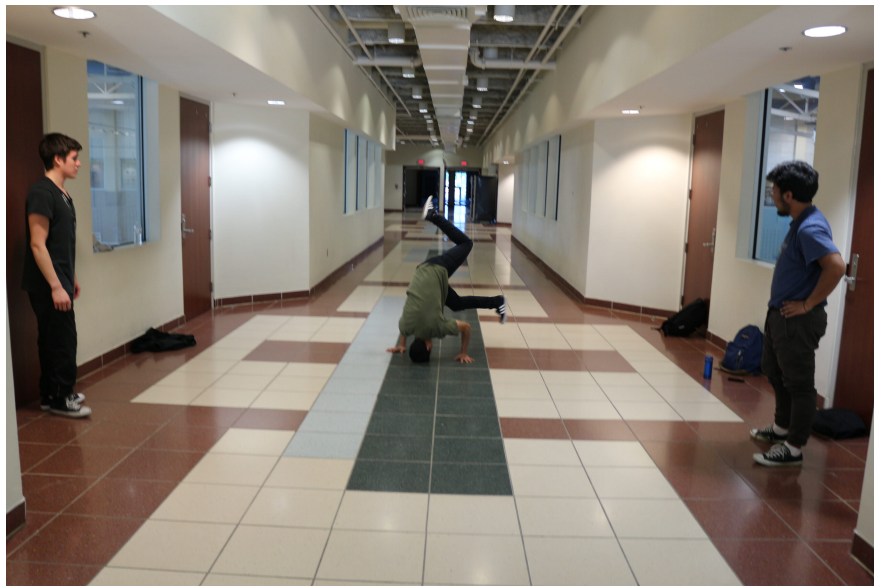
Figure 2 Inside of JCF without access to amenities.

Furthermore, a group of Marshallese young men that were met outside of the Springdale Youth Center (SYC) added more perspective to how the community was responding to the symbolic aspects fee system at JCF. While at SYC during a basketball event reserved for the Marshallese, a group of young Marshallese men brought up that the SYC’s membership cost as much as a JCF membership. Based on that comment, when asked why they didn’t go to JCF instead, one of them responded, “I go where the ballers are at” (field notes). It was difficult to make a connection with that piece of information when he also said that when they do go to JCF, they play in the basketball courts outside of the center in order to avoid the $3 dollar entrance fee.