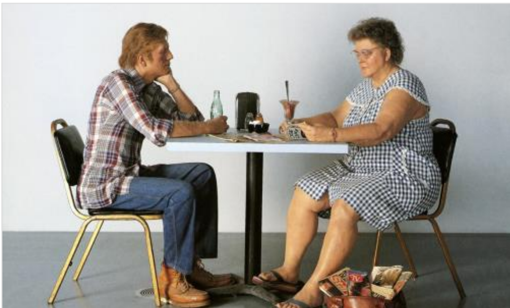
Figure 5- Duane Hanson "Self-Portrait with Model" 1979 Polyvinyl, polychromed in oil, with accessories, life-size. Collection of the artist.

become a perverse mantra summing up her life; the pre-recorded phrase inserted repeatedly attempting to fill the blank space of her increasingly pointless existence. Like pulling the string on a wind-up doll, the phrase is uttered, the lights flicker, followed by “silence, and she withdrew into herself as she had done so many times...she sat with her arms crossed, staring into the distance” (295). Lost in thought, the grandmother’s body rests, like a sculptural shell, at the table in a state of blank detachment. the figure of Hanson, in Self-Portrait... sits across from the elderly woman absentmindedly thumbing the pages of magazine, her partially consumed sundae melting unheeded - her state of detached contemplation resembles Knausgaard’s grandmother. The figure of Hanson thoughtfully regards her just as Knausgaard observes his grandmother during kitchen table conversations. The same sense listless detachment in the sculpture finds a