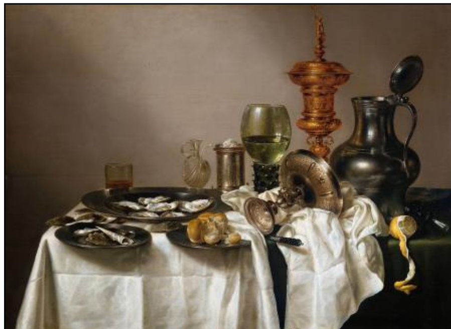
Figure 2 Willem Claesz. Heda, Still Life with a Gilt Cup . 1635.

Despite the spirit of utilization, there is an obvious visual strategy at work in the staged imperfection arranging the objects in the paintings. Flat silver platters, curling lemon peels and thick bread rolls accumulate, spilling over the hills of napkins, midsize decanters and overturned chalices, towards the center, peaking in a crescendo of gilt tea urn and glowing wine goblet. Each pyramidal arrangement has a clear climax. The familiar warmth of use draws us in, the exquisite detail, and relatively small scale of the panels, pull us in still close to better see the