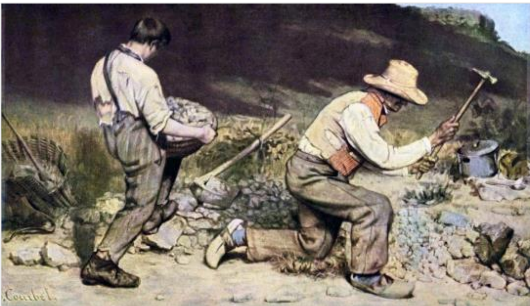
Figure 3 - Gustave Courbet "The Stone-Breakers" 1850

The realism art movement arose during the 1800's in France as a response to the widespread disconnect occurring between art and life. Rejecting the classical mythological subject matter, involving frolicking nymphs, satyrs and goddesses populating the work of Academic painters, artist Gustave Courbet, considered the father of realism, adopted everyday