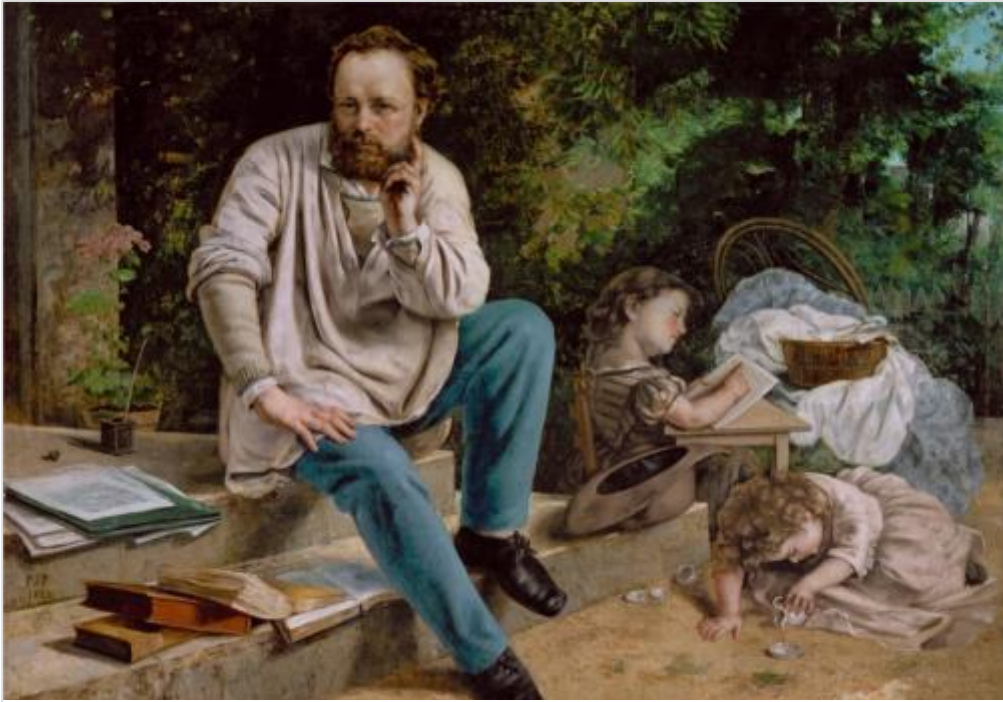
Figure 4 - Gustave Courbet "Portrait of P.-J. Proudhon" 1865

sans maternal assistance. Mentally distracted, like Proudhon, Knausgaard is eager to shuttle his two daughters off to daycare allowing him to return to his intellectual pursuits.