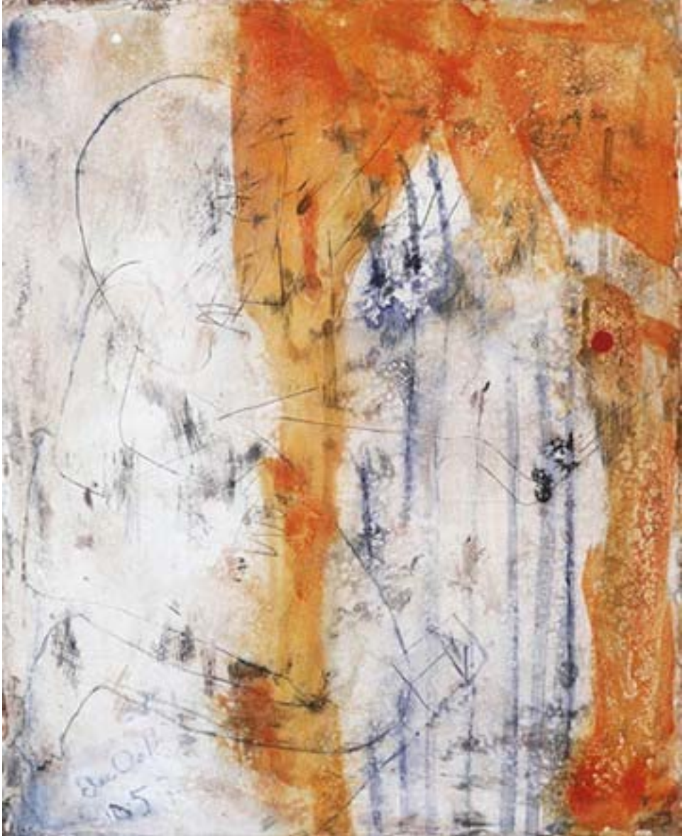
Figure 3. My Room World