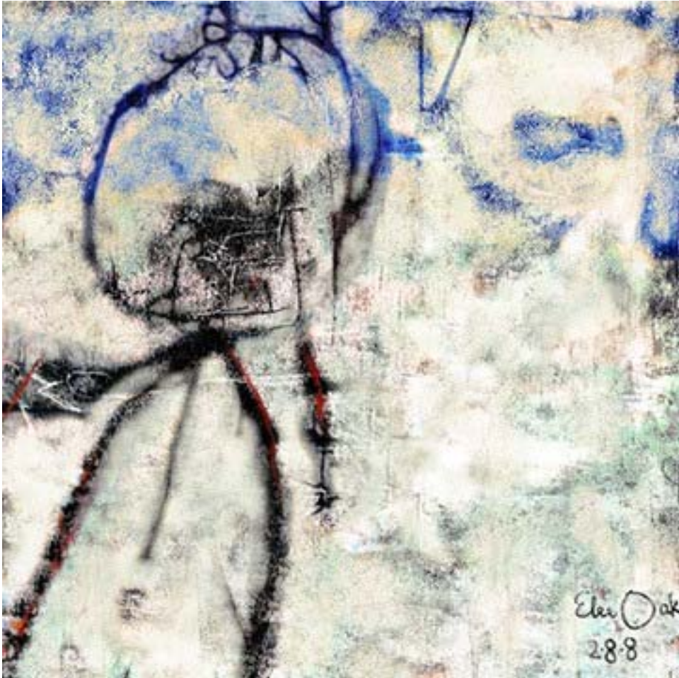
Figure 9. Pissing on Today