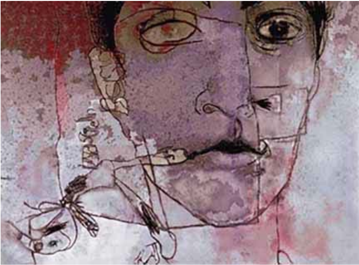
Figure 8. Childs Play