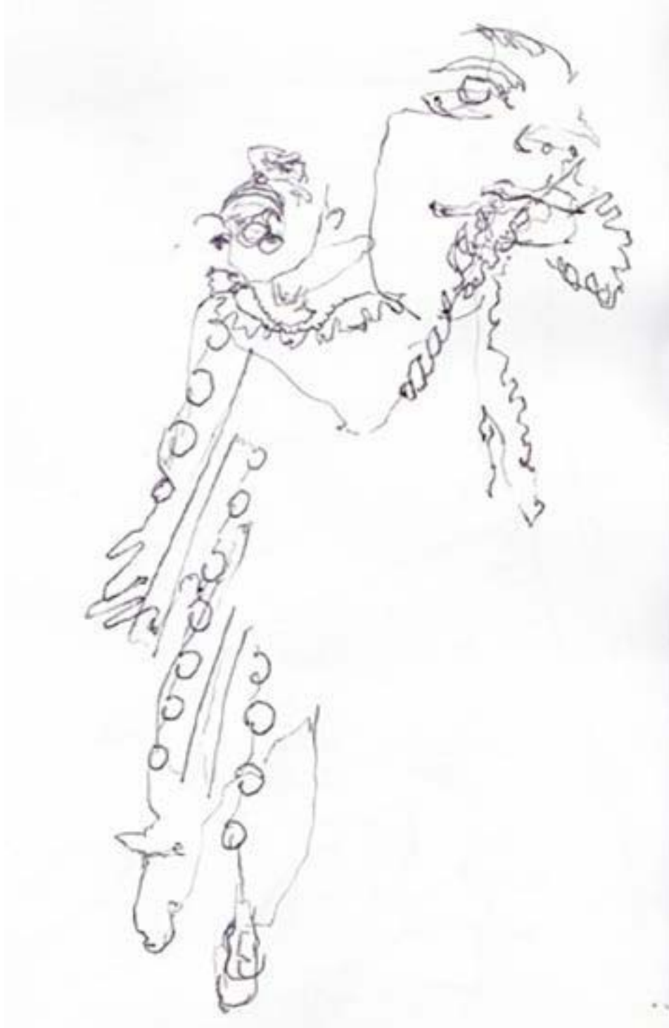
Figure 7. All Souls Day