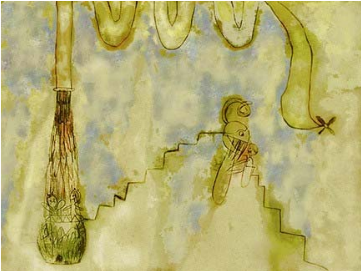
Figure 5. Ducting