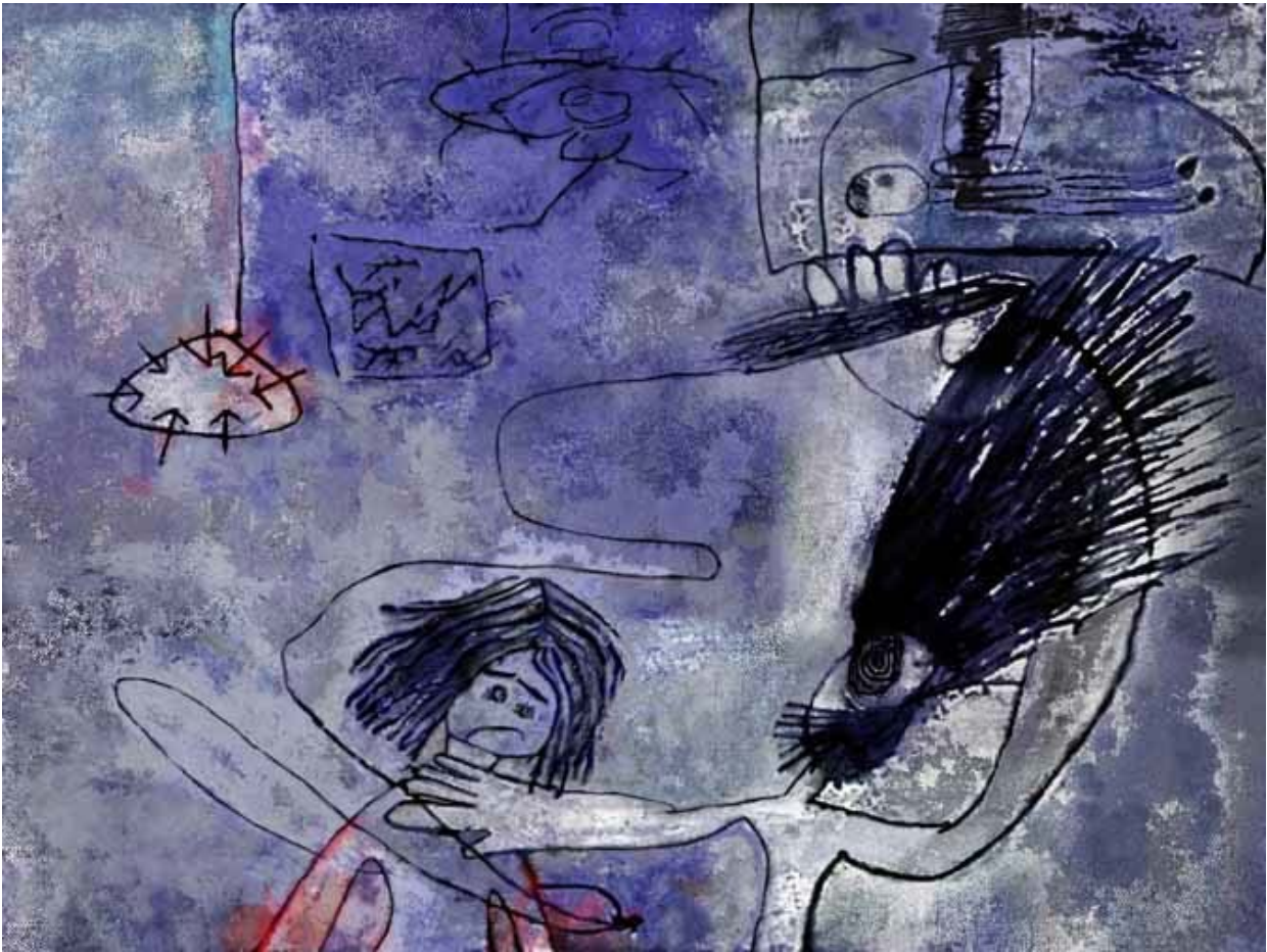
Figure 2. Map of a Young Grrl