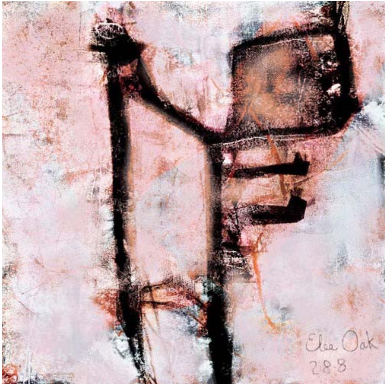
Figure 1. Shoulder Chip