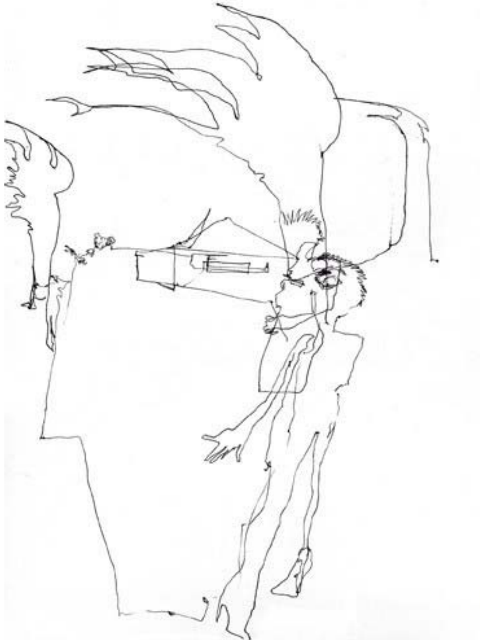
Figure 4. Blowing Kansas