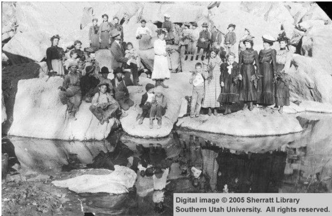
FIGURE 4: SPRINGDALE SCHOOL OUTING TO WEEPING ROCK, 1908.