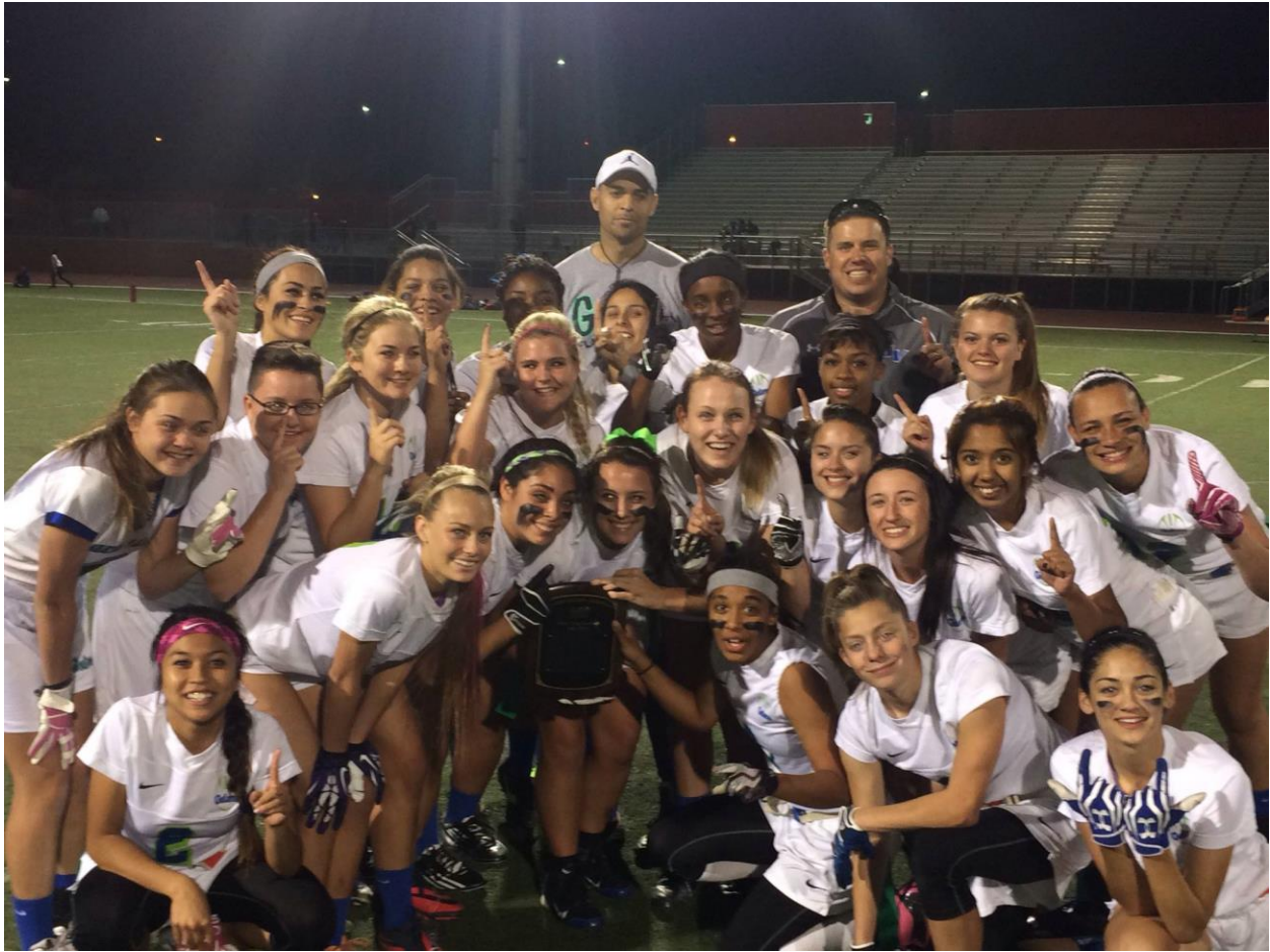
Photo 1: Green Valley High School Girls Flag Football Team 2014 Sunrise Region Champions.