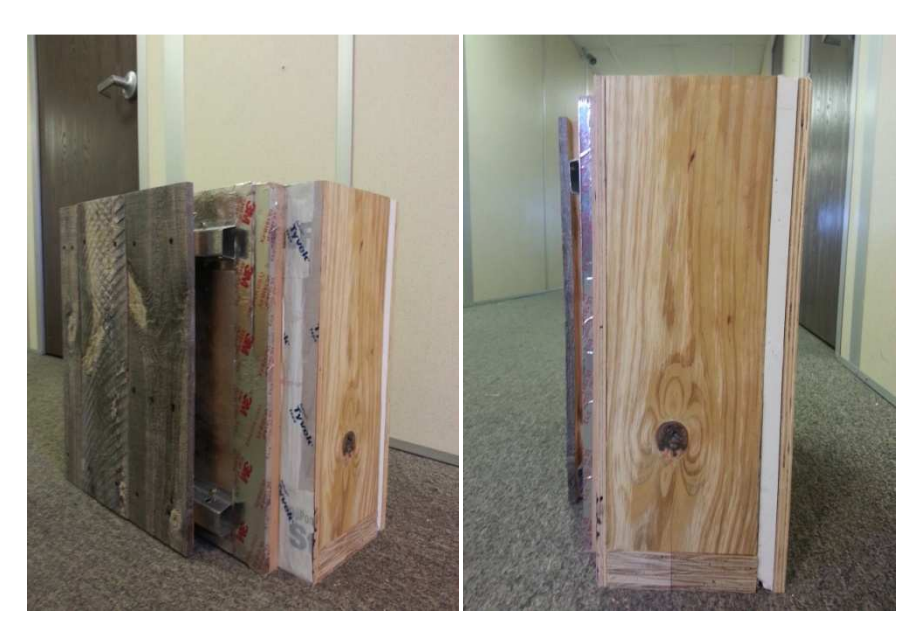
Figure 4. Exterior Wall Sections

gypsum board with a level 5 painted finish was installed on the interior. The gypsum board was covered with finished plywood on the interior. The overall R-value of the exterior wall after spraying was 23.4. The interior wall was also based on the 2x6 framing with spray foam insulation in it. The insulation was covered with 5/8-inch thick type 'X' gypsum board painted on either side. In the case of the interior walls, the gypsum board was covered on both sides with the finish material as designed.