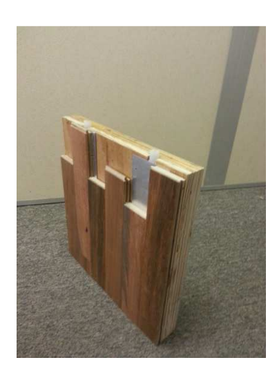
Figure 5. Floor Sections