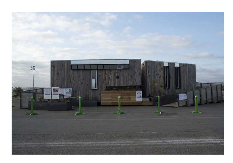
Figure 3. North Face of DesertSol