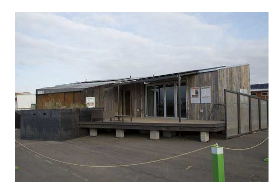
Figure 2. South Face of DesertSol