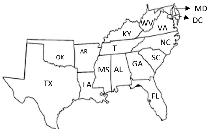
Figure 1. The U. S. Southern Territory of The Salvation Army.

The Salvation Army Southern Territory headquarters is in Atlanta, Georgia. The USA Southern Territory includes 15 states that are divided into nine divisions (The Salvation Army USA, 2019).