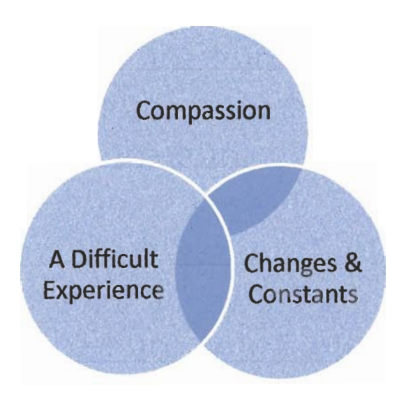
Figure 4.1. Major Themes