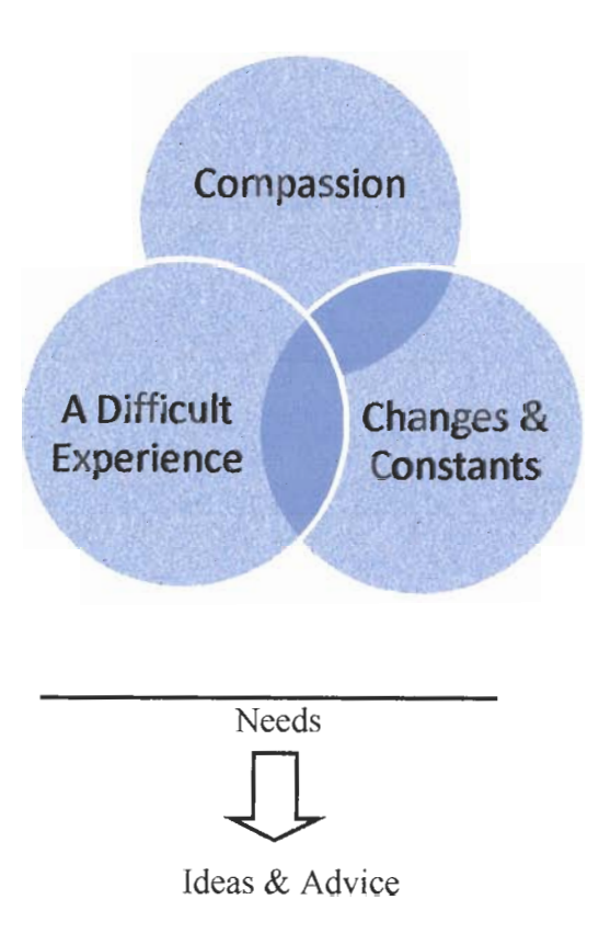
Figure 4.2. Needs Development from Major Themes

Siblings were asked if there was anything that they wanted adults to know. At times, siblings were able to identify and express their own needs related to the