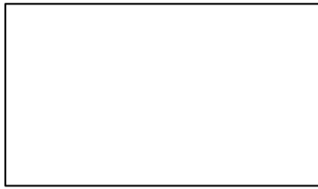
FIGURE 2. Universal testing machine (MTS Sintech Renew 1123, Eden Prairie, MN).