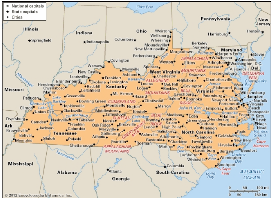
Figure 1a: The orange states in this map represent the upper South.

I conducted a study in which I analyze Hispanic religious ministry in the Upper South, one of America’s newest Hispanic destinations (Figure 1a) in an effort better to understand modern Hispanic ministry locally—among organizations and missionaries sponsored by mainstream religious denominations in the U.S.