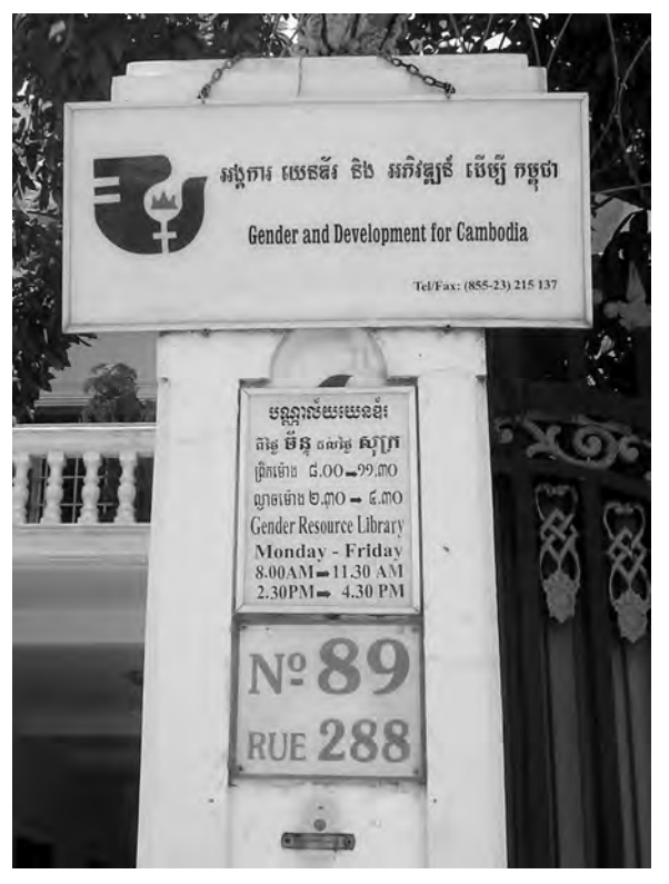
Figure A.2: The address on the office of the GAD/C uses the French word for "street"

The Womyn's Agenda for Change/ Women's Network for Unity office, according to the website, was located on Sisowath Quay, the main street along the river, not far from my guesthouse. The website even showed a map of the exact location. Feeling overly confident, I did not locate the office prior to my first meeting with the WAC. Map in hand, I walked back and forth past the spot where the office was supposedly located. Finally, late for the meeting, I found a pay phone and called the staff member with whom I had been in contact. I described to her where I was standing, and she came out onto the street to meet me. She then led me back to the office, which was over the bank and on a stationary boat floating on the river.