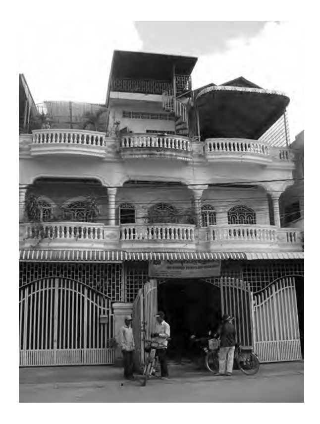
Figure A.1: The motorbike driver I hired, standing outside the office of the Cambodian Women's Crisis Center

To further complicate matters, the streets were assigned numbers under French colonial rule. This is how they appear on all official maps of the city. Many local residents, however, do not use these numbers. Directions are given based on a relational understanding of what businesses or landmarks are nearby or on a certain block. Though most of the street corners are numbered according to what is on the map, one can see this once they have already managed to make it to the street. Asking for directions based on a street's number is generally useless. Below is a picture of the address outside of the office for GAD/C, number 89 on street 288.