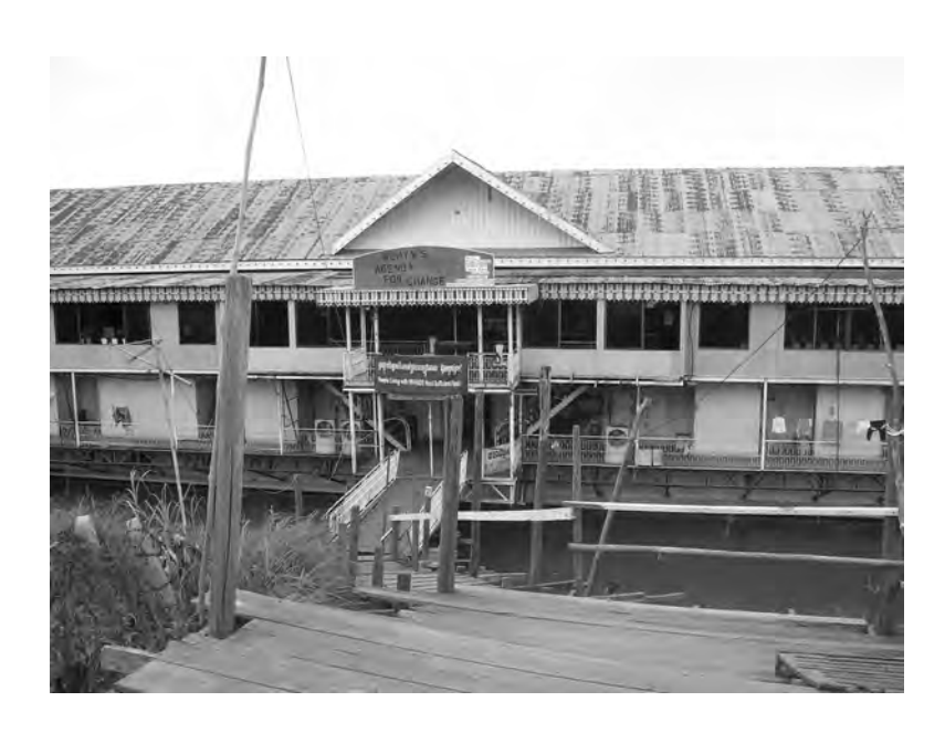
Figure A.3: The floating office shared by the Womyn's Agenda for Change and the Women's Network for Unity

A few times, I showed up for a scheduled meeting only to have it rescheduled for another time. Just because I felt pressed for time and wanted to plan all of my meetings to the last detail did not mean that all of Phnom Penh was going to change its ways for me.