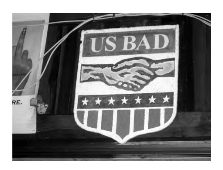
Figure 3.3: Anti-USAID Poster

Upon entering the WAC's homepage (www.womynsagenda.org), one is greeted by a slide show, depicting the debt problems faced by many poor, Cambodian women. The show explains, "I borrow money to buy: a pig, rice seed, pesticides, fertilizer, water, a cow, to eat, health and medicine. To pay back my loans I sold: my land, my food, my labour, my house, my cows, my pigs, rice seed. But I still have a debt!" ("Welcome", n.d.).