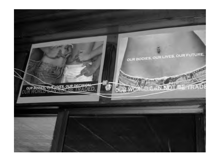
Figure 3.2: "Our World Can Not Be Traded"