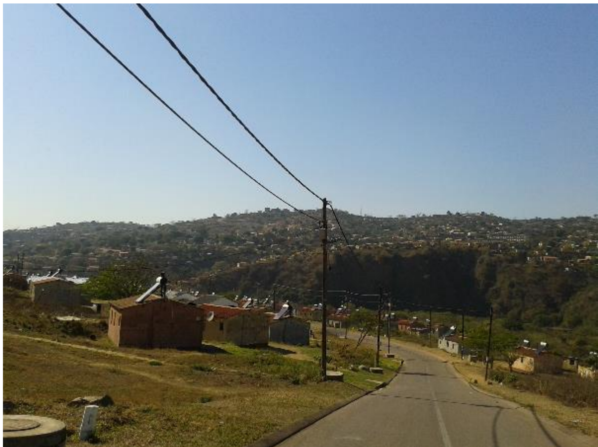
Figure 4.3.4: The entrance to the single road of houses

The lack of service provision is made worse by the poor level of infrastructure and inadequate housing in the area. The uneven development of infrastructure between core and peripheral regions is highly evident in Welbedacht. The area consists of a single street with 100 houses along each side of the road. That is the start and end for infrastructure here which can be seen in figure 4.3.4 below.