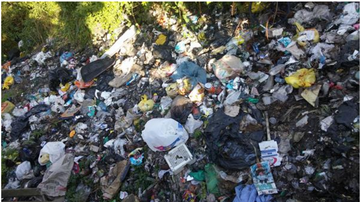
Figure 4.3.2: Large amounts of waste that have accumulated due to poor service delivery

Likewise, as stated previously, criminals discard corpses amongst the refuse because there is just so much of it that the corpse can become lost amongst the waste. This speaks volumes not only for the level of criminality in the area but also reinforces the poor service delivery and complete lack of social justice within the urban periphery.