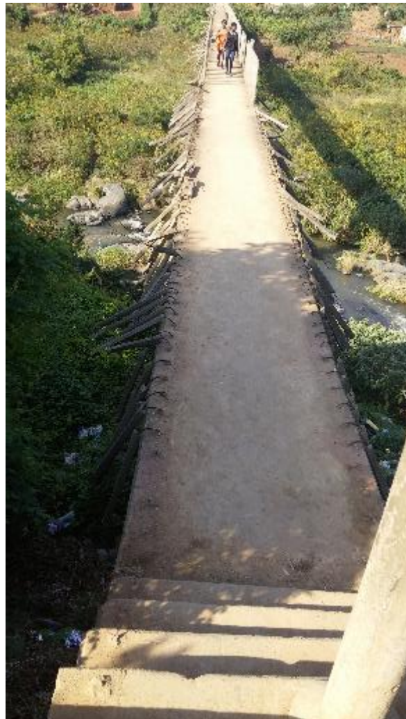
Figure 4.5.1: Old and decrepit bridge

bridge infrastructure to access their school. Figure 4.5.1 below represents the bridge which young children are forced to cross in order to attend school.