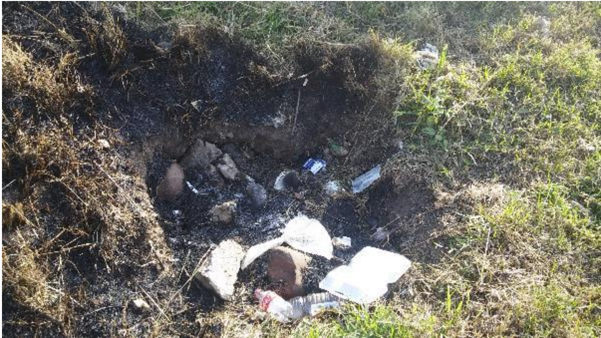
Figure 4.3.3: Pit where residents burn their refuse

The aforementioned lack of mobility in Welbedacht is largely due to its locality within the urban periphery. Whilst the urban core is commonly known for a variety of transportation options, the urban periphery is largely lacking in this regard. Transport plays a monumental role in the economic transformation of a region as it provides residents with access to employment (Faiz, 2011). However, in areas such as Welbedacht where transport is mostly problematic, the urban periphery begins to exude its reputation of inequality. Moreover, the lack of transport in this area is largely responsible for the devastatingly high unemployment rate. What's more, the limited transportation that is available is tremendously costly. Please take note of the following statements in this regard: