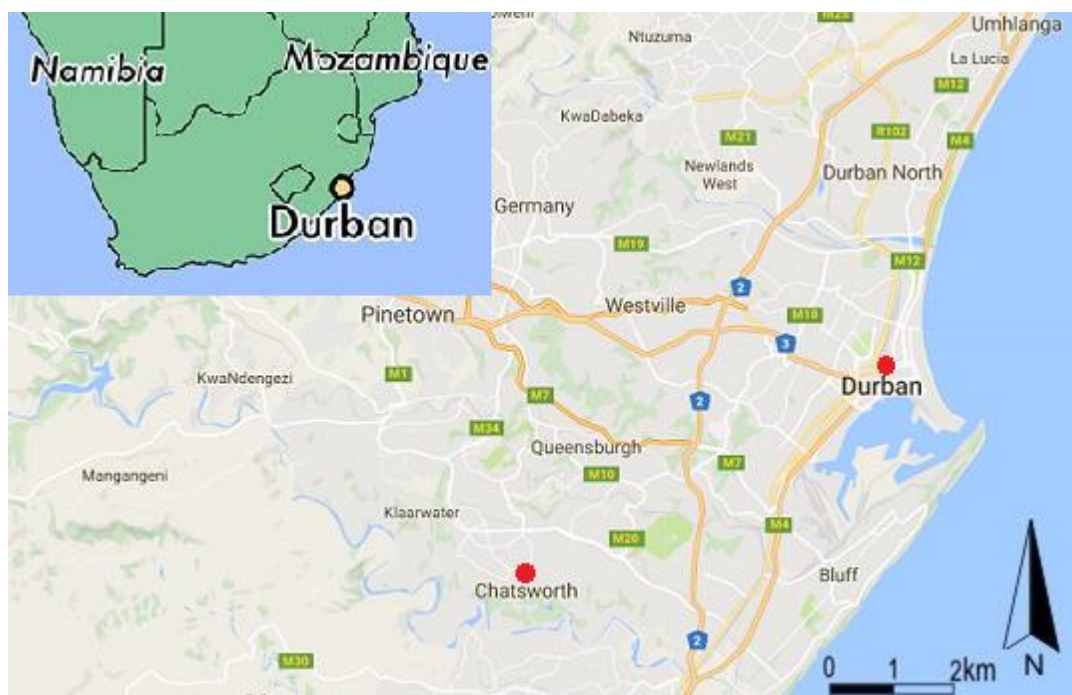
Figure 2.4.1: The research location (Welbedacht) and the former location of the Ark residence