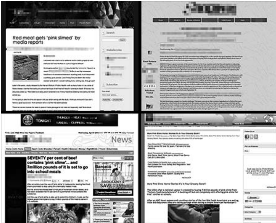
Figure 2. Selected websites. From left to right, top to bottom: Website 1, Website 2, Website 3, and Website 4.

The webpages with good aesthetic quality were chosen as examples of good design (Williams & Tollett, 2007) and as examples of high elaboration through the peripheral route of Petty and Cacioppo's (1984) Elaboration Likelihood Model in mind. The webpages with poor aesthetic quality were similar to ones that were observed by the expert faculty panel that were unpleasant to look at and without principles of good design.