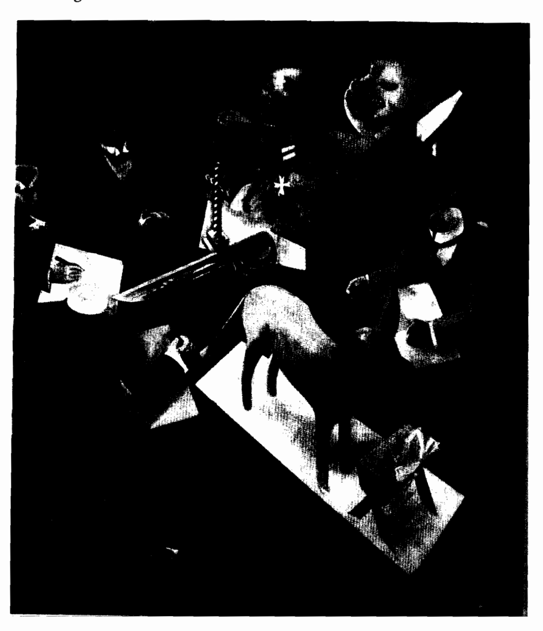
Figure 2. George Grosz, Eclipse of the Sun, 1926.

of state to which the General is speaking. The men are seated around a large green table and are shown writing on pieces of paper. Atop the table, are three objects; a cross, a bloodied sword placed in front of the General, and a blindfolded donkey eating crumpled up paper from a trough. A caged child, a crying baby and a skeleton are all placed in the bottom right corner on the floor.