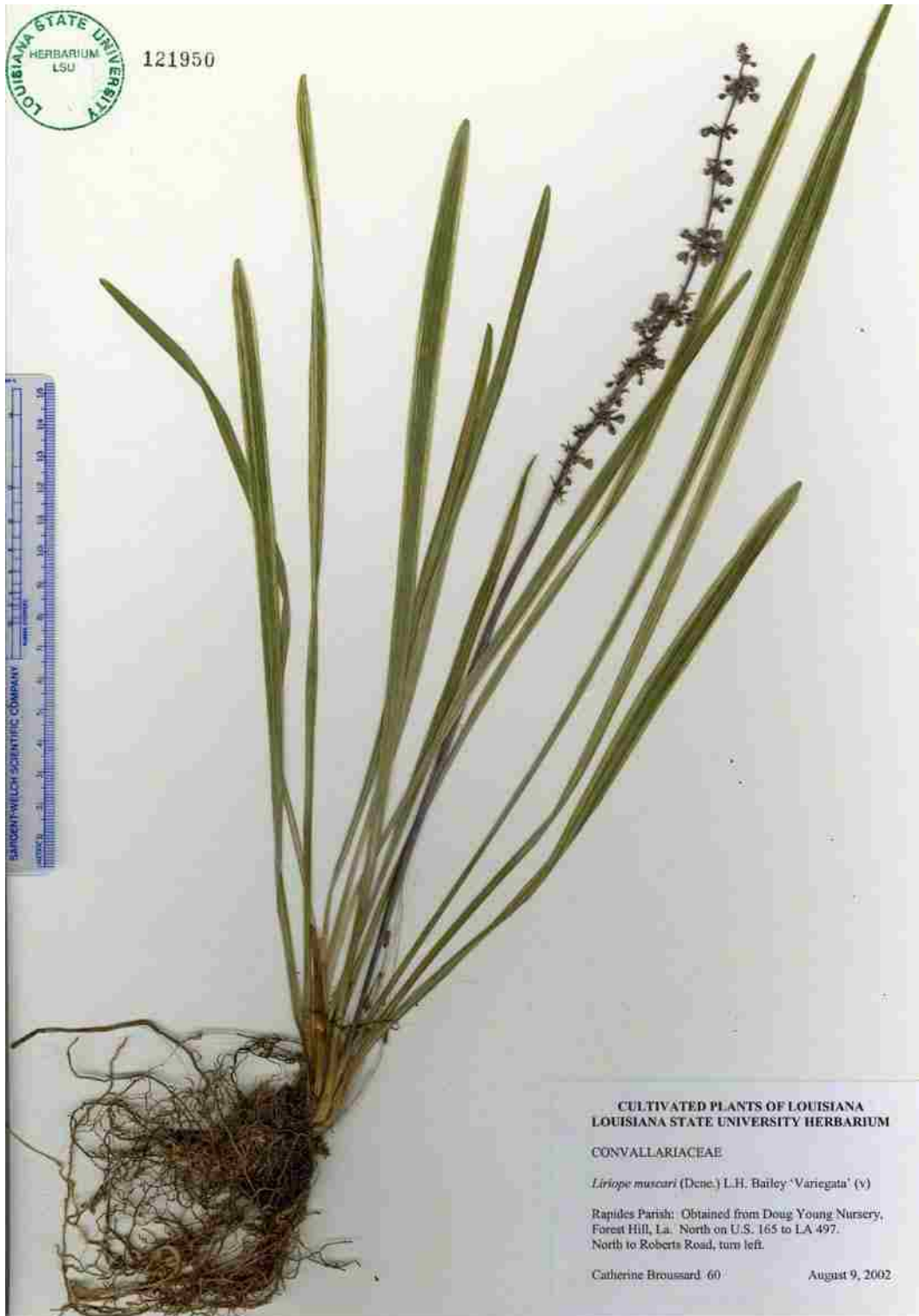
Figure 4.20 Herbarium Mount of Liriope muscari 'Variegata'