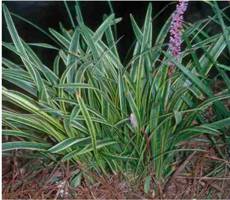
Liriope muscari 'Variegata'