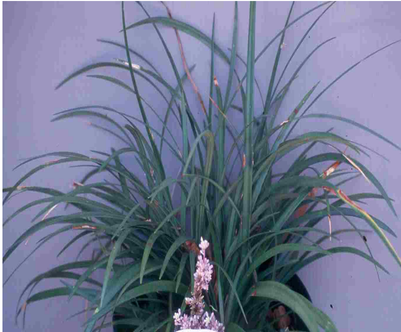
Liriope gigantea 'Evergreen Giant'