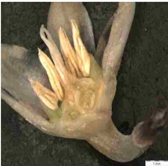
Figure 4.1 Ophiopogon flower

Each cultivar will be individually described as to classification according to the morphological findings in this research which related to the descriptions of Bailey (1929), Hume (1961), Skinner (1971), Fantz (1994), and Cutler (1992). The herbarium mount will follow the plant description after the table of results (Figures 4.3 - 4.21). Pictures of the fresh plants are Appendix C. Morphological characteristics are genera and species specific in the pictures of dissections of Liriope and Ophiopogon flowers (Figure 4.1 and Figure 4.2). Dissections show ovary insertions and stamen filaments. Through anatomical and molecular studies, Cutler (1992) and Mcharo et al., (2003) respectively, place Ophiopogon and Liriope as possibly one genus. Morphological characteristics are used in this study for the green industry professionals. The nurseryman wants a technique of identifying genera and species to ensure consistency (R. Odom, personal communication, 2005).