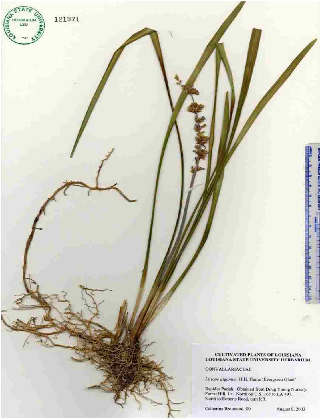
Figure 4.7 Herbarium Mount of Liriope gigantea 'Evergreen Giant'.