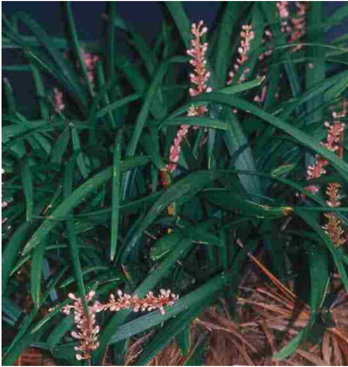
Liriope exiliflora 'Samantha'