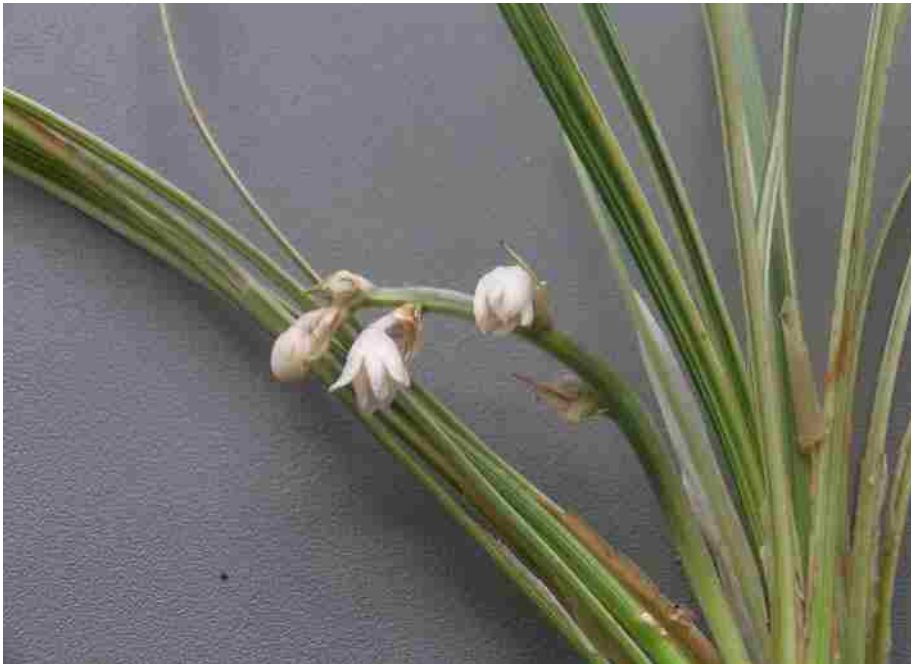
Ophiopogon japonicus 'Silver Mist'