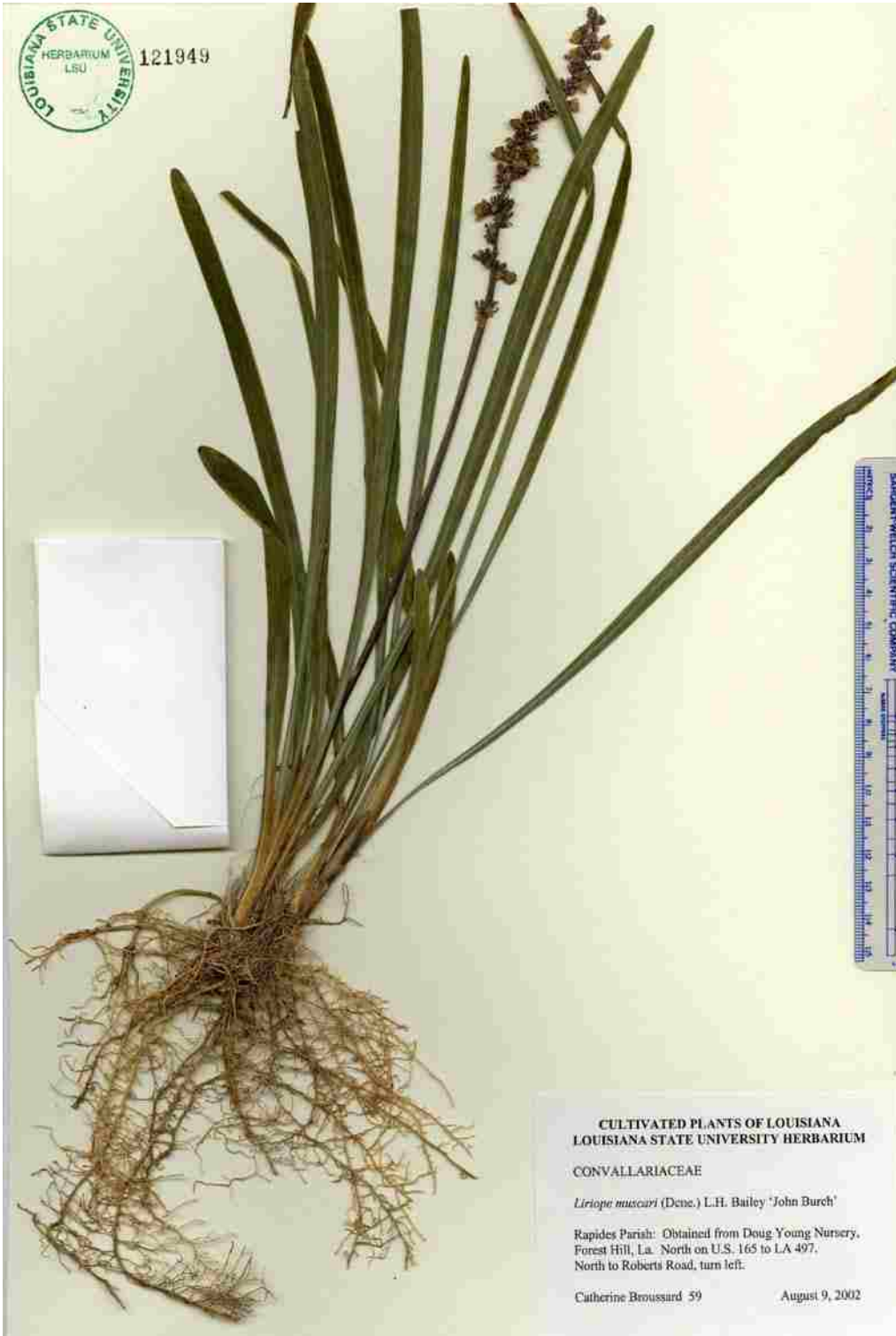
Figure 4.8 Herbarium Mount of Liriope muscari 'John Burch'.