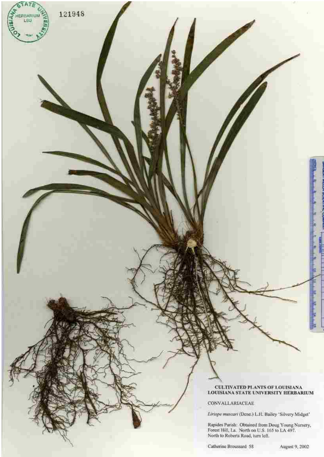
Figure 4.17 Herbarium Mount of Liriope muscari 'Silvery Midget'