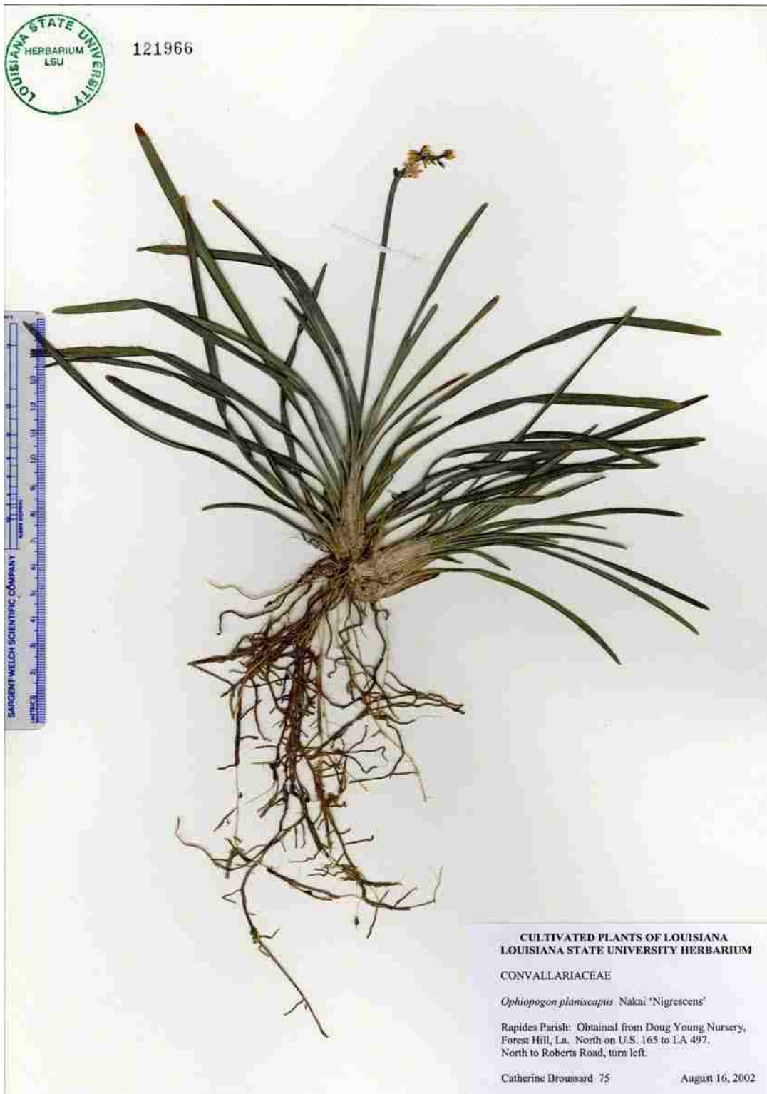
Figure 4.10 Herbarium Mount of Ophiopogon planiscapus