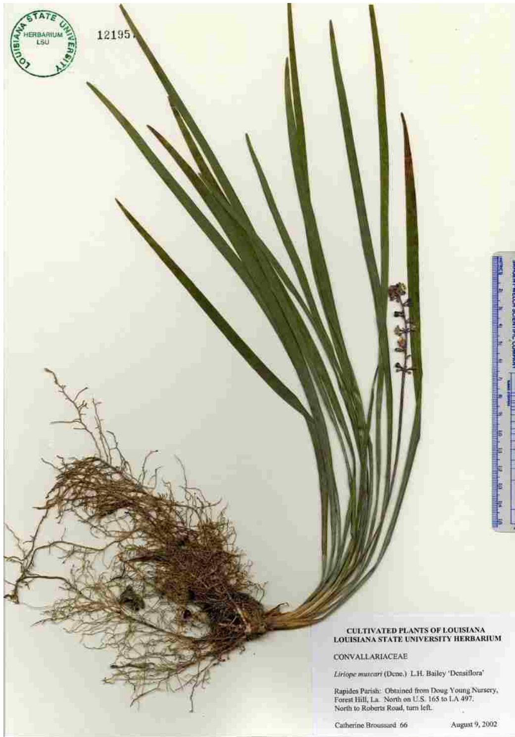
Figure 4.6 Herbarium Mount of Liriope muscari 'Densiflora'.