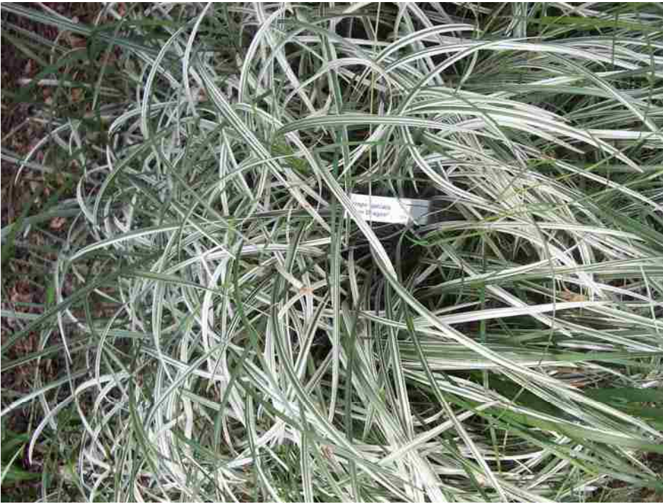
Liriope spicata 'Silver Dragon'