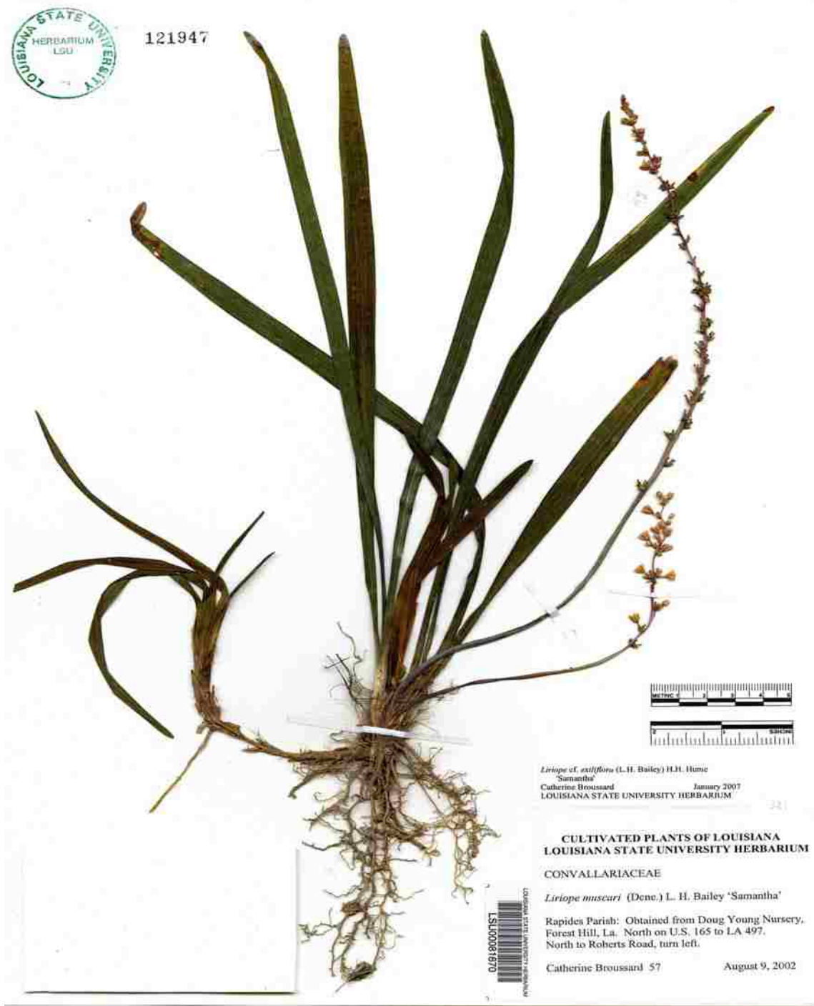
Figure 4.15 Herbarium Mount of Liriope cf. exiflora 'Samantha'.