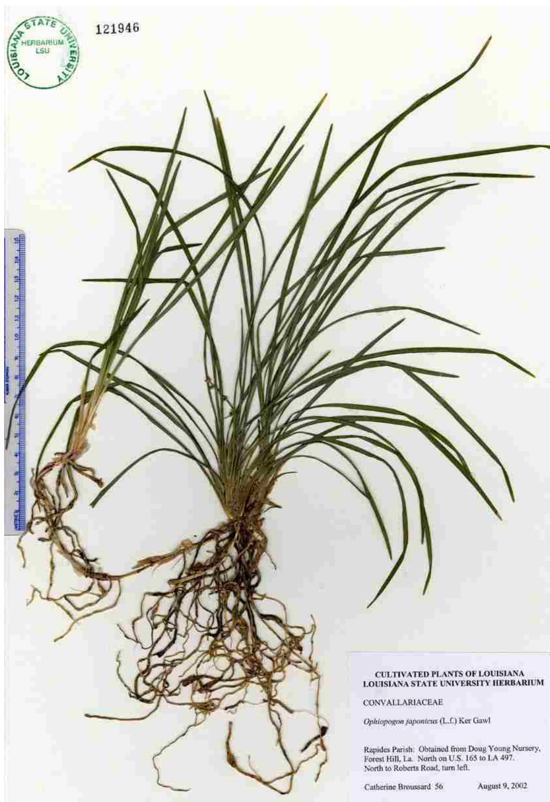
Figure 4.9 Herbarium Mount of Ophiopogon japonicus .