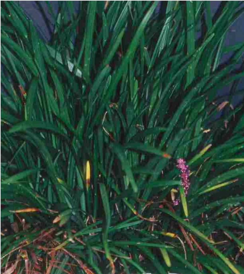
Liriope muscari 'Densifolia'