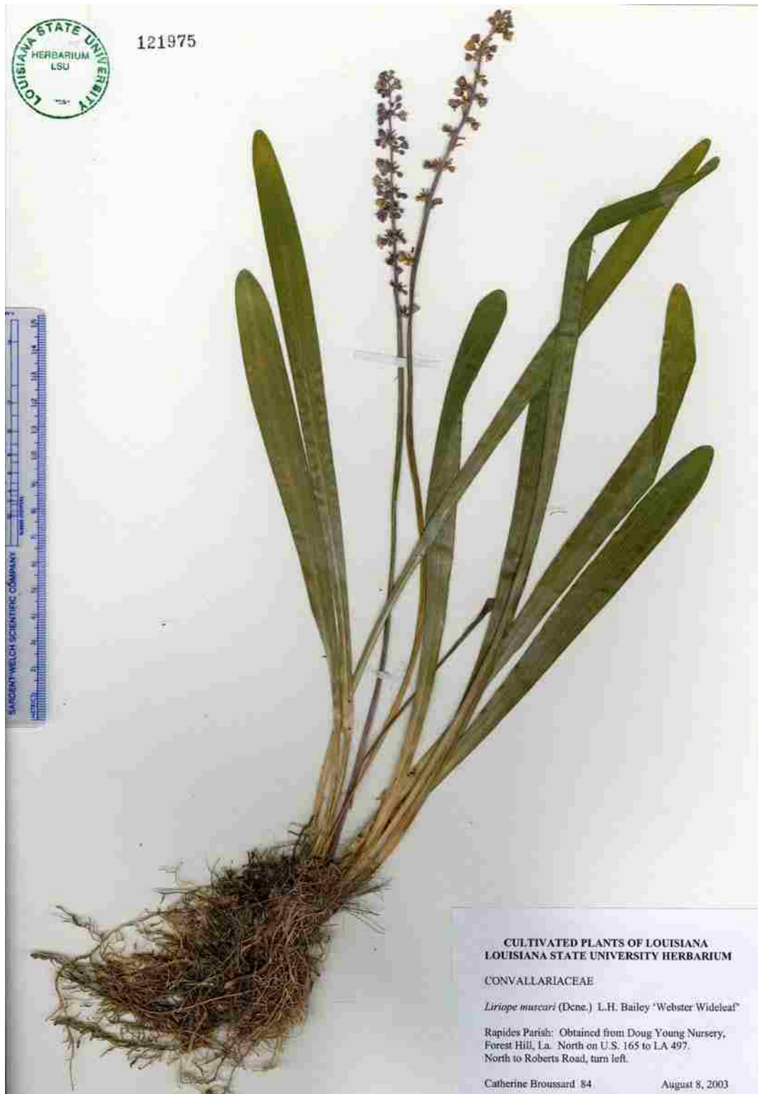
Figure 4.21 Herbarium Mount of Liriope muscari 'Webster Wideleaf'