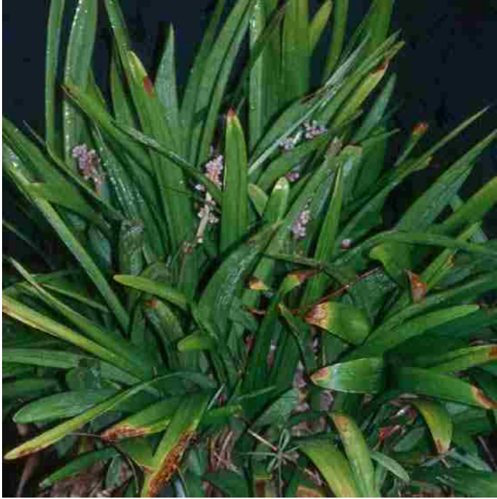
Liriope muscari 'Wideleaf Webster'