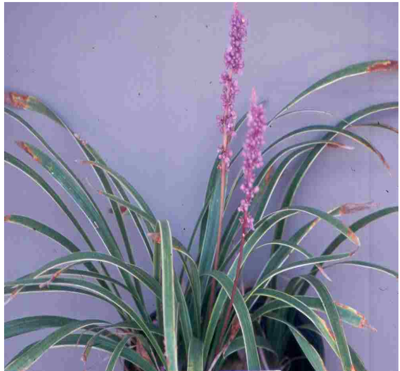
Liriope muscari 'John Burch'