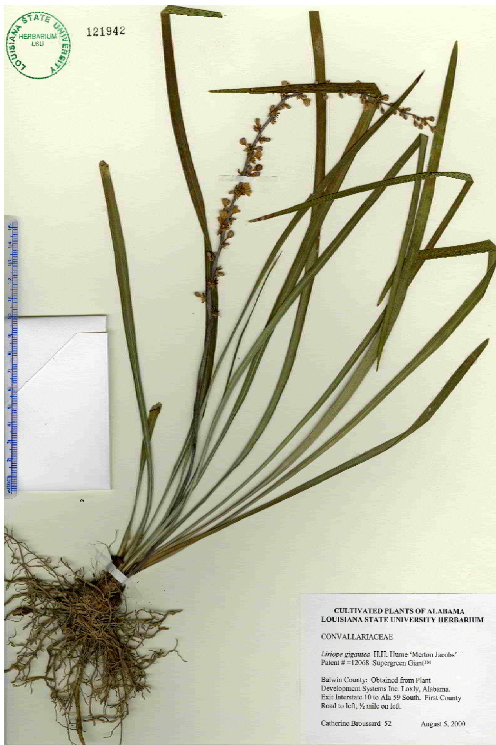
Figure 4.19 Herbarium Mount of Liriope gigantea 'Merton Jacobs' Supergreen™