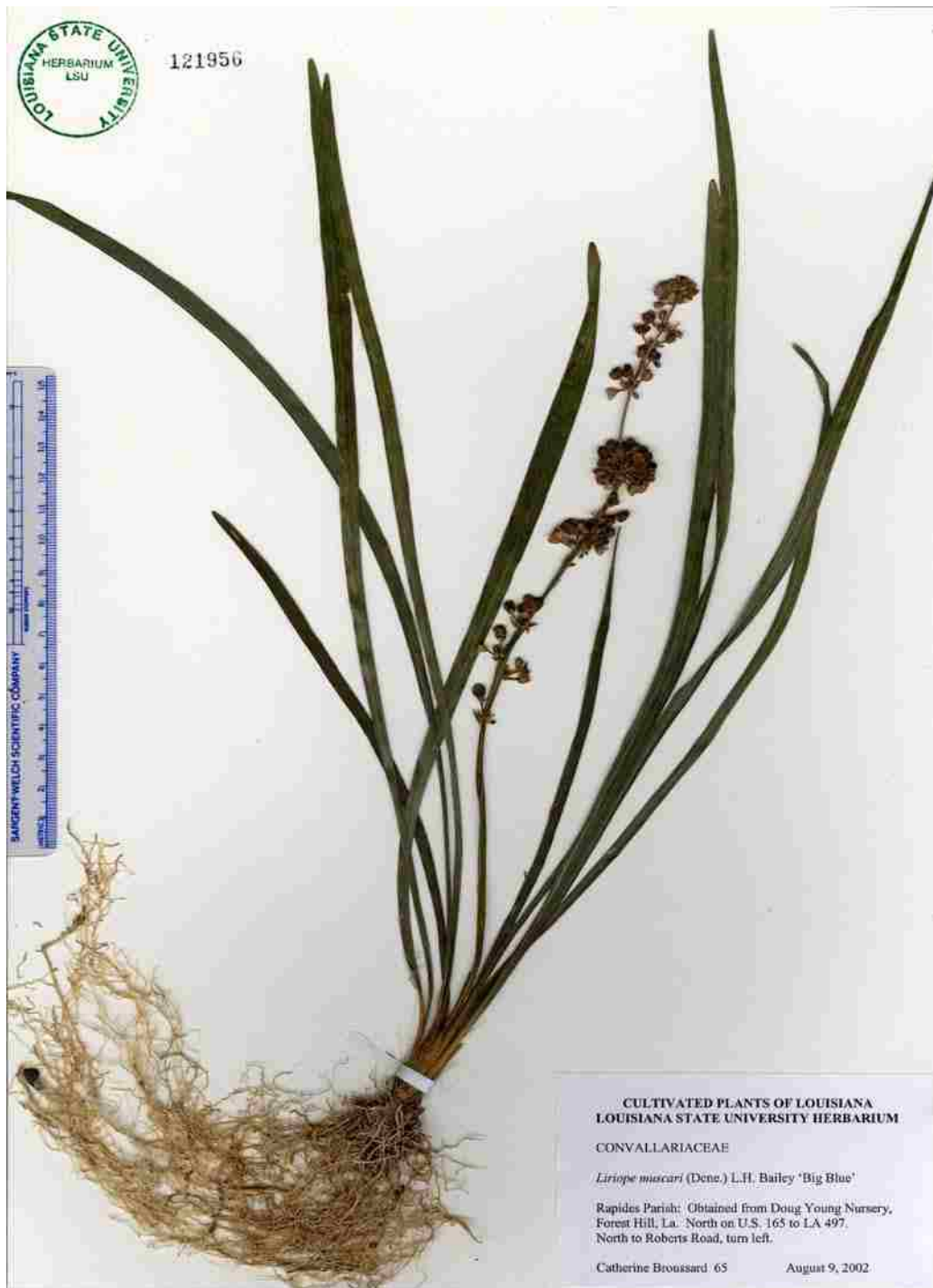
Figure 4.4 Herbarium Mount of Liriope muscari 'Big Blue'