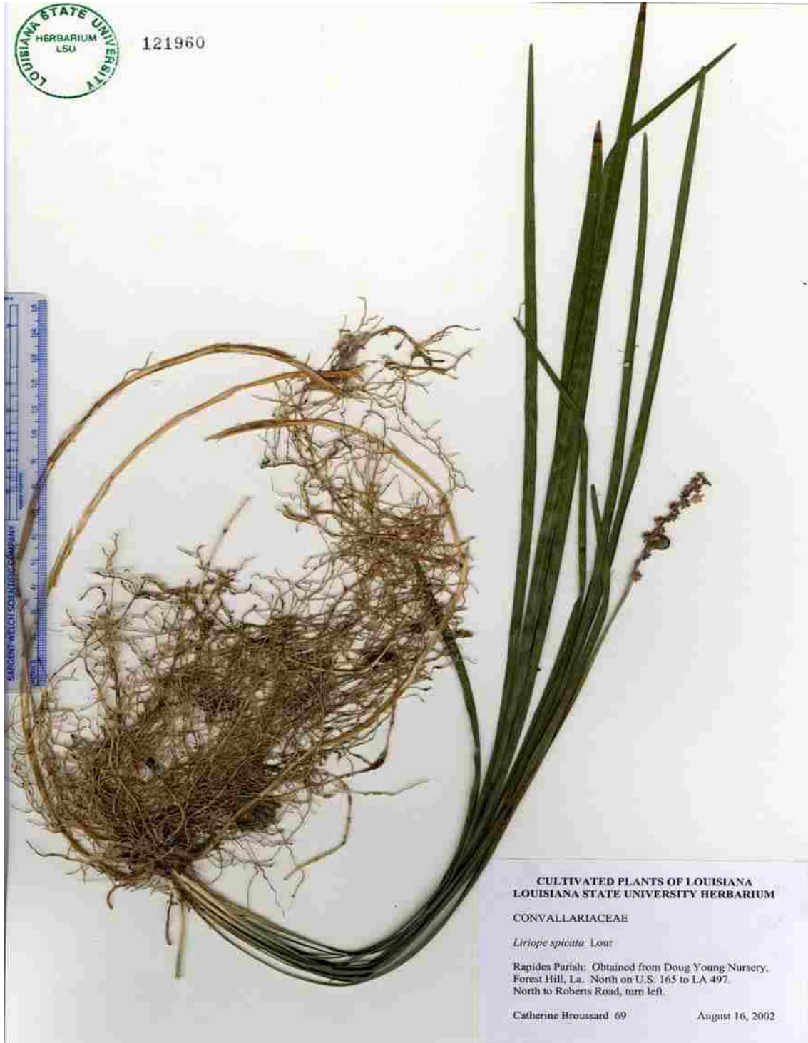
Figure 4.18 Herbarium Mount of Liriope spicata