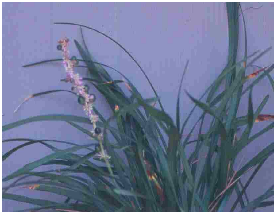
Liriope muscari 'Big Blue'