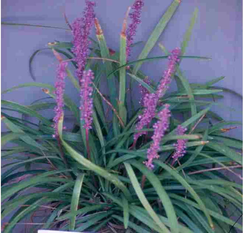
Liriope muscari 'Royal Purple'