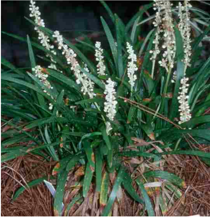
Liriope muscari 'Monroe White'