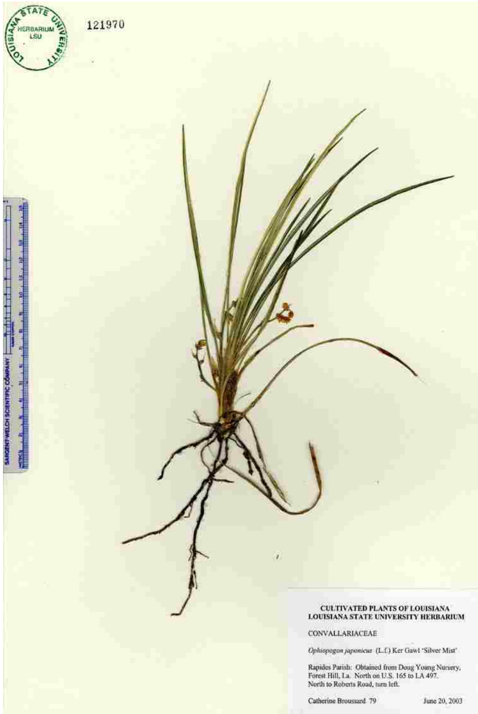
Figure 4.12 Herbarium Mount of Ophiopogon japonicus 'Silver Mist'