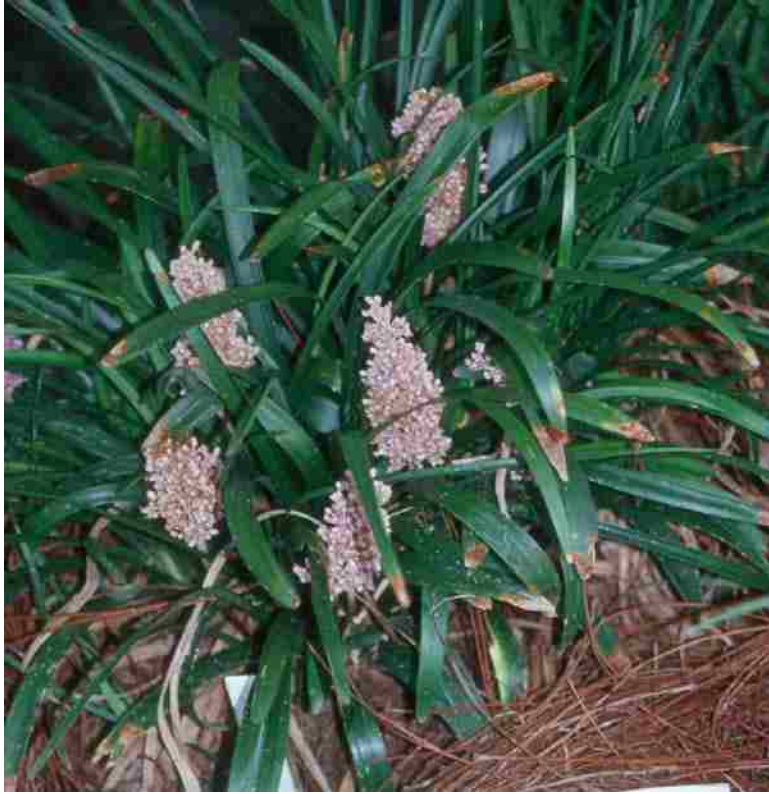
Liriope muscari 'Christmas Tree'