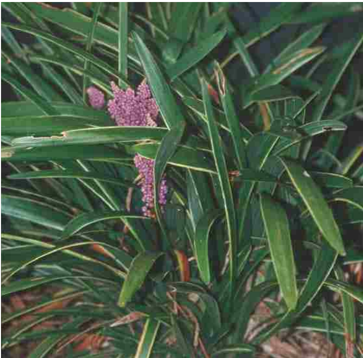
Liriope muscari 'Silvery Midget'