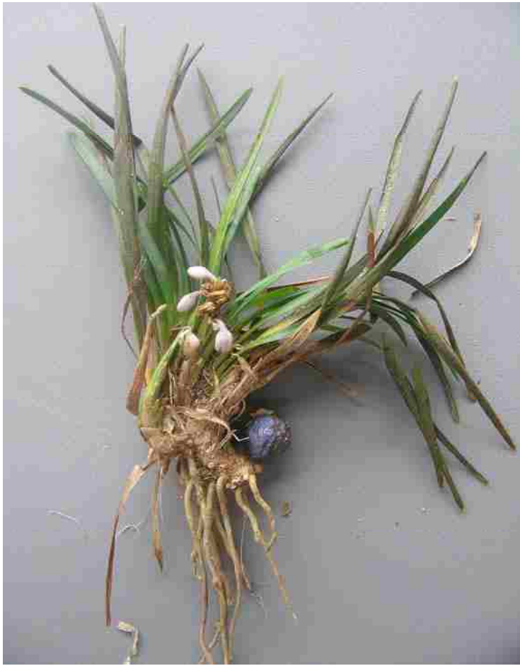
Ophiopogon japonicus 'Nana'