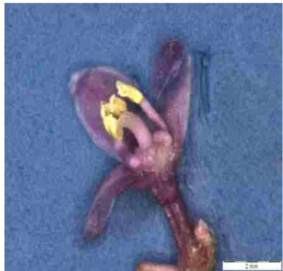
Figure 4.2 Liriope flower.