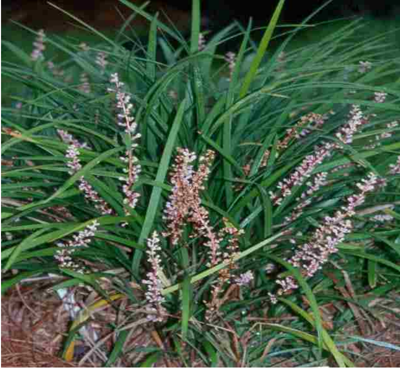
Liriope gigantea 'Merton Jacobs' Supergreen Giant™