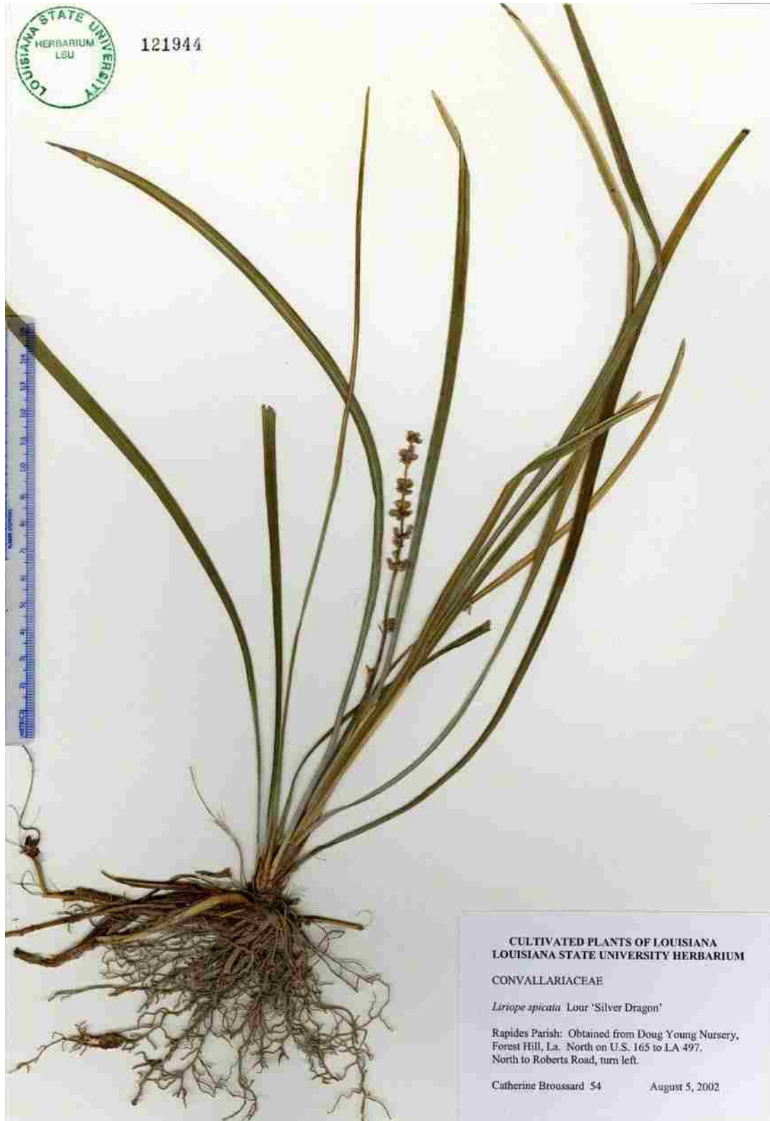
Figure 4.16 Herbarium of Liriope spicata 'Silver Dragon'