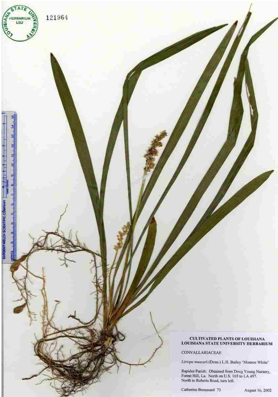
Figure 4.13 Herbarium Mount of Liriope muscari 'Monroe White'