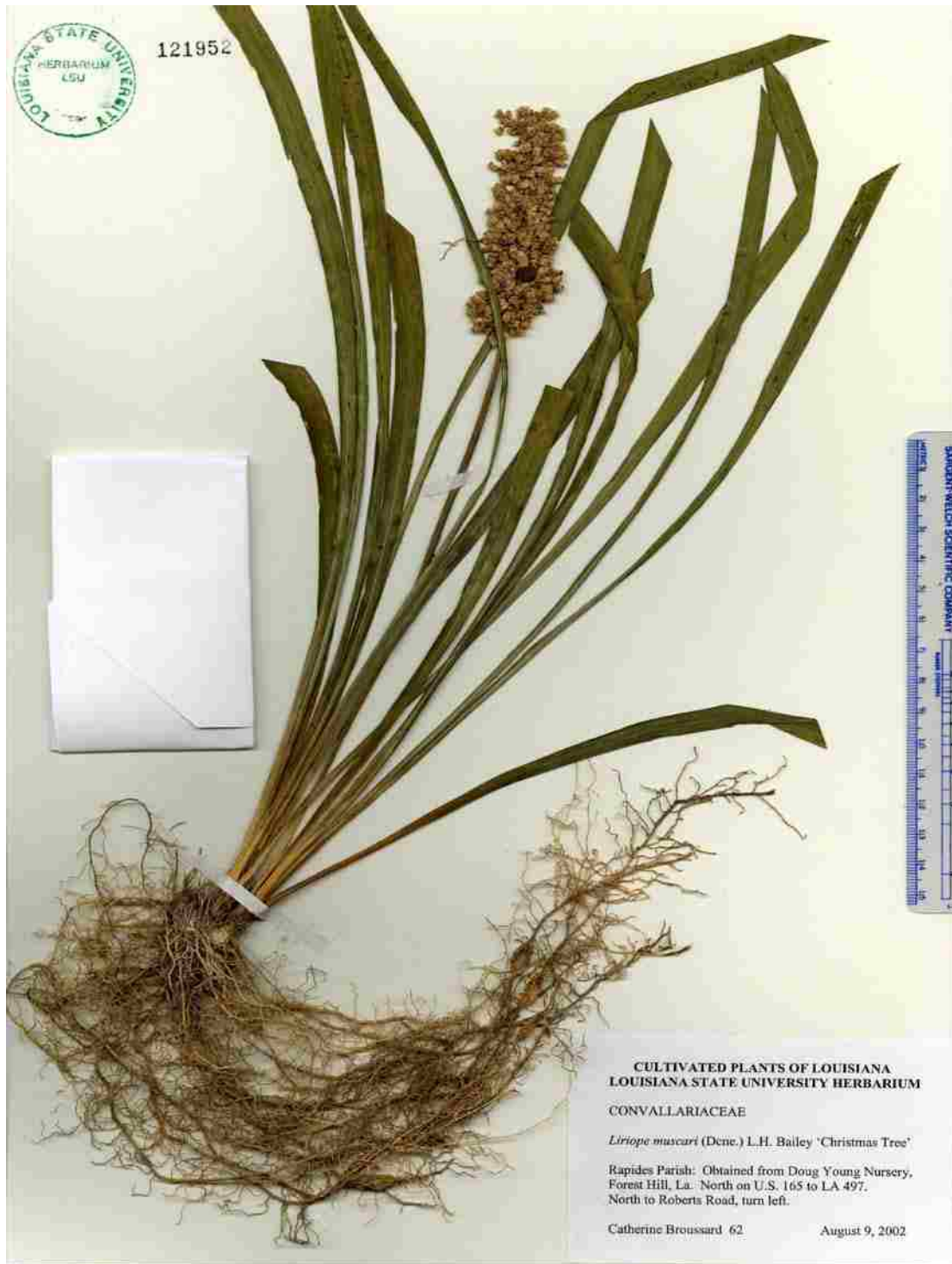
Figure 4.5 Herbarium Mount of Liriope muscari 'Christmas Tree'