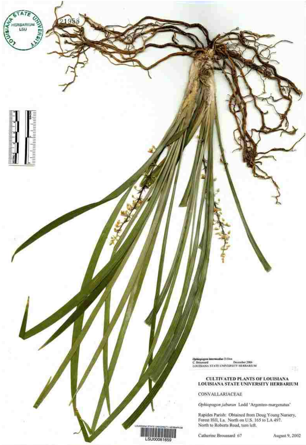
Figure 4.3 Herbarium Mount of Ophiopogon intermedius