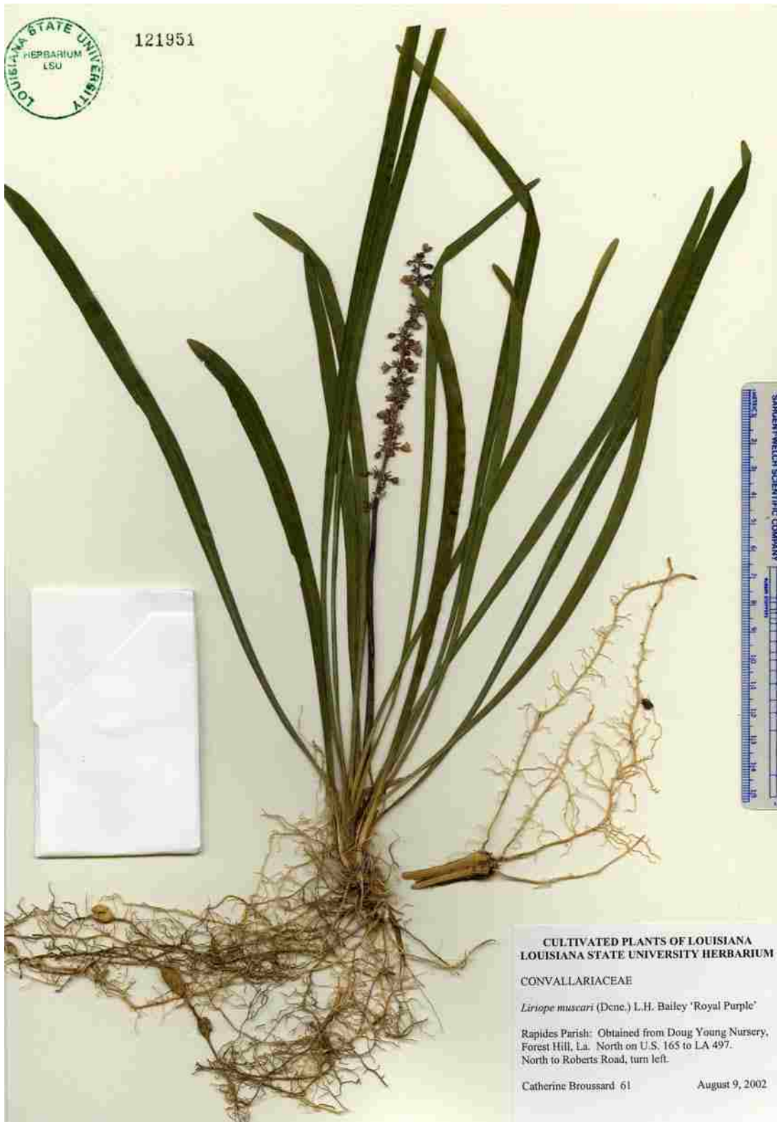
Figure 4.14 Herbarium Mount of Liriope muscari 'Royal Purple'