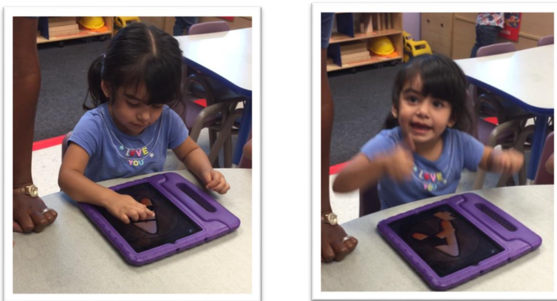
Figure 2. Interaction with teacher as the child uses a puzzle recognition app. The teacher began the process by taking turns with the little girl to get her started on the puzzle. The little girl then moves a puzzle piece in the first frame to complete the top of the A. As the piece falls successfully into place, the little girl shows her joy by giving her teacher a thumbs up after the interactions with the teacher helped her achieve a successful outcome.

Engagement at varying levels. During every observation, the iPads engaged the attention of an individual student or groups of children while the device was in use. The kids were eager to choose them, and when they were finished using them, either by choice or teacher direction, they stopped using them and went to another preferred activity. During one observation, a little girl used a letter game within an online app called ABCMouse. She took puzzle pieces and moved them together until they formed a particular letter. If she moved a piece unsuccessfully, the piece would move back to its original location. Sometimes the teacher would help and point out characteristics that might help join the letter together and sometimes she would not. The interactions that took place were good examples of how a teacher let a child use an app that was developmentally appropriate and utilized the concept of zone of proximal development (Vygotsky, 1978) to help the child learn. As the pieces were placed correctly, the little girl would look up to her teacher and give her a thumbs up and say, “I did it” (Figure 2).