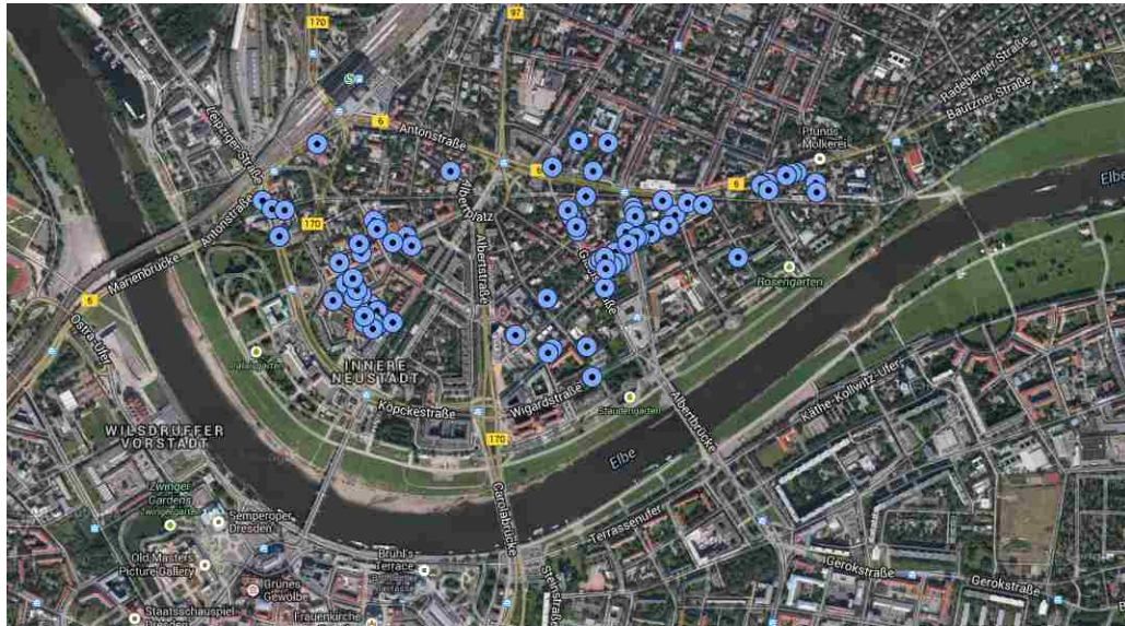
Figure 1: Vacant Housing in Dresden's inner new town, November 1984. 21

exception, however, is provided by the case study of Dresden, where one diligent official in the city's KWV compiled a comprehensive list of the empty housing stock and illegally squatted apartments in the city's Innere Neustadt (inner new city). As of November 1984, some 230 empty properties had been identified in the district, which had been boarded up by the city's Building Control Department ( Baupolizeilich gesperrt ) (see figure 1). Of this number, 18 – or eight per cent – had been illegally occupied by squatters (see figure 2). 20 As we can see from figure , the illegal squats are clustered in two distinct geographically constrained areas; their spread is not as extensive as that of the district's vacant housing as a whole. This, in addition to further evidence cited elsewhere, suggests if not a community of squatters then at least the existence of informal networks through which information about empty properties was spread.