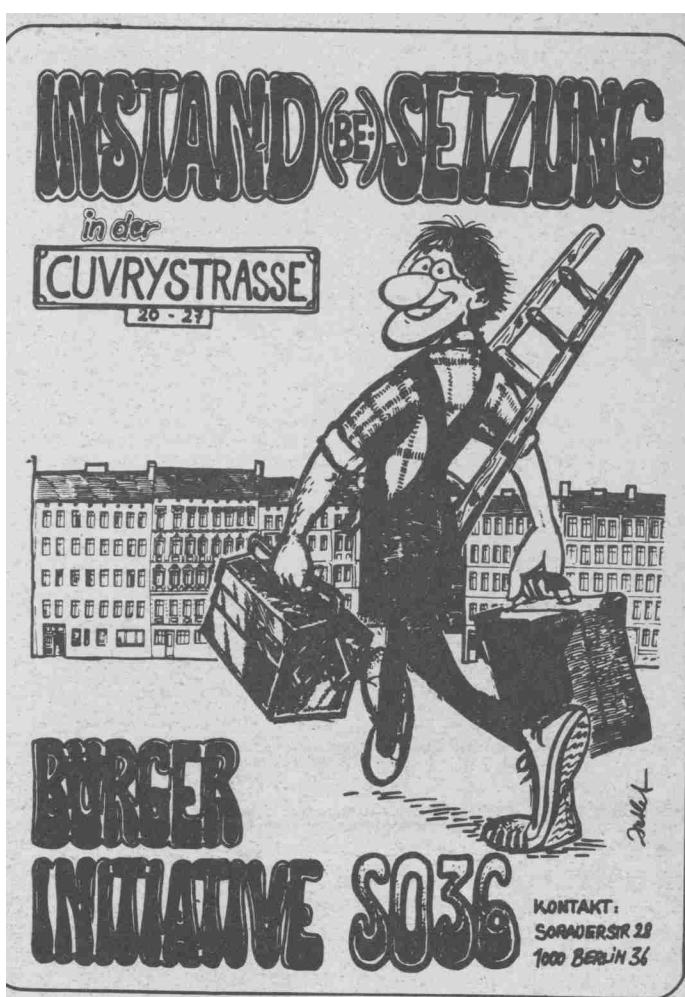
Figure 1: Poster produced by the BISO36. 59

thus legitimising the action at a stroke. 57 In November 1979, the BISO36, the initiator of the first occupations, received recognition from the Kulturpolitische Gesellschaft in Bonn for its 'exemplary neighbourhood work'. 58 The initiative duly capitalised on the publicity, squatting in further buildings in Kreuzberg's Cuvrystraße shortly thereafter.