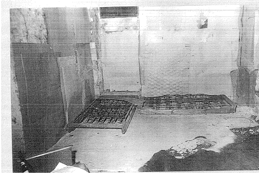
Figure : Make-shift accommodation in the basement of the 'R5'. Despite these slum-like conditions, the squat arguably played an important role in the formation and re-affirmation of its inhabitants identities.

This interest that squatting in West Germany inspired amongst those in the East was not, on the whole, reciprocated amongst squatters in the Bundesrepublik , however. Although western magazines, books and newsletters occasionally published articles on squatting in the GDR, they provided, by comparison, much more coverage of the squatter movements in neighbouring Western European countries. 114 It was much easier for squatters in West Berlin to obtain information about developments in Frankfurt or Paris than it was to find out about conditions in Friedrichshain or Prenzlauer Berg. The struggles in Western Europe and West Germany, moreover, chimed with their own. While some of the West Berlin squatters could even peer across the Cold War divide from their bedroom or living room windows, events in Amsterdam, London, Zurich, Copenhagen and the towns and cities of the Bundesrepublik were